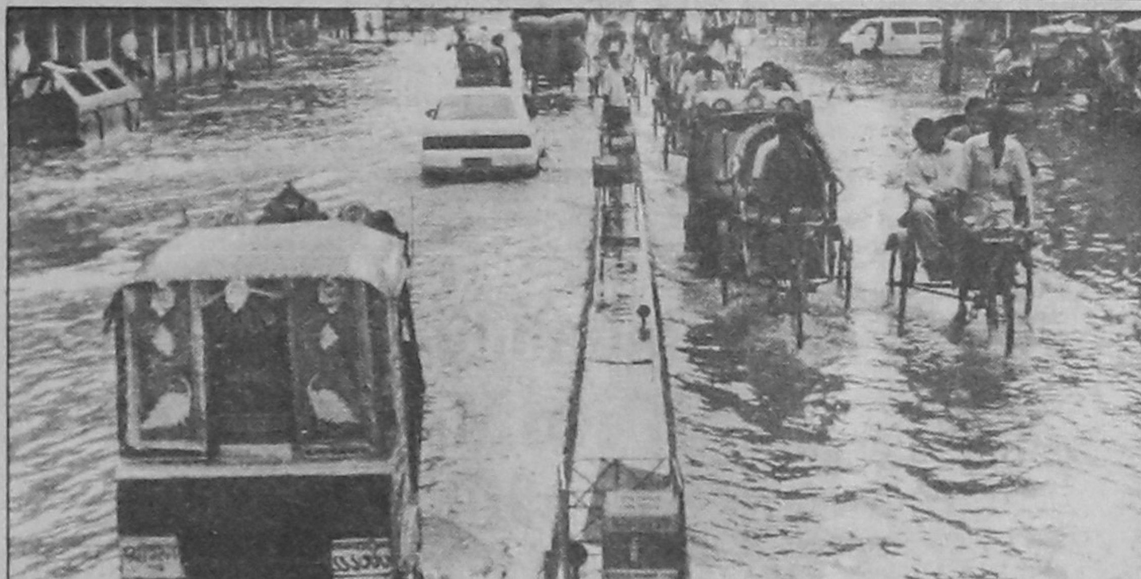
The excessive rainfall during Friday night submerged most of the city thoroughfares putting urban life in jeopardy. This photograph was taken from Rajarbagh area.

CARE operates a total of 26 projects and programmes across the country.