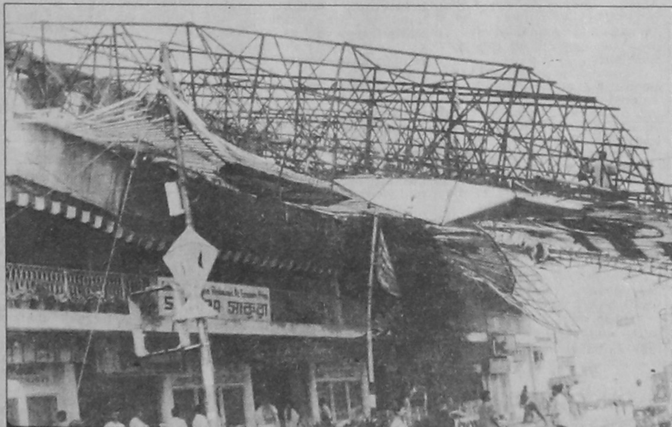
The billboard erected on top of Hotel Sakura at Shahbagh collapsed during storm that lashed the city yesterday morning.