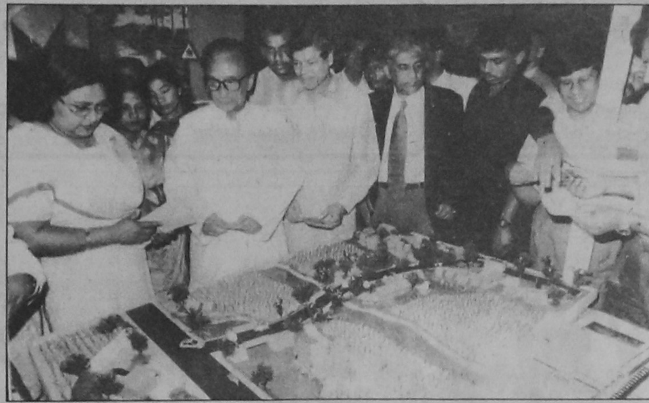
Local Government Minister Zillur Rahman taking a closer look at a project on display at the CARE Day exhibition organised by CARE, Bangladesh at the Sultana Kamal Women Sport Complex in the city yesterday.

All relatives, friends and well-wishers are requested to attend the qulqhwani.