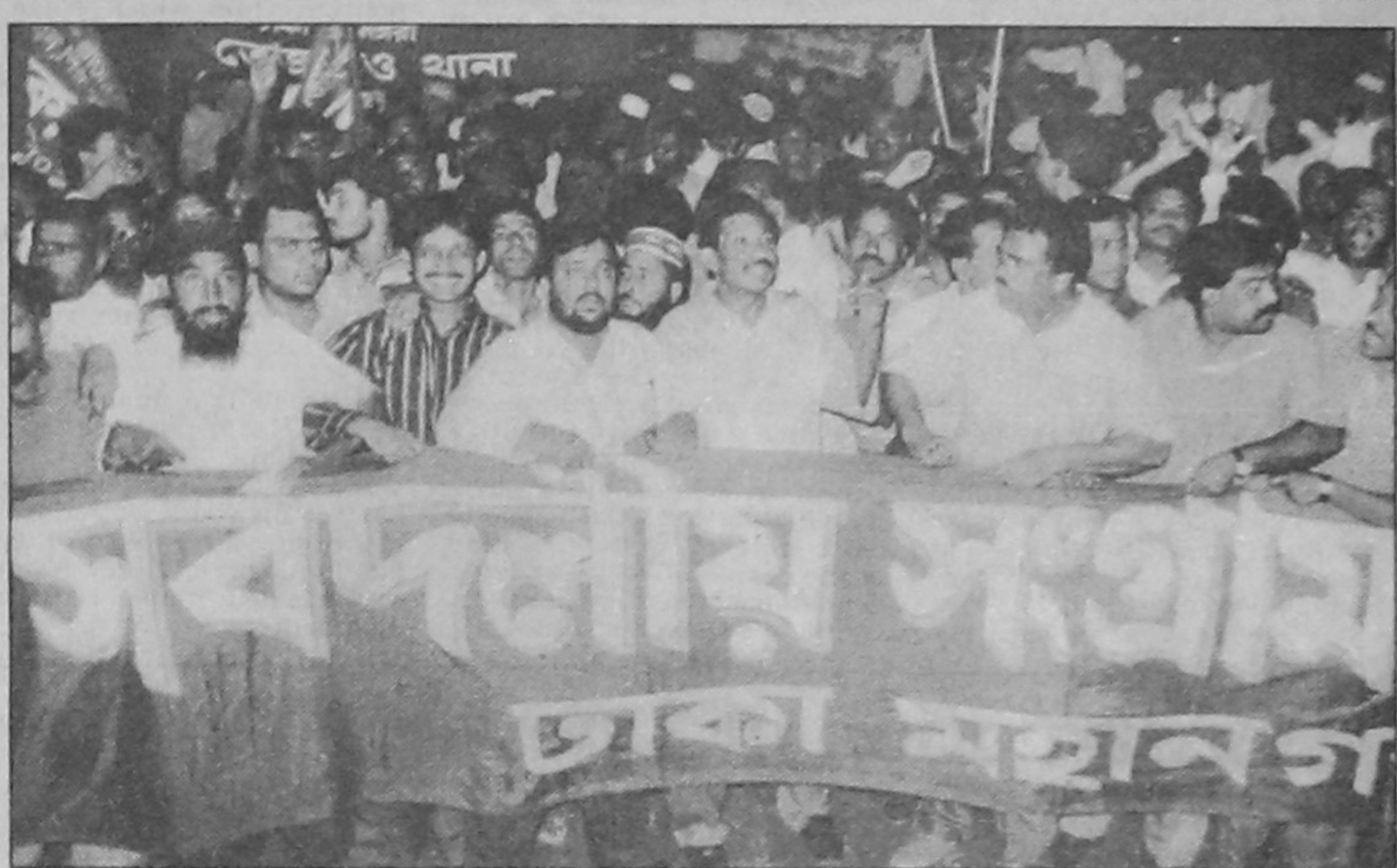
The All Party Action Council brought out a procession in the city yesterday protesting unilateral appointment of the new Chief Election Commissioner.