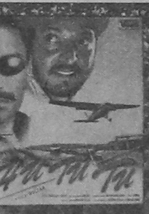
Star Box Office: Hu Tu Tu on Star Plus at 8:30 pm.

Cinema Scene 9:00 The First Edition 9:30 The Millennium Journey 10:00 IT Digest 10:30 Top Job 11:00 Serial: We Love You 11:30 Serial: Rehne Ko Ghar Nahi 12:00 TV Brand 12:30 Serial: Bajaj Payal 1:00 Be Happy 1:30 Fun In The Kitchen 2:00 Vividha 2:30 Hindi Feature Film: 2:55 News In Urdu 5:00 Circus 6:00 Dennis The Menace 6:30 Mickey & Donald 7:00 Rich For A Rainbow 7:30 Dum Dum Diga Diga 8:00 Beauty 2000 8:30 Savera 9:00