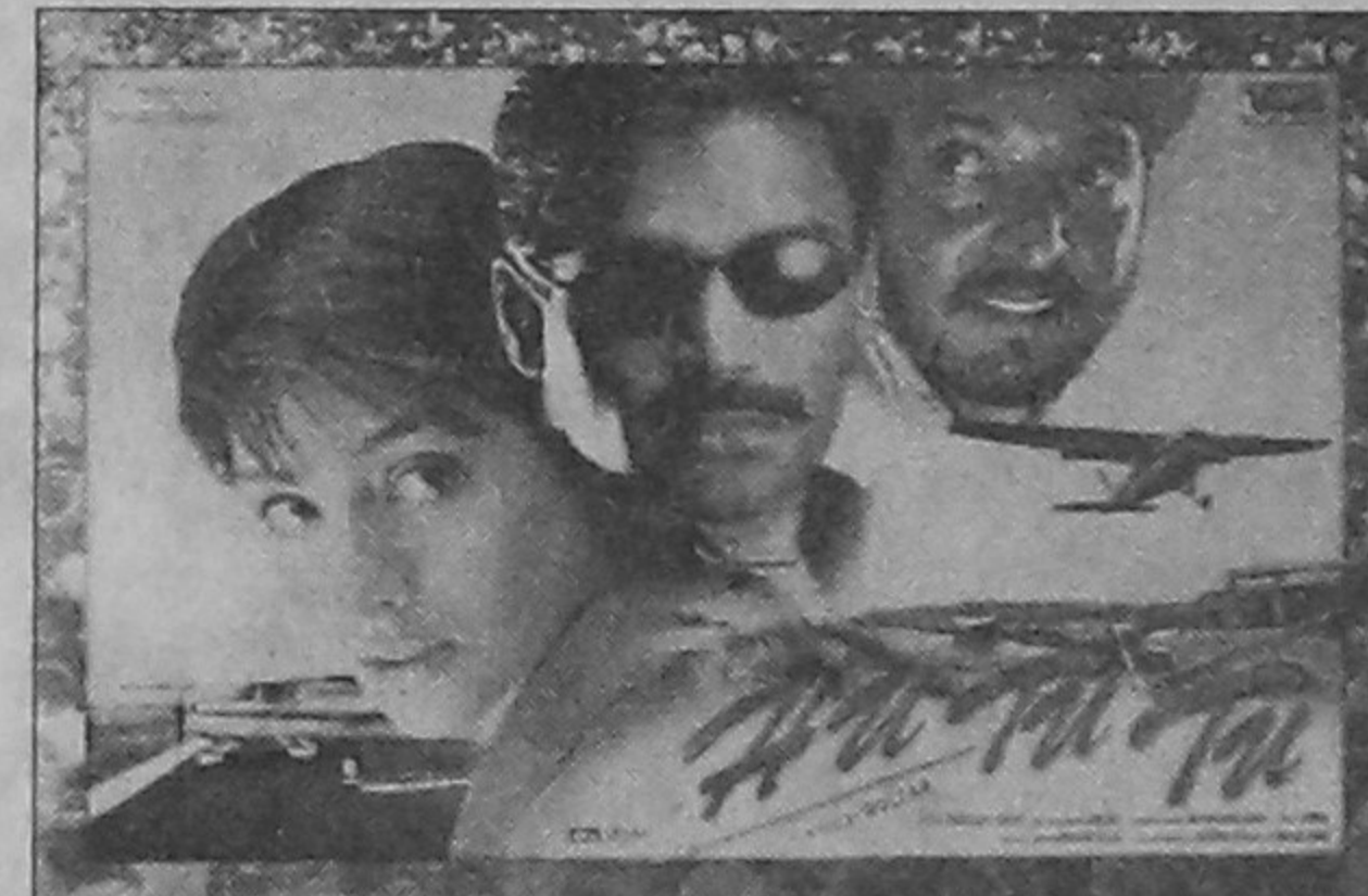
Star Box Office: Hu Tu Tu on Star Plus at 8:30 pm.