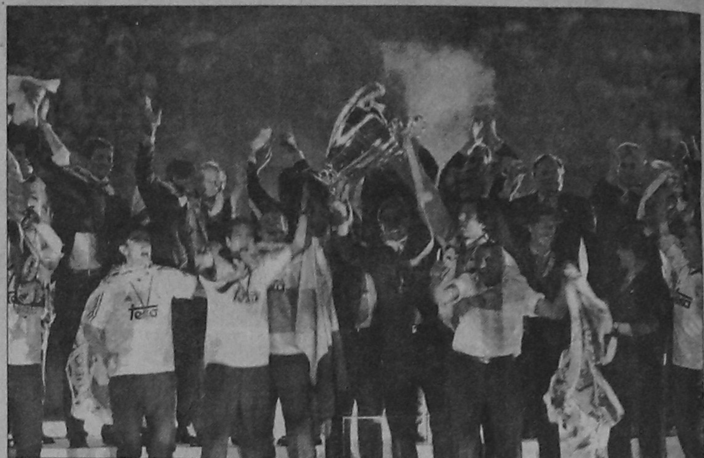
Real Madrid players and officials celebrate with the Champions' League trophy at the Bernabeu Stadium after arriving in Spain from Paris on May 25.

"One shouldn't hold grudges," Bayern vice-president Karl-Heinz Rummenigge said. "I know what he did then was not right."