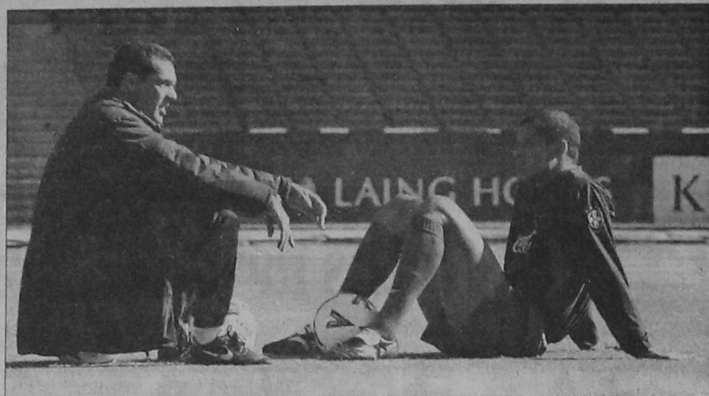
Brazil coach Wanderley Luxemburgo (L) talks to superstar Rivaldo before the start of a practice session at Wembley in London on May 25. Brazil meet England in a friendly international today.

"We would like to take the view that someone is innocent until proved guilty and we understand there are no claims that he was involved in match-fixing."