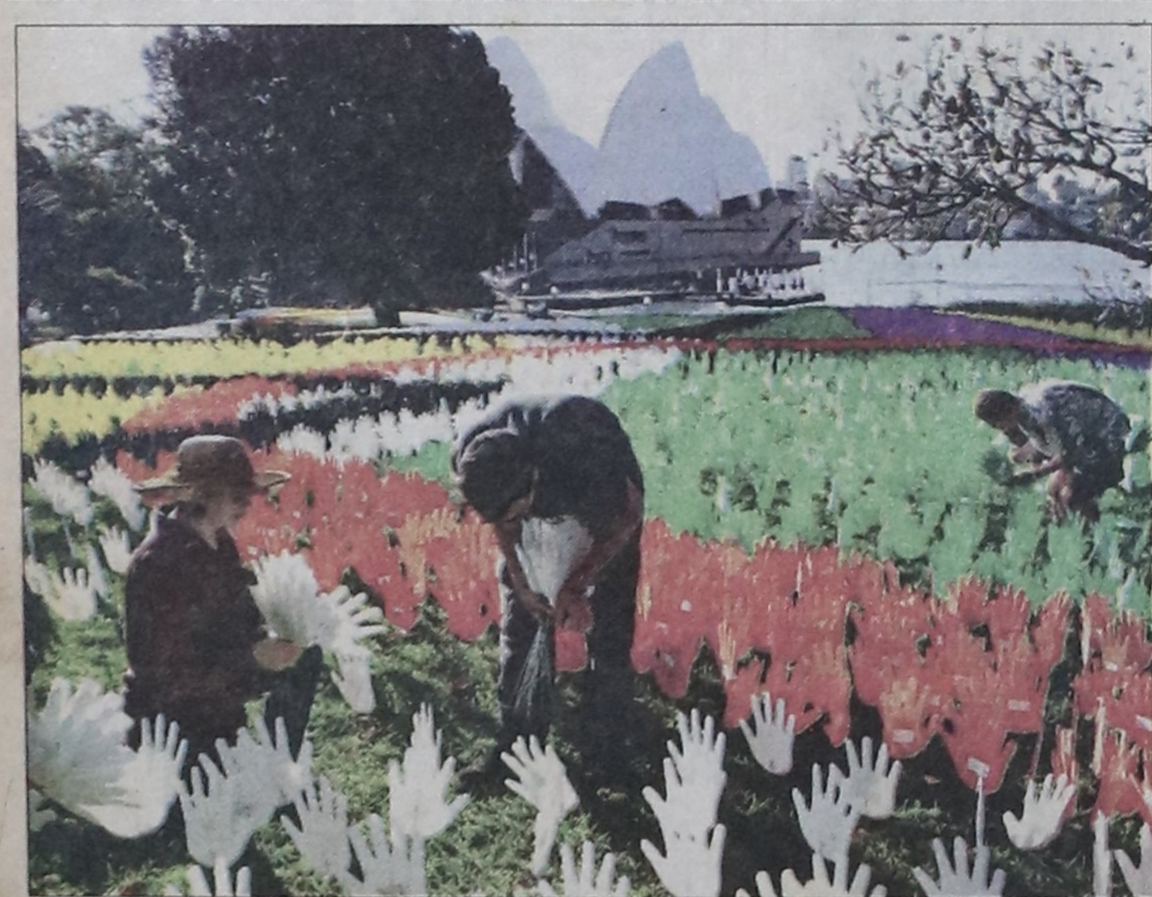
Plastic hands provide a multi-coloured display as volunteers plant 120,000 of them on the lawn of the Royal Botanic Gardens in Sydney yesterday. The hands symbolise non-indigenous support for Aboriginal native title and reconciliation. Corroboree 2000 beginning today is a celebration of reconciliation and will include a People's Walk tomorrow, when 100,000 supporters are expected to walk across the Sydney Harbour Bridge.

His condition was improving at the time of writing this report last night.