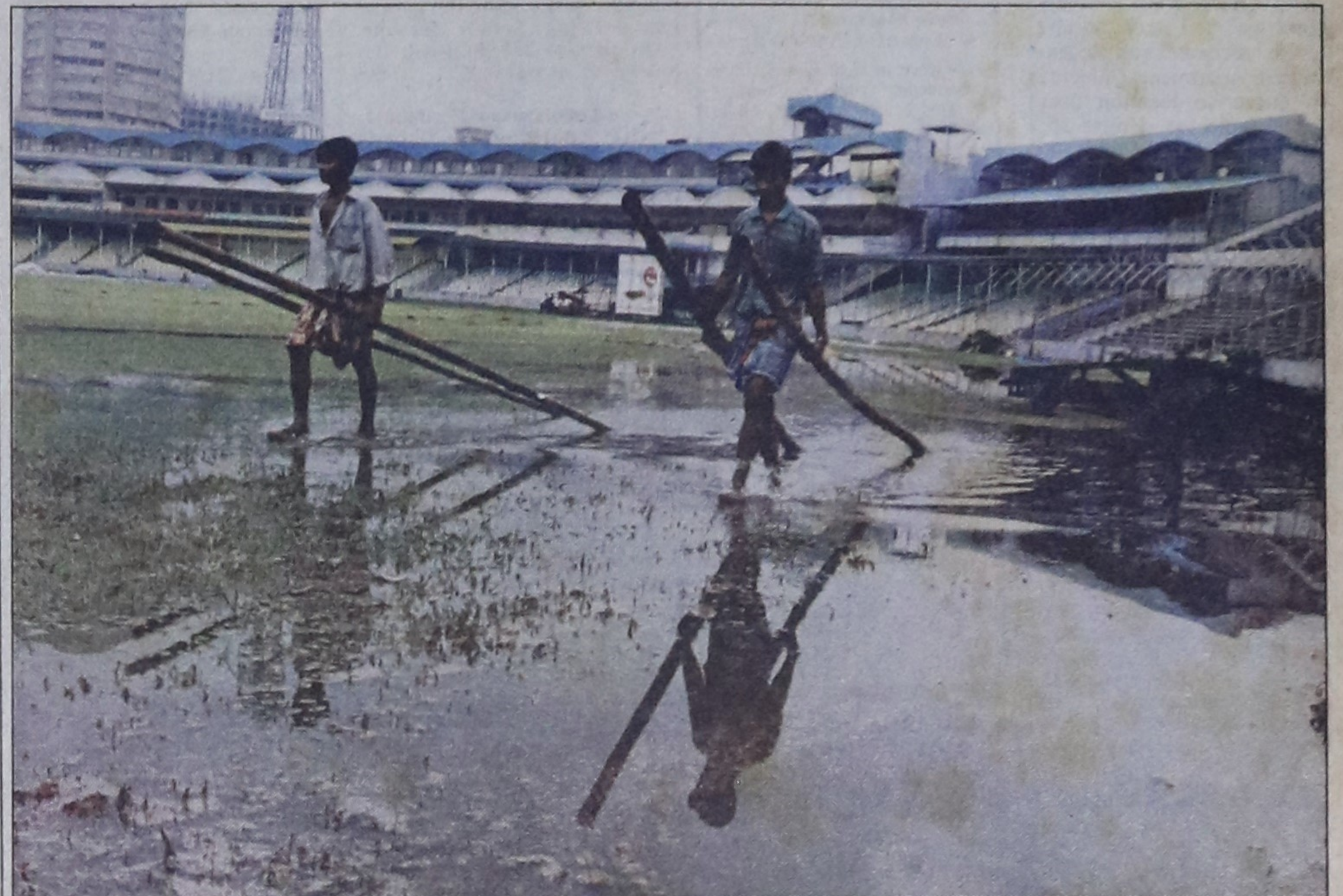
Big puddles at big bowl

The Lankans, who have won the Asia Cup twice in 1986 and 1997, were the first among three Asian giants to reach the capital. India, the four times champions in the previous six editions, are expected to reach on May 28 while Pakistan, who will fly in straight from West Indies, are likely to arrive on June 1.