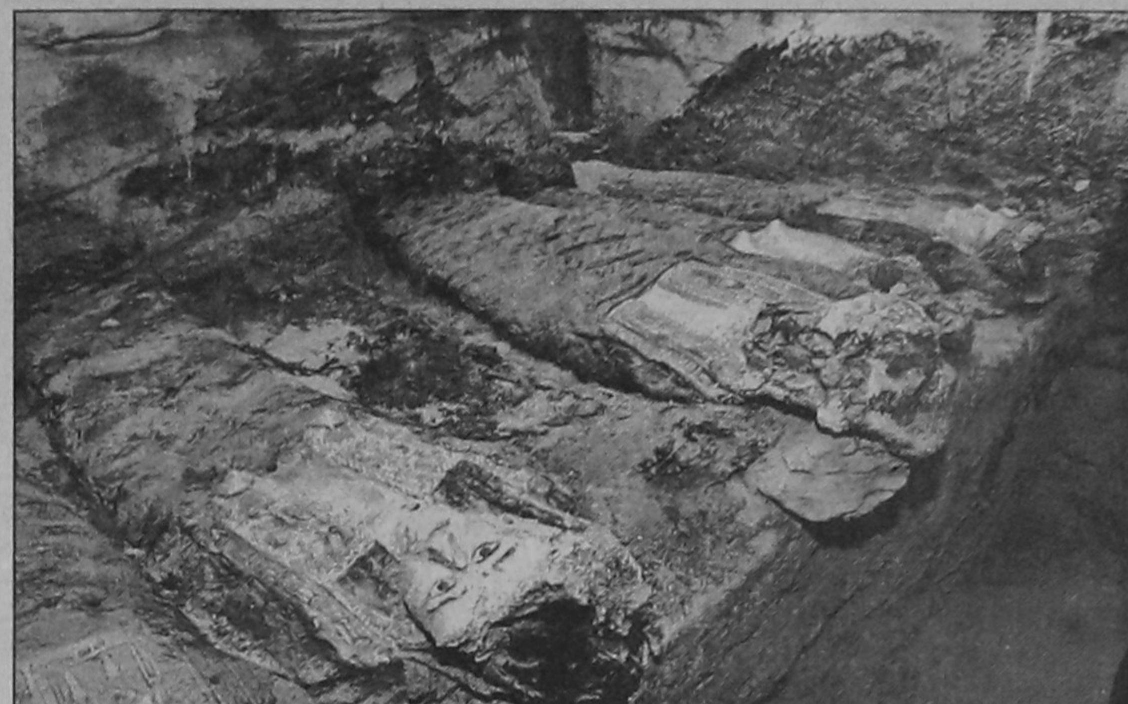
Picture taken on May 24 shows mummies recently found in one of the seven newly uncovered tombs in the Bahriya oasis, in Egypt's western desert.

In Sri Lanka even if the LTTE guerrillas overrun Jaffna, the former Tamil stronghold in the north of the island.