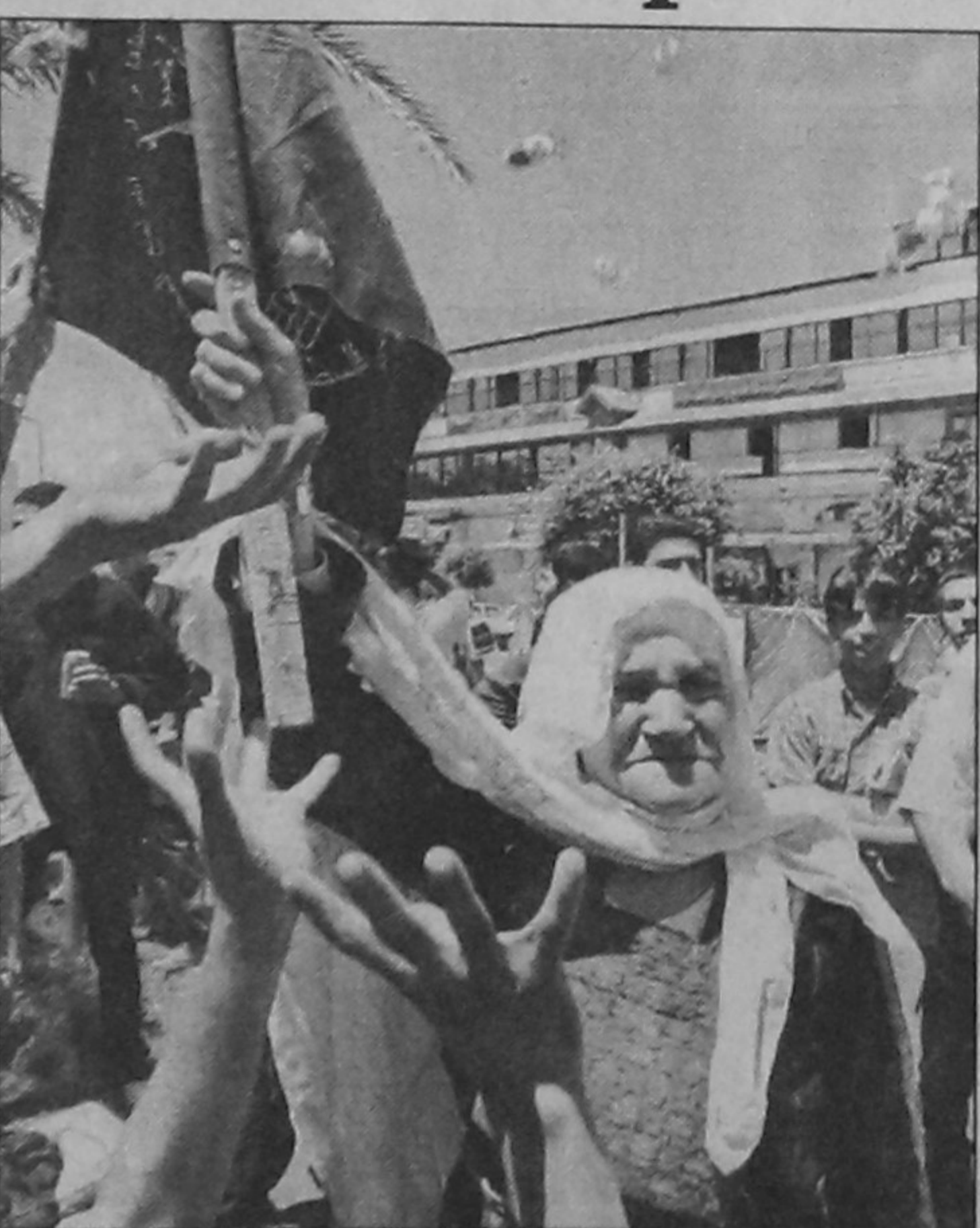
An elderly Palestinian woman waves the Islamic Jihad movement's flag as boys try to catch sweets thrown in the air yesterday in Gaza City to celebrate the completion of Israeli withdrawal from south Lebanon overnight, ending 22 years of occupation.