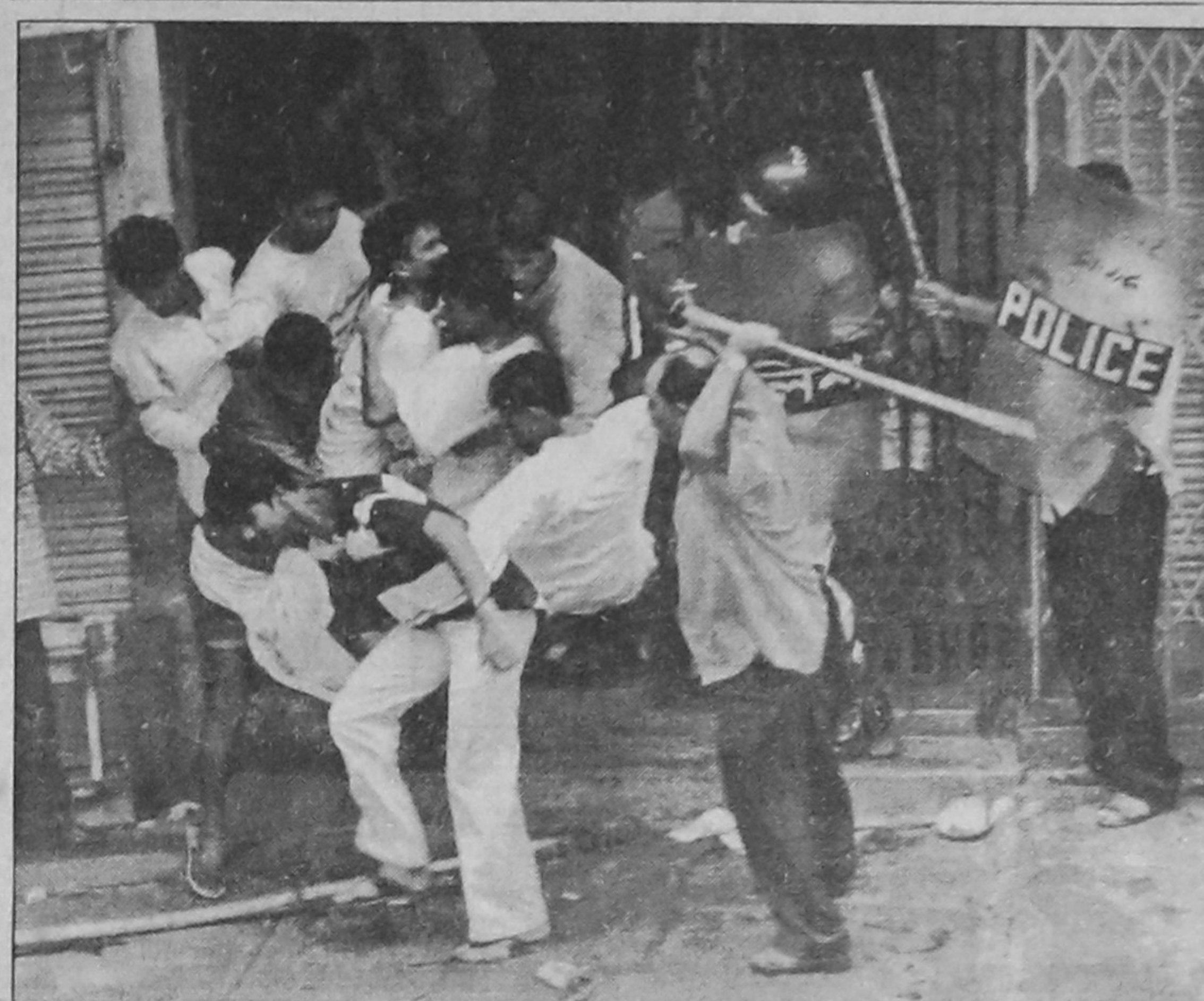
Police beat cricket fans at the Islampur branch of Al Baraka Bank after they scrambled for Pepsi Asia Cup tickets yesterday.