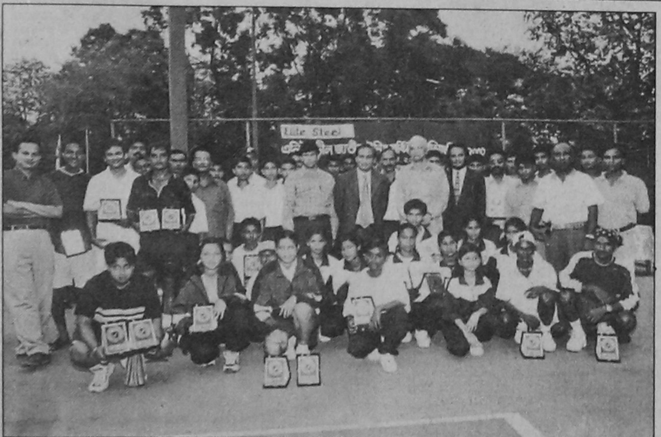
Winners of the National Tennis Circuit Leg-2 pose with their trophies at the National Tennis Complex at Ramna yesterday.

Demand for the Matildas calendar outstripped supply.