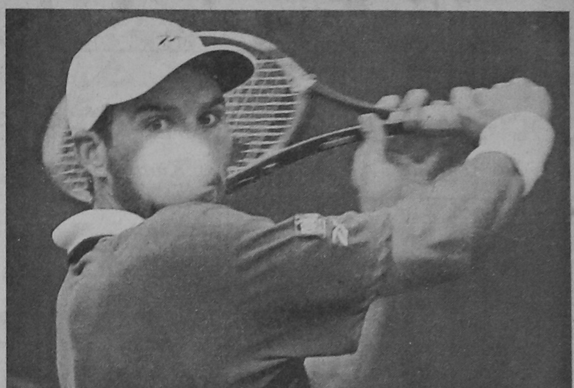
Australian Patrick Rafter is about to make a backhand return against Spaniard Felix Mantilla in their World Team Cup engagement in Duesseldorf, Germany on May 22. Rafter lost the match 2-6, 4-6.

The Ghana Football Association invited the two to strengthen the Black Stars in their preparation for the 2002 World Cup qualifying series which will begin in June.