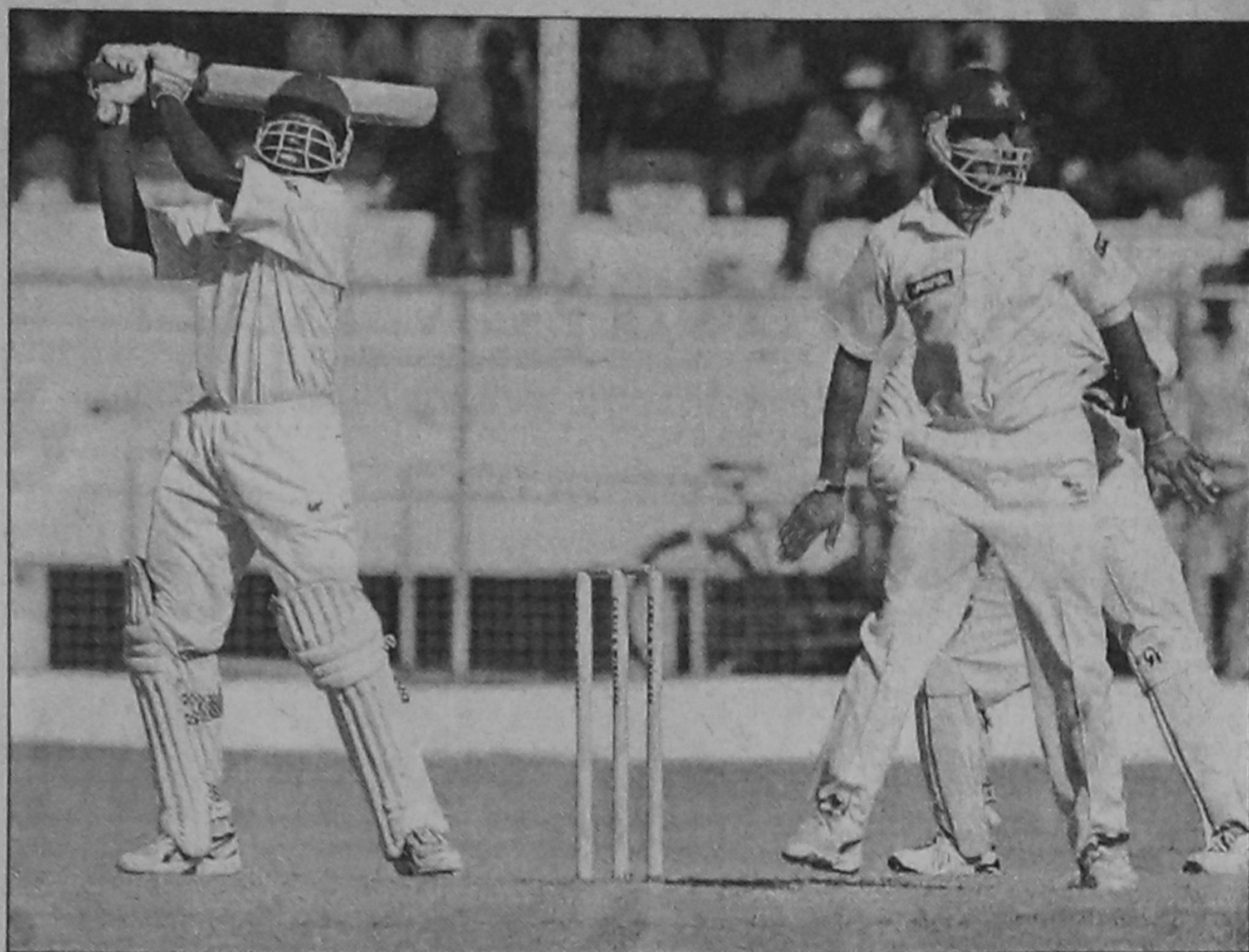
West Indies' Wavell Hinds, who was adjudged man-of-the-match, drives one on way to his match-saving half century in the second innings against Pakistan in the second Test at Bridgetown on May 22.

"I'll see if I appreciate the new coach and if he wants me to stay. Everything depends on the next coach and the next president."