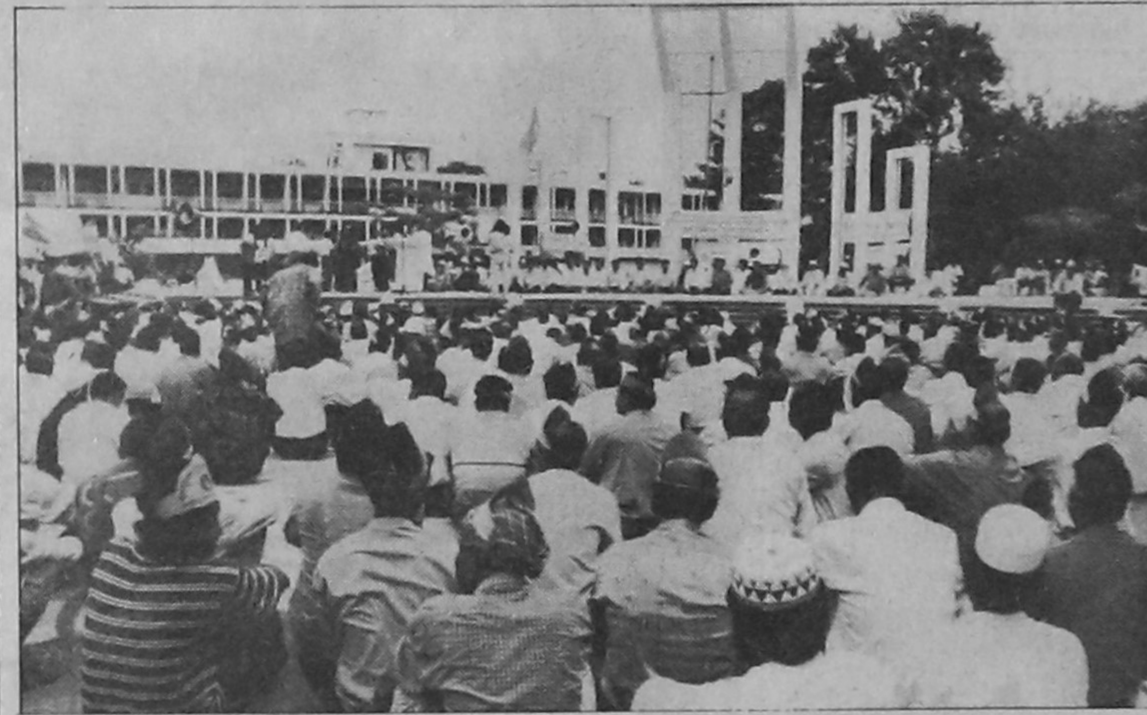
Muktijoddha Sangsad held a rally at the Central Shaheed Minar yesterday demanding immediate execution of verdict in the Bangabandhu murder case.