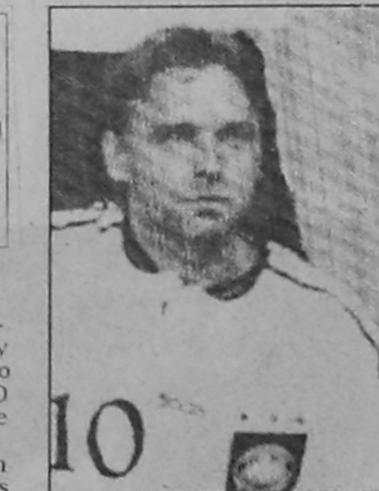
HASSLER ... recalled

Stand by: Stefan Beinlich (Bayer Leverkusen), Mustafa Dogan (Fenerbahce/Tur), Mar-