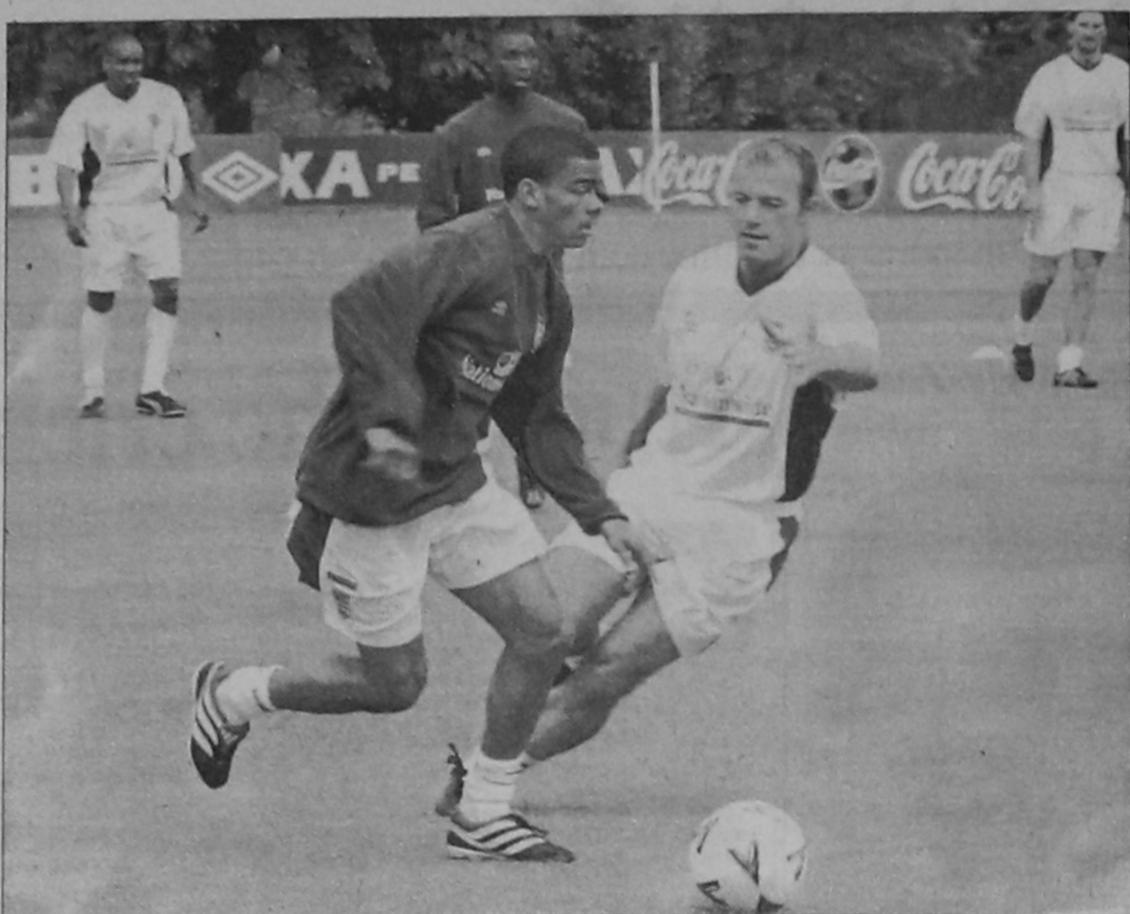
England defender Kieron Dyer (L) trying to keep striker Alan Shearer at bay during a training session of the national squad at Bisham Abbey yesterday.

At Jamalpur, Sherpur played to a one-all draw with Netrokona.