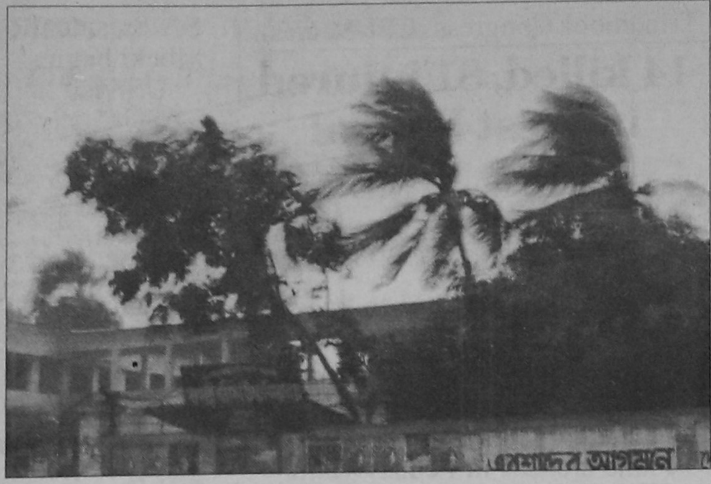
Relief shower Magura town dwellers heaved a sigh of relief following a brief shower on May 17 after prolonged hot spell. Gusty wind accompanied the rains.

women of a labour family died of diarrhoea. On the issue of her death labourers attacked on the Manager and the Assistant Manager and beat them up mercilessly. The management had called police of Moulvibazar police station, but no action was taken by police in this regard.