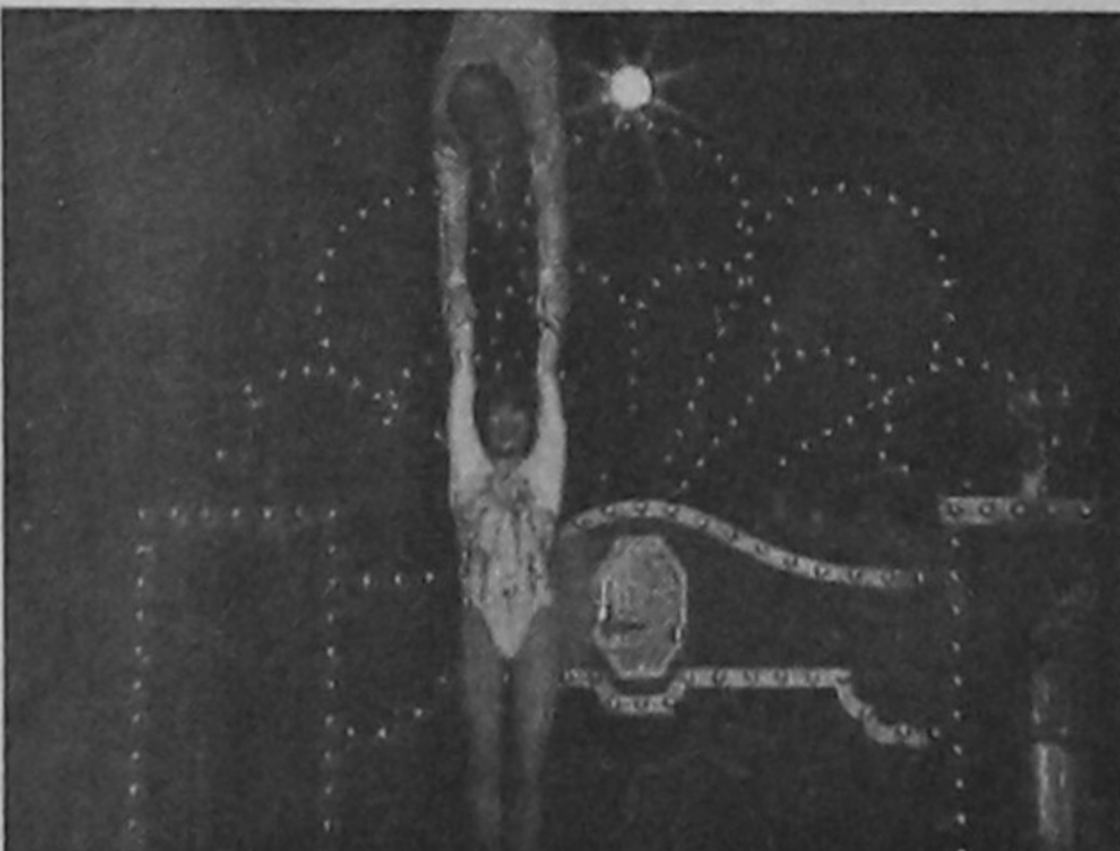
Circus Circus on Ekushey television on May 24 at 7:00pm

7:30 Aalaap 8:00 Ta Ra Rum 9:00 Brake Fail 10:00 Old Is Gold 10:30 Hit Mix 11:00 Brake Fail 11:30 Ponds All Time Romantic Hits 12:00 Bajaj Music Box 12:30 Saare Ga Ma Classic 1:00 Himani Gold T. Jharokha 2:00 Kumar Ajay Saree Prs Rangeen Tarane 2:30 Ta Ra Rum 3:30 Brake Fail 4:30 Bajaj Music Box 5:00 Music Quiz 5:30 Hit Mix 6:00 Saare Ga Ma Classic 7:00 Brake Fail 8:00 Teen Talk 8:30 Nexgen 9:00 Music