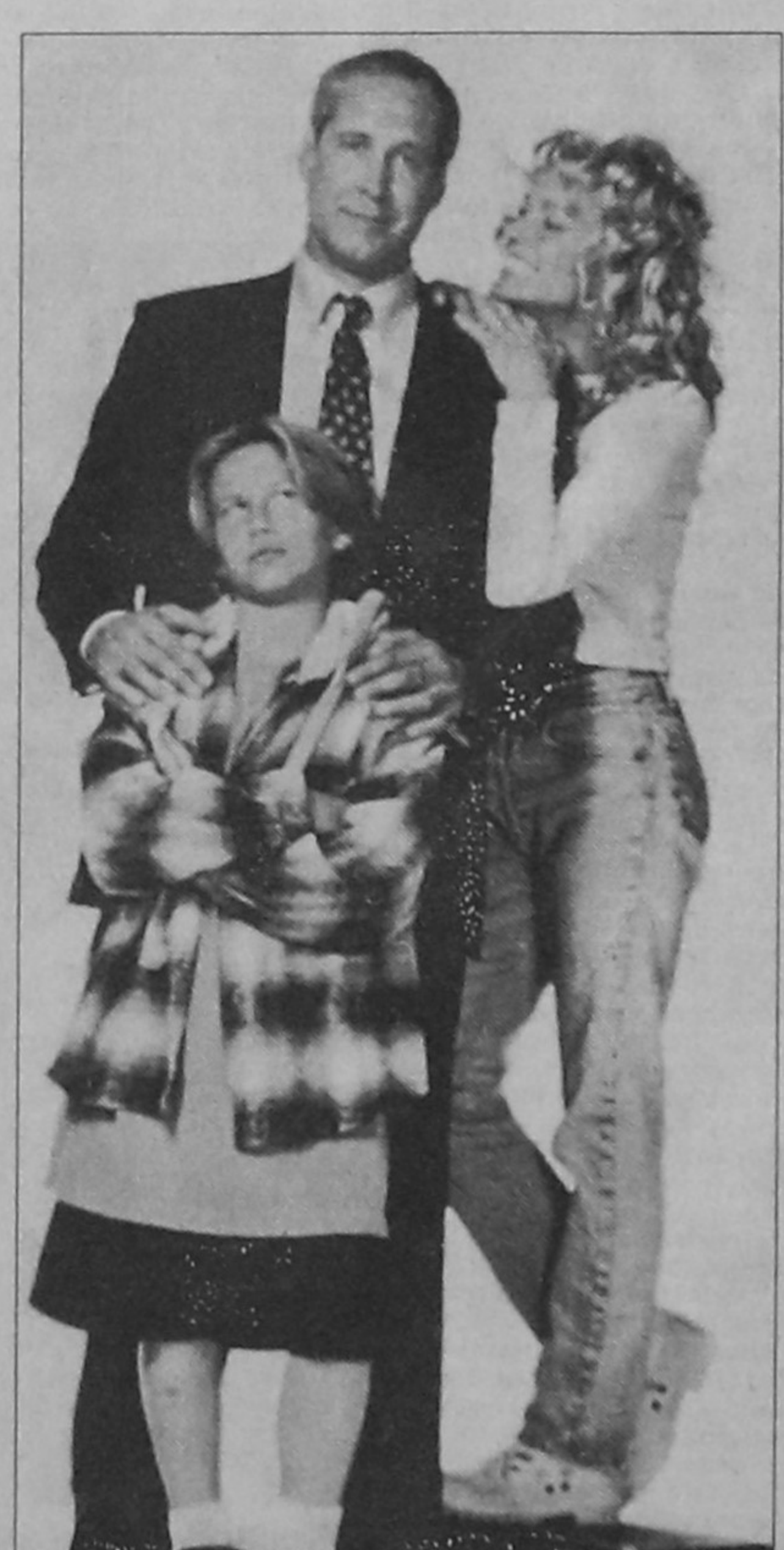
Man Of The House on Star Movies at 10:00pm

6:30 Ushuaia 7:30 Travelers- 8:30 Lonely Planet 9:30 Eyewitness 10:30 Danger Zone 11:00 Outer Bounds- 11:30 Shark Files- 12:30 Ghar Discovery 1:30 Medical Detectives- 2:30 Discover Magazine 3:30 Travelers 4:30 Ushuaia 5:30 Lonely Planet 6:30 Naturequest 7:00 Crocodile Hunter's Croc Files 7:30 Untamed Australia 8:30 Wild Discovery 9:30 The New Detectives 10:30 On The Inside 11:30 Discovery Profile Series 12:30 Wild Discovery 1:30 The New Detectives