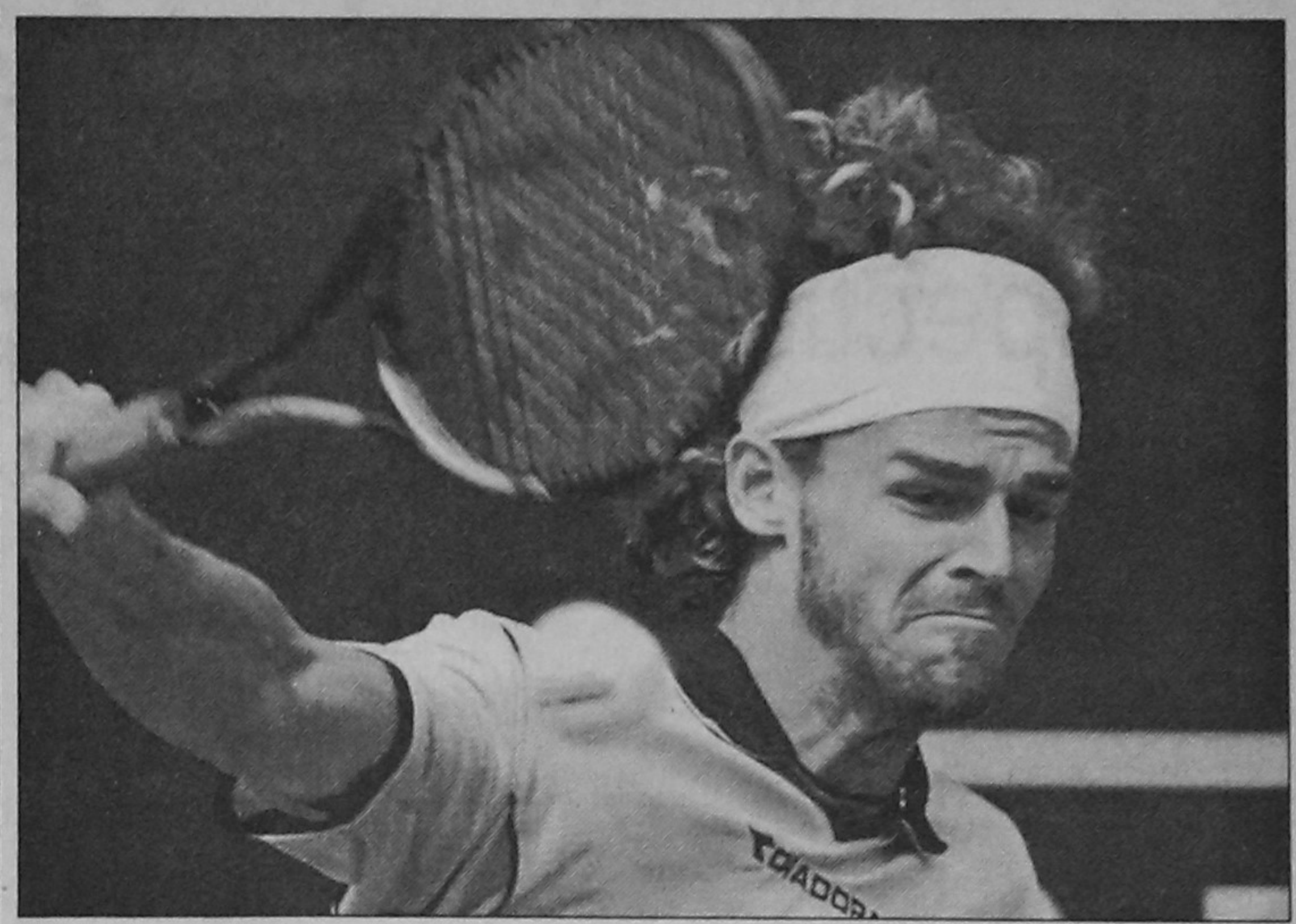
Brazilian Gustavo Kuerten plays a backhand return against Russian Marat Safin during their Hamburg Masters Series final encounter yesterday.

It meant a swift return to the top flight for Toulouise coach and former French international Alain Giresse following his brief and unhappy spell at the helm of Paris Saint Germain.