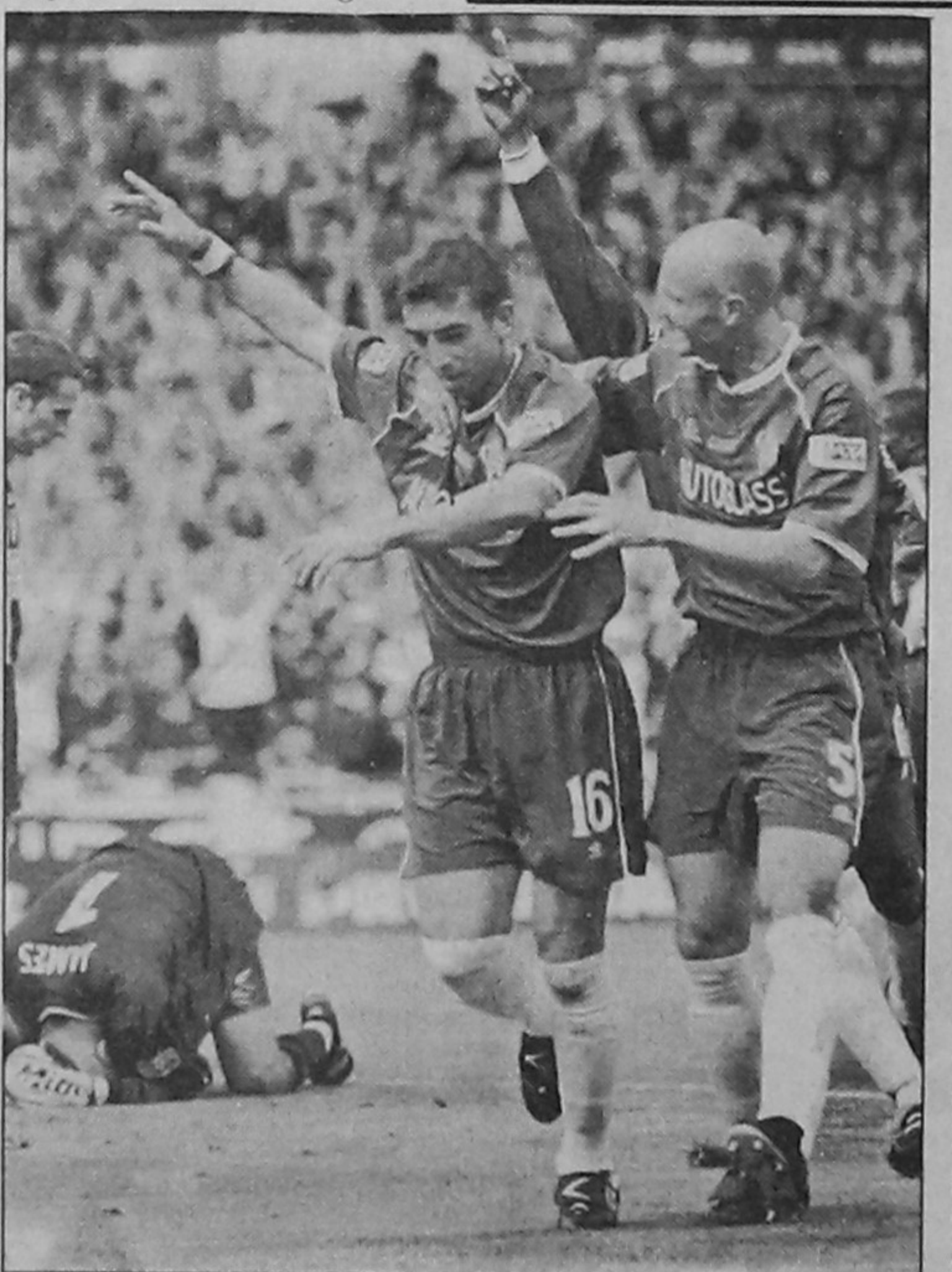
Chelsea's Roberto Di Matteo (C) and teammate Frank Leboeuf celebrate after the former scored the winning goal against Aston Villa in the FA Cup final at Wembley on May 20.

This season he scored 20 goals to finish third in the Capocannonieri (leading scorer) stakes behind AC Milan's Ukrainian hitman Andriy Shevchenko and his Argentine compatriot Hernan Crespo, who netted 21 times for Parma.