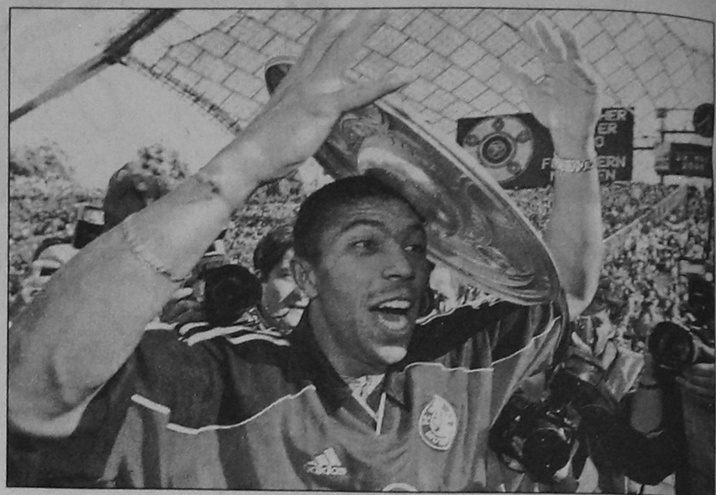
A joyous Giovane Elber of Bayern Munich crowns his head with the Bundesliga trophy after his team won the title for the 16th time on May 20.