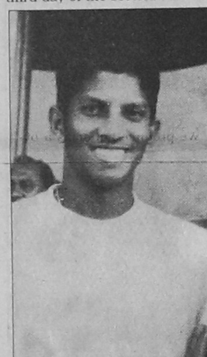
SARWAN ... 84 n. o.

Scoreboard at close on the third day of the second Test be-