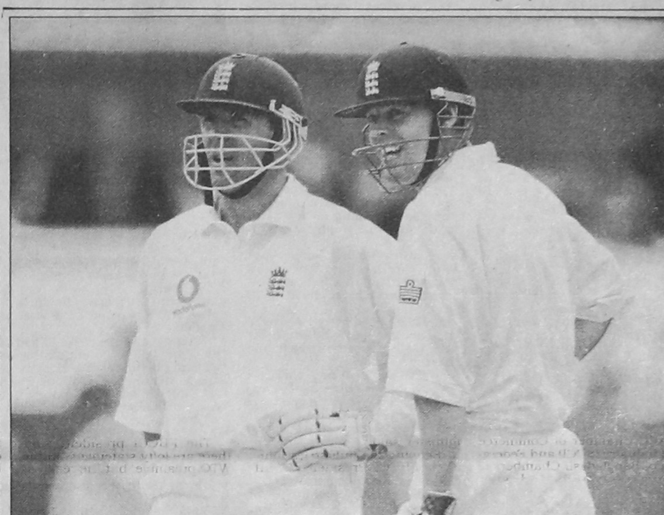
England's Nick Knight (R) waiting for a decision from the TV umpire regarding a run-out on the third day of the first Test against Zimbabwe at Lord's on May 20. On the left is Alec Stewart.