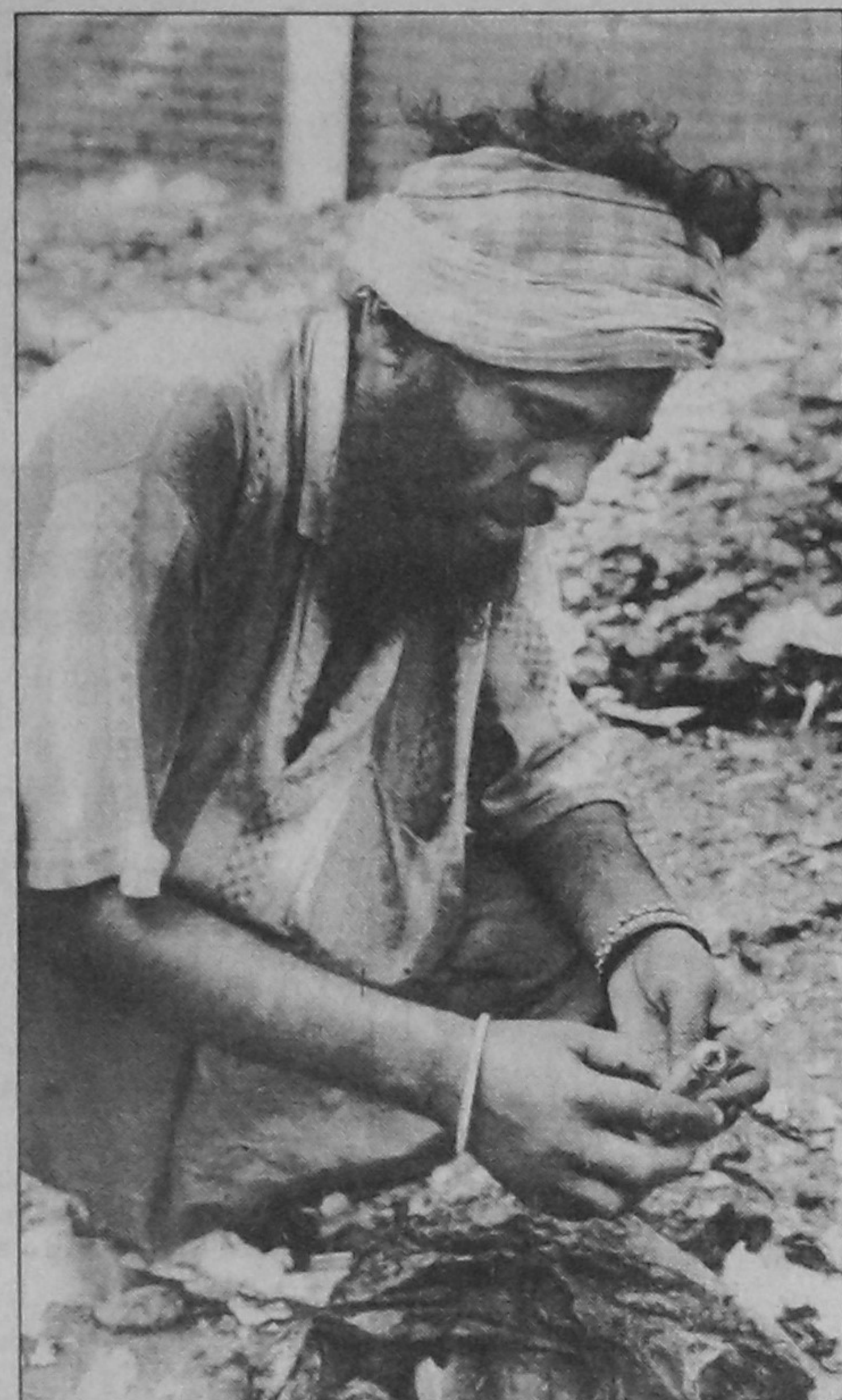
A man collects used disposable syringes from the rubbish bin in front of the Dhaka Medical College Hospital yesterday for resale.

Tons of used disposable syringes, saline and blood bags and transfusion sets are sold for reuse