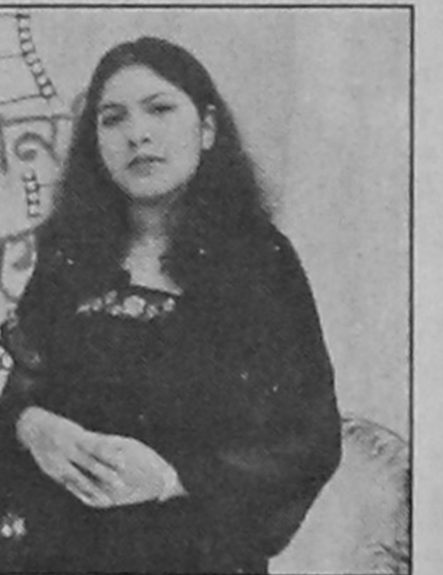
Openli- Biescope on Channel i on May 22 at 9:15

7:30 Aalaap 8:00 Ta Ra Rum 9:00 Brake Fail 10:00 1900 10:30 Hit Mix 11:00 Brake Fail 11:30 Teen Talk 12:00 Bajaj Music Box 12:30 Saare Ga Ma Classic 1:00 Himani Gold T Jharokha 2:00 Stars