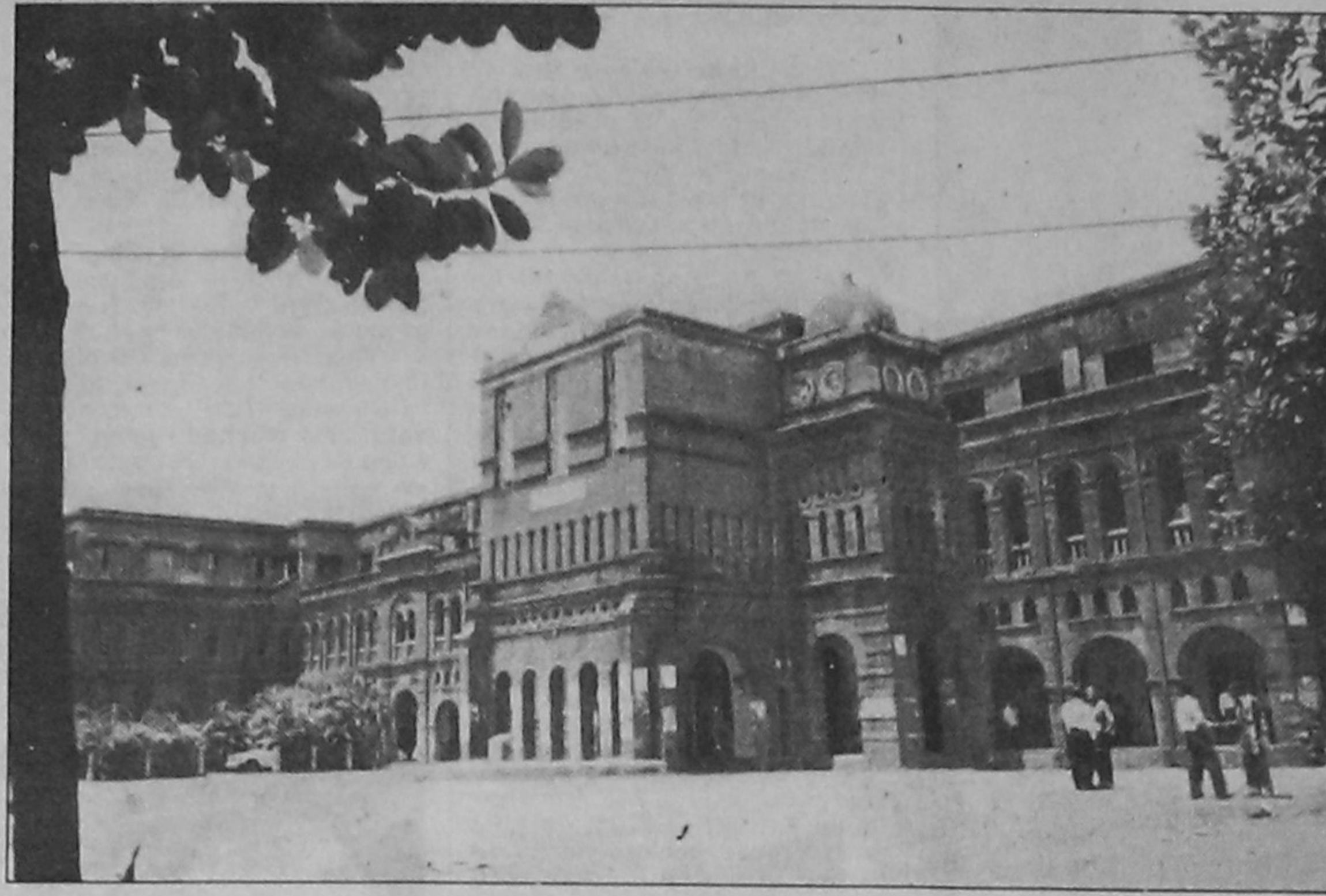
Century old Chittagong Court Building: endangered heritage

Again, years of neglect and overuse on the one hand and little or no attention towards routine repair and maintenance on the other, has led to its present state of despair, which is still so precarious as it is being