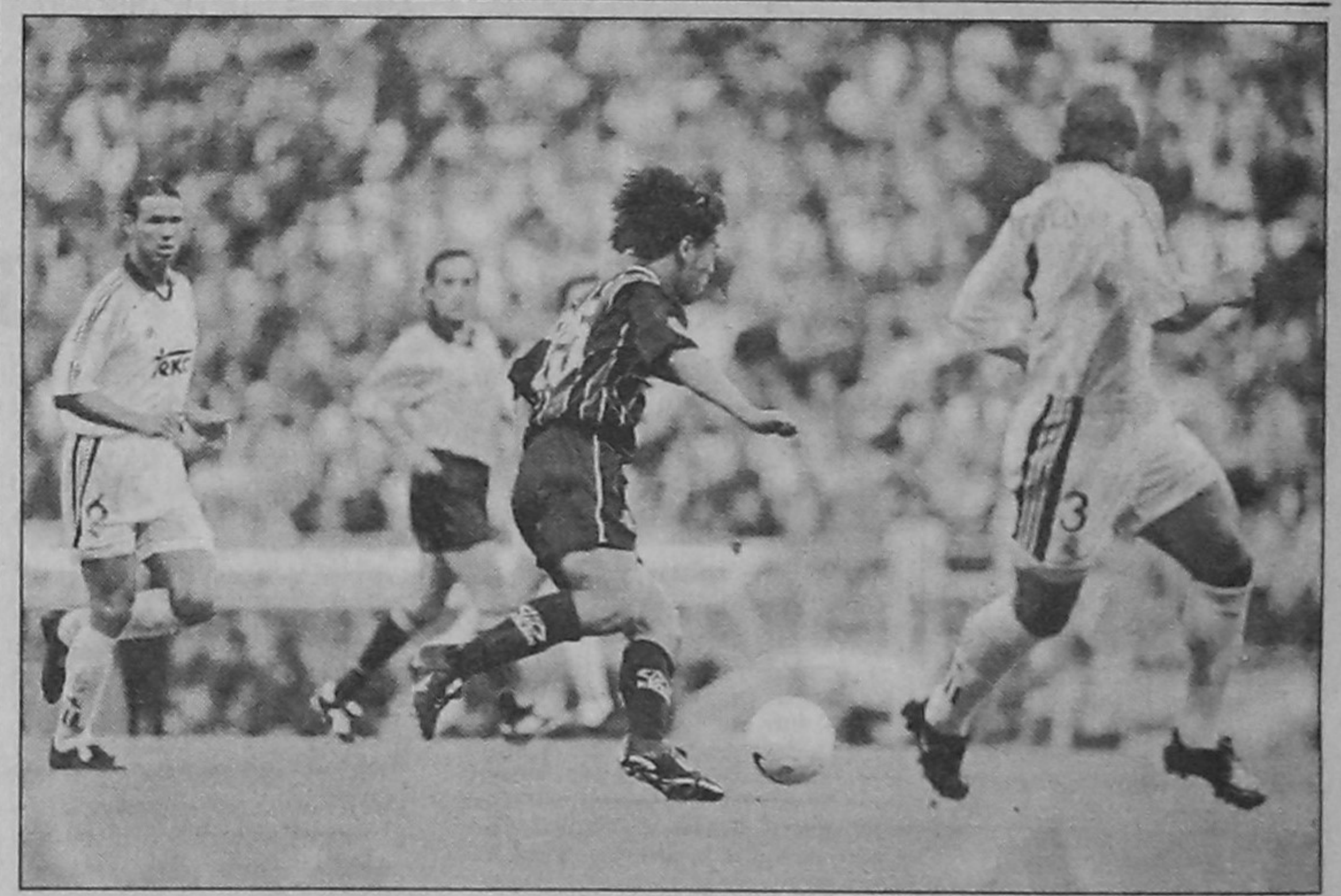
Real Valladolid's Japanese striker Shoji Jo (C) tries to shake off Roberto Carlos (R) of Real Madrid during their Primera Liga fixture on May 19.