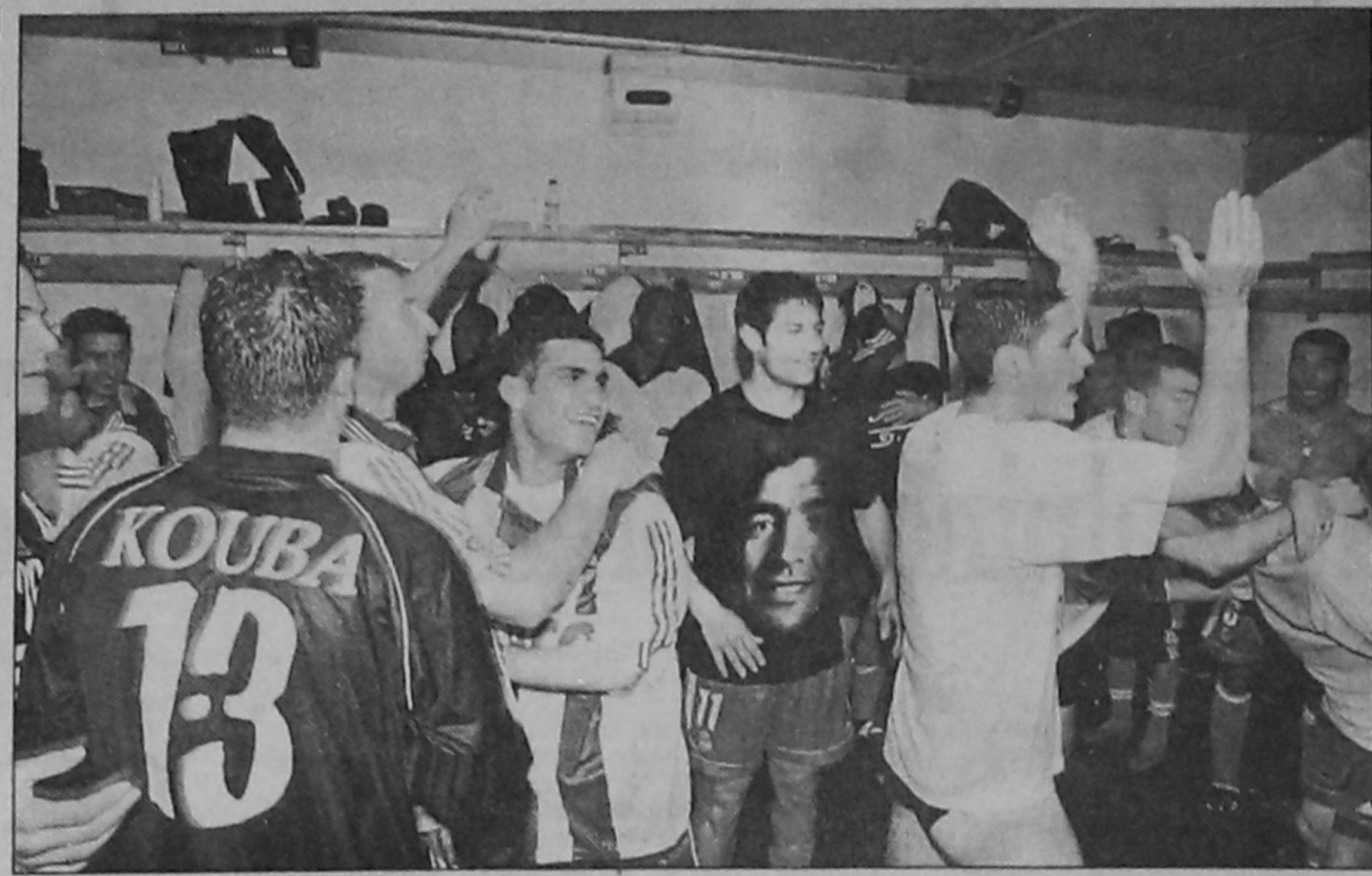
Players of Deportivo La Coruna celebrate inside their locker-room after ensuring this year's Primera Liga title following their 2-0 victory over Espanyol on May 19.