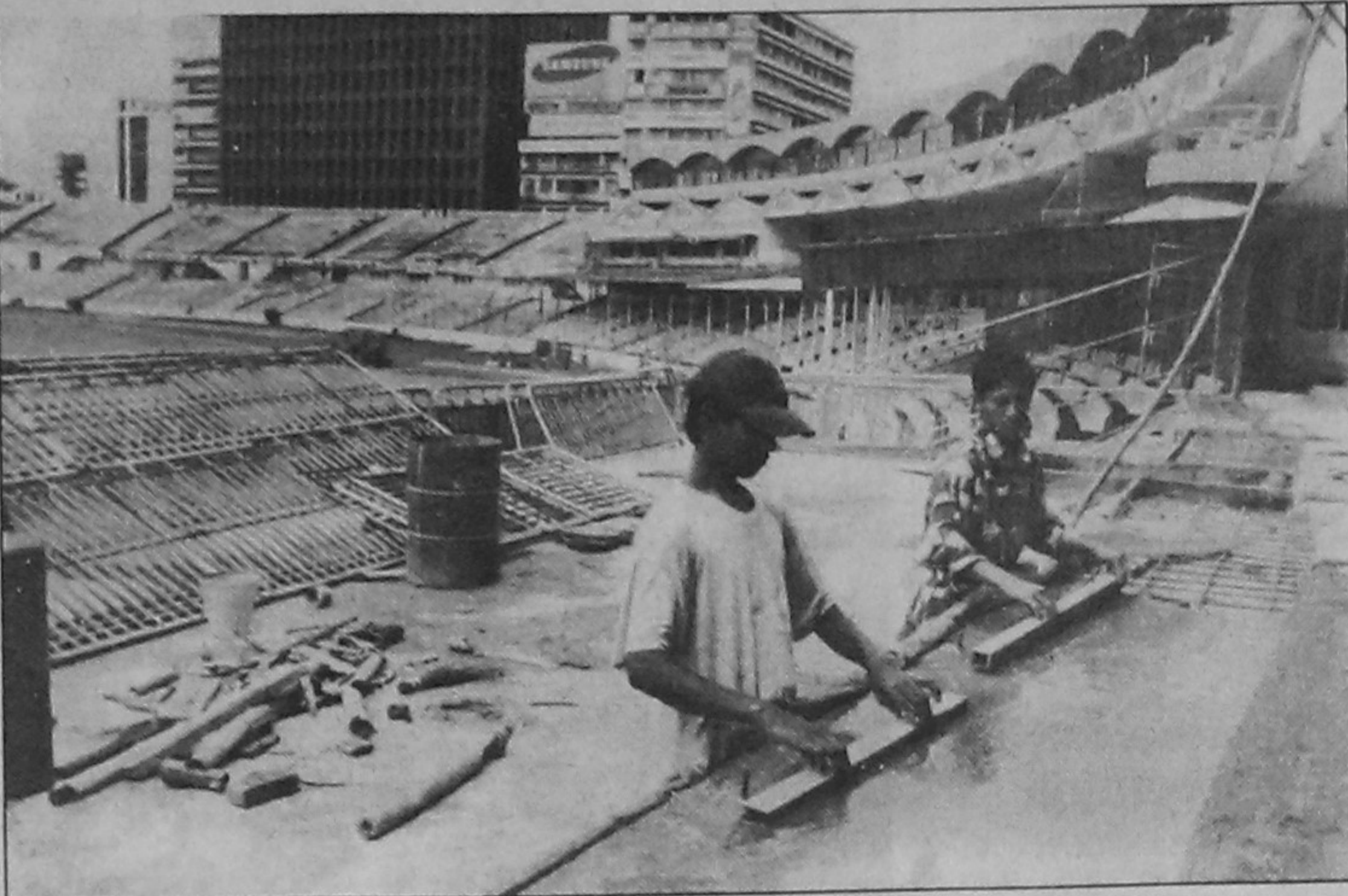
GETTING READY: Some renovation work is taking place at the Bangabandhu National Stadium ahead of the May 28-June 7 Pepsi Asia Cup.