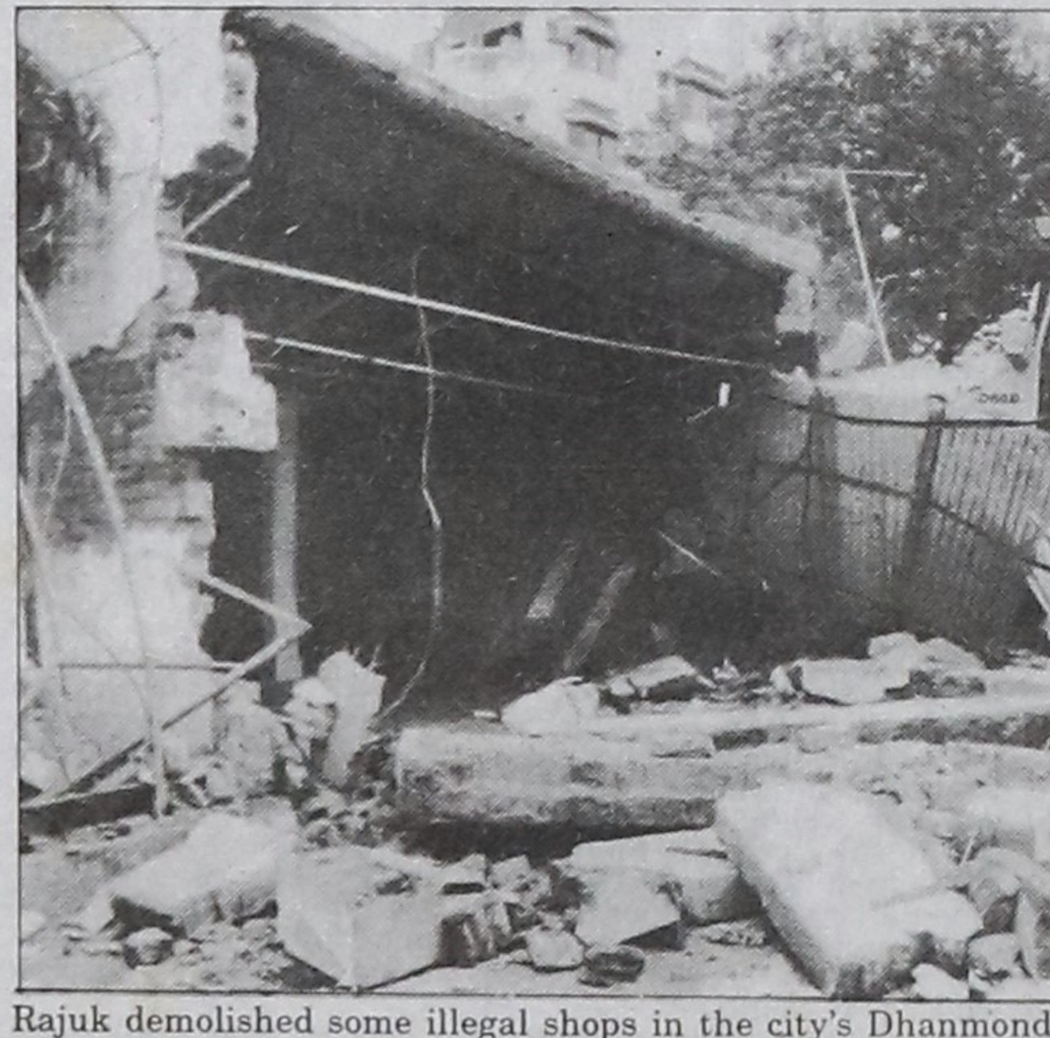
Rajuk demolished some illegal shops in the city's Dhanmondi area yesterday.

By Diplomatic Correspondent Nihal Rodrigo, the Secretary General of SAARC is due to arrive in Dhaka tomorrow on a three-day visit to Bangladesh. The current Secretary General of the seven-member regional organisation is expected to pay courtesy call on Prime Minister Sheikh Hasina and Foreign Minister Abdus Samad Azad. The SAARC Secretary General is likely to discuss with Bangladesh leaders the prospects for holding the 11th Summit which was due to be held in Nepal. The Summit was postponed because of the reported "unwillingness" of India to sit on the same table with Pakistan's military ruler Pervez Musharraf.