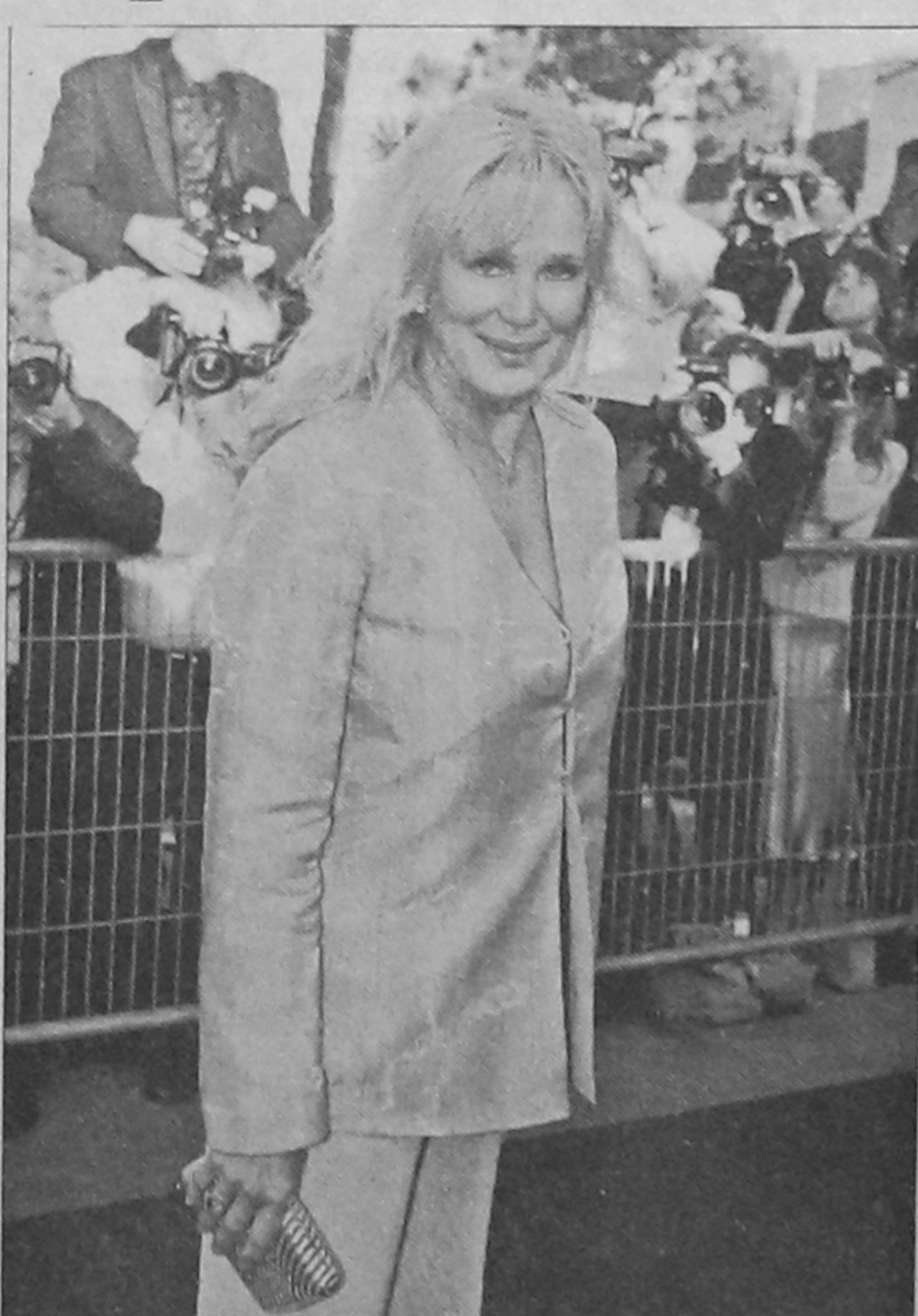
US actress Linda Evans poses upon her arrival at the AMFAR (American Foundation for Aids Research) benefit party during the 53rd Cannes Film festival, on the French Riviera.

And depending on whatever East-West balance the jury finally decides on, they could reward Wu Nianzhen for his restrained performance in "Yi Yi" or make a bare-faced pitch for Hollywood glamour by going for the star of Joel and Ethan Coen's "O Brother, Where art thou?", matinee idol George Clooney.