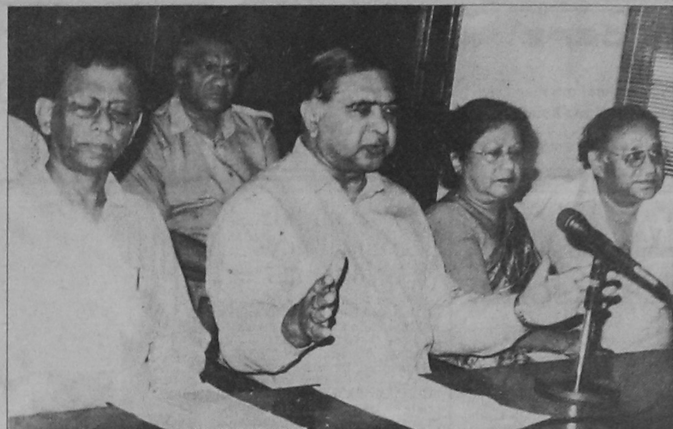
Gano Forum leader Dr Kamal Hossain addressing a press conference held at the Jatiya Press Club yesterday to mark the launching of 'Nagorik Samaj', a civil rights group.