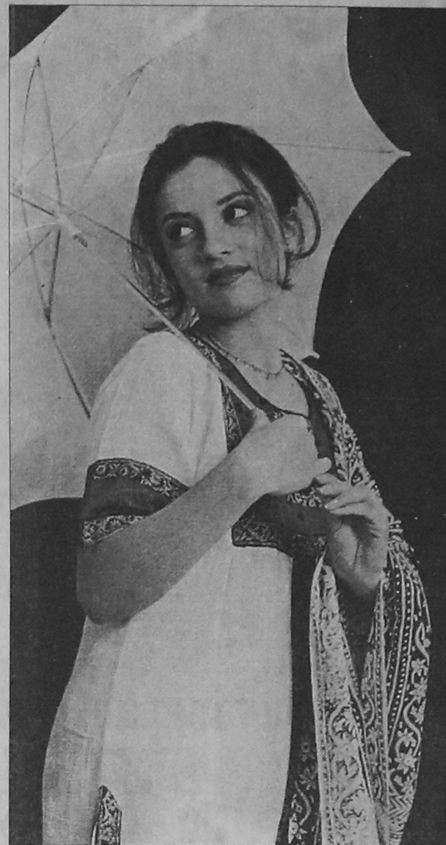
Scarlet red sleeves and yolk with block print have made this salwar kameez ensemble stunning.

Kameezes on display at the exhibition. Mostly done with block print and pasting of block printed clothing on the body, while the other piece of it has block print all over it. Black and red designs on white simply lighten up the set. Another colourful one hangs at the exhibition, which is done with striking yellow, orange and red colours combining them with interesting patterns. There are few exclusive evening wears among the Salwar Kameezes, these are done with golden and silver thread works. She also used off white Jamdani material in these. Prices for the Salwar Kameezes stand between Tk. 3,000 to Tk. 6,000.