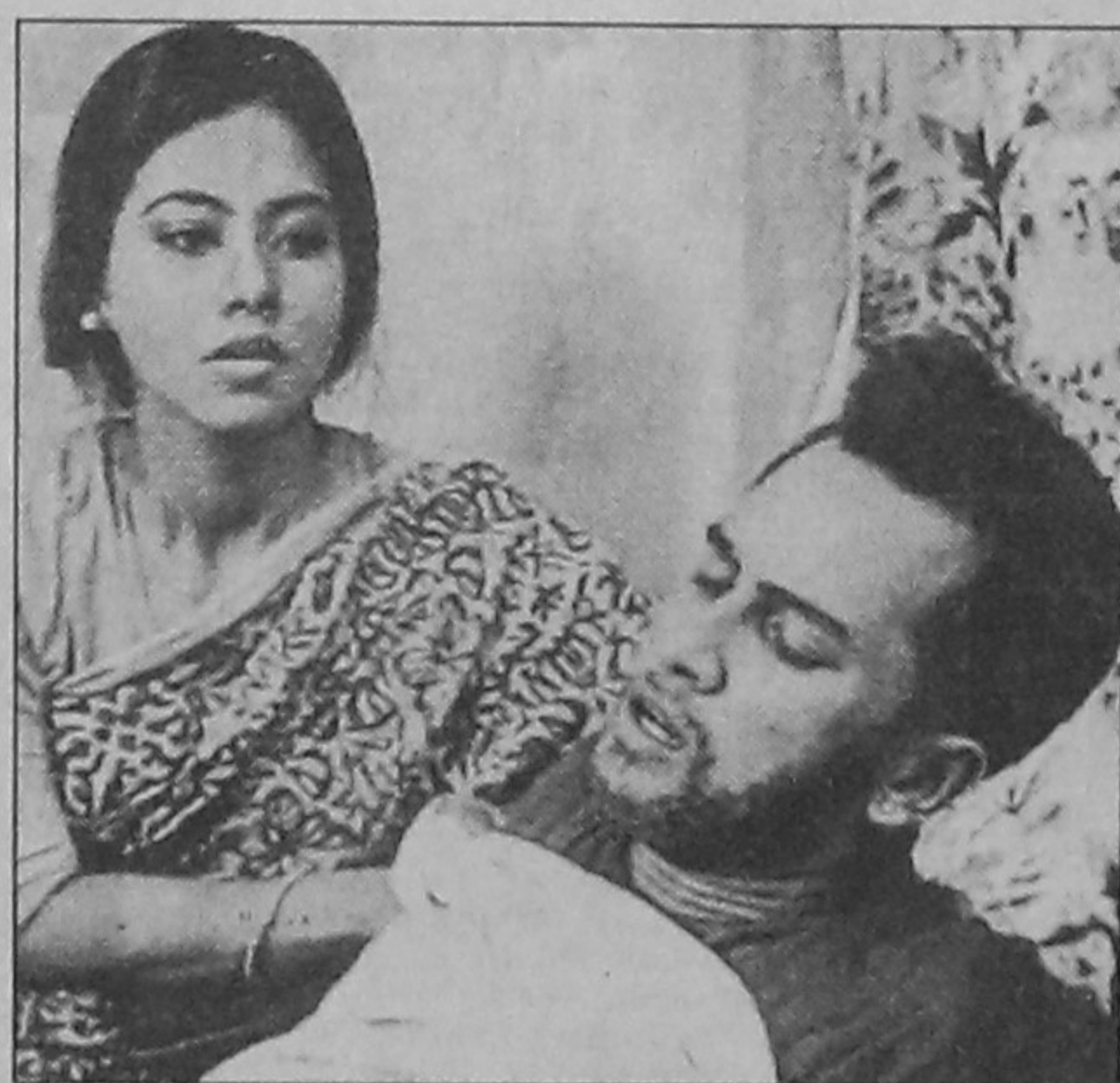
Drama Nayan (3rd episode) tomorrow on channel i at 10 pm. Starring Shami Kaiser and Salman Shah

Tele Shopping 12:30 Geet Gata Chal 1:00 Serial: Baaje Payal 1:30 Serial: Khali Haath 2:00 Daawat: Cookery Show 2:55 News In Urdu 3:05 United Tele Shopping 3:30 Hindi Feature Film 6:00 Mummus Alive 6:30 Duck Tales 7:00 Mamre Gaurav 7:30 Series 7:55 Navarang 8:00 IBP Ustaad 8:30 Serial: Satya 10:00 Rang Bi-rang Phool 10:30 Aaj Taak (News) 10:50 Manzilion 11:00 Serial: Ehsaas 11:30 Business Midweek 12:00 Series-Investigator 1:00 Hindi Films