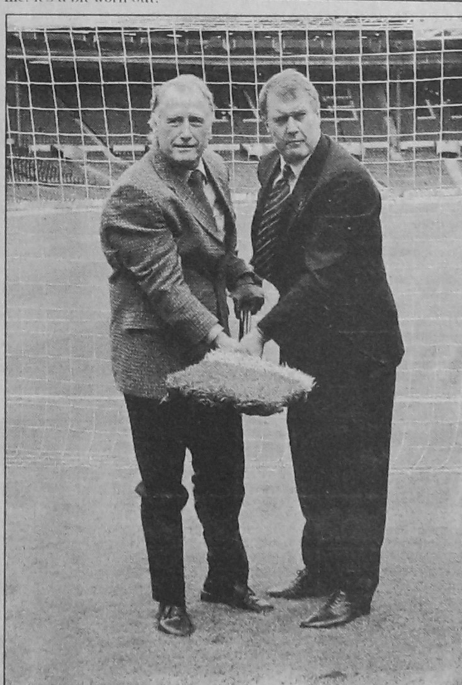
FOES THEN FRIENDS NOW. Legendary English footballer Sir Geoff Hurst (R) and former West German custodian Hans Tilkowski holding a chunk of the Wembley stadium turf yesterday which was later sold in an on-line auction conducted by QXL.com. The turf-piece was dug up from the spot where the ball landed for the disputed third England goal scored by Hurst during the final of the 1966 World Cup against West Germany.

He said: "I didn't think we would get to the final and was in the Bahamas with my family, sitting on a beach. Wembley has a great deal of history but, like me, it's a bit worn out."