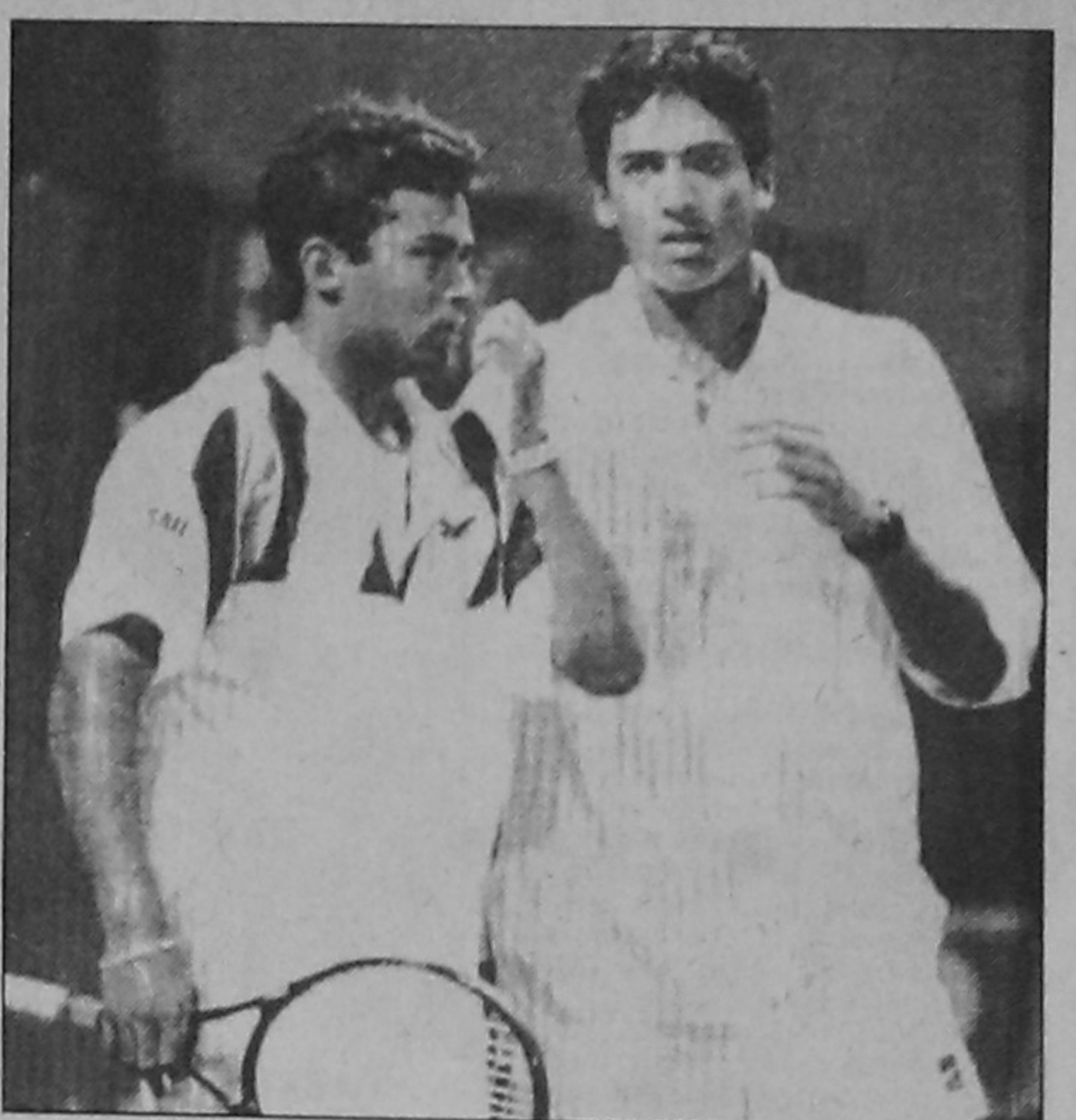
Leander Paes (L) and Mahesh Bhupathi.

Though Mahesh on Monday ruled out any possibility of the two coming together at least for this year saying there are several other core issues to be settled with Leander, his father's assertion that problems will be sorted out gives some hope for Indian tennis.