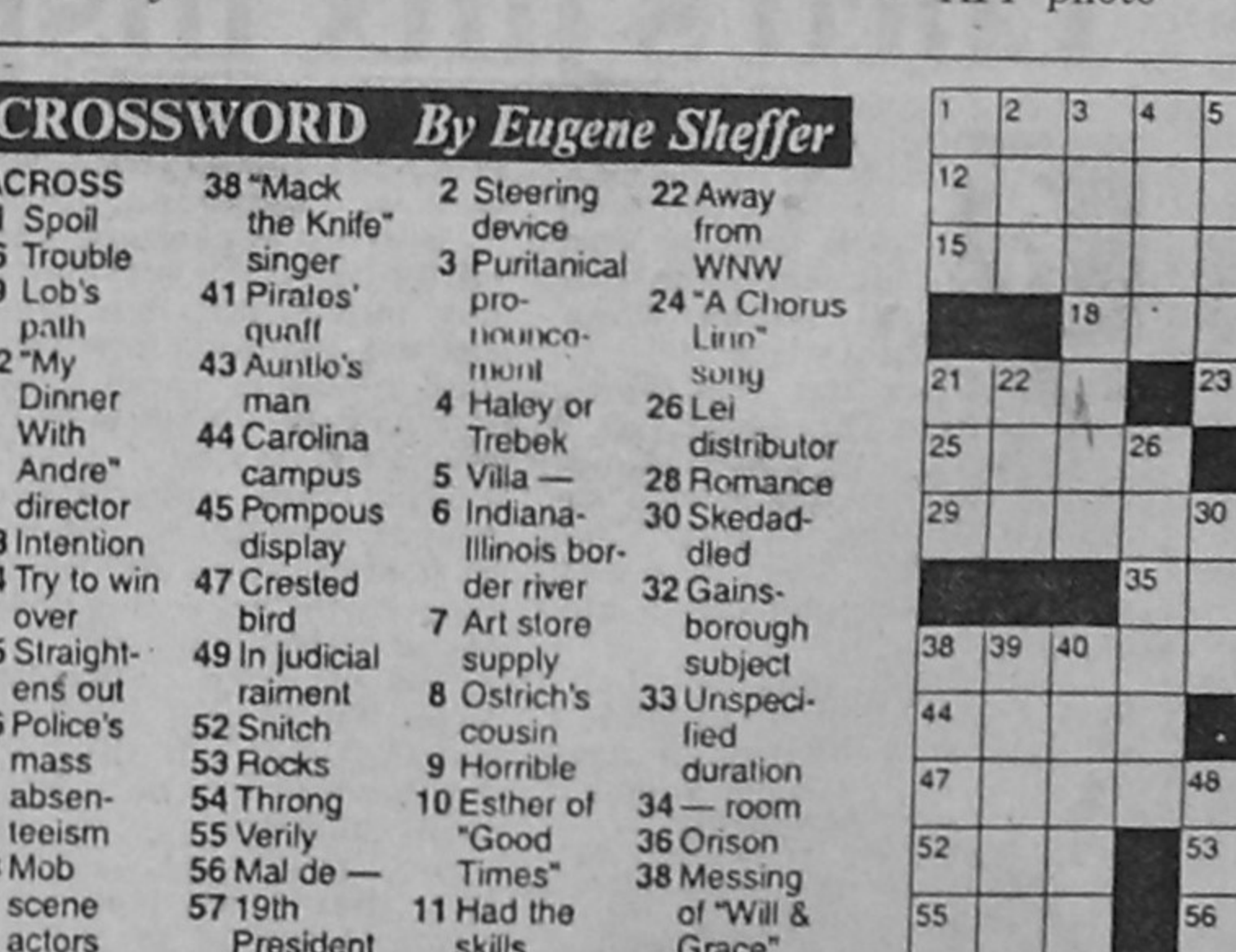
SUPER SUSAN: Susan O'Neill is ecstatic after breaking the world record in the 200 metres butterfly final of the Australian Olympic Swimming selection trials at Sydney yesterday.