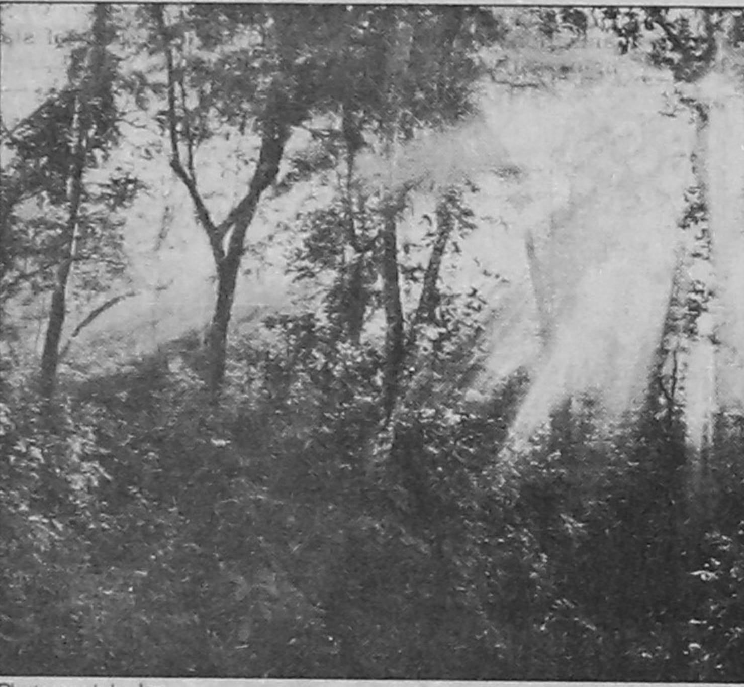
Photograph by Ian

The three photographers are Enam Ul Haque, Ian Lockwood and Sirajul Hossain. The three of them bears a strong love and attraction for nature, which is their prime inspiration for photography. In fact Ian and Siraj met each other in Sundarban. The three photographers held a press conference on their latest photography exhibition on May 14 at the