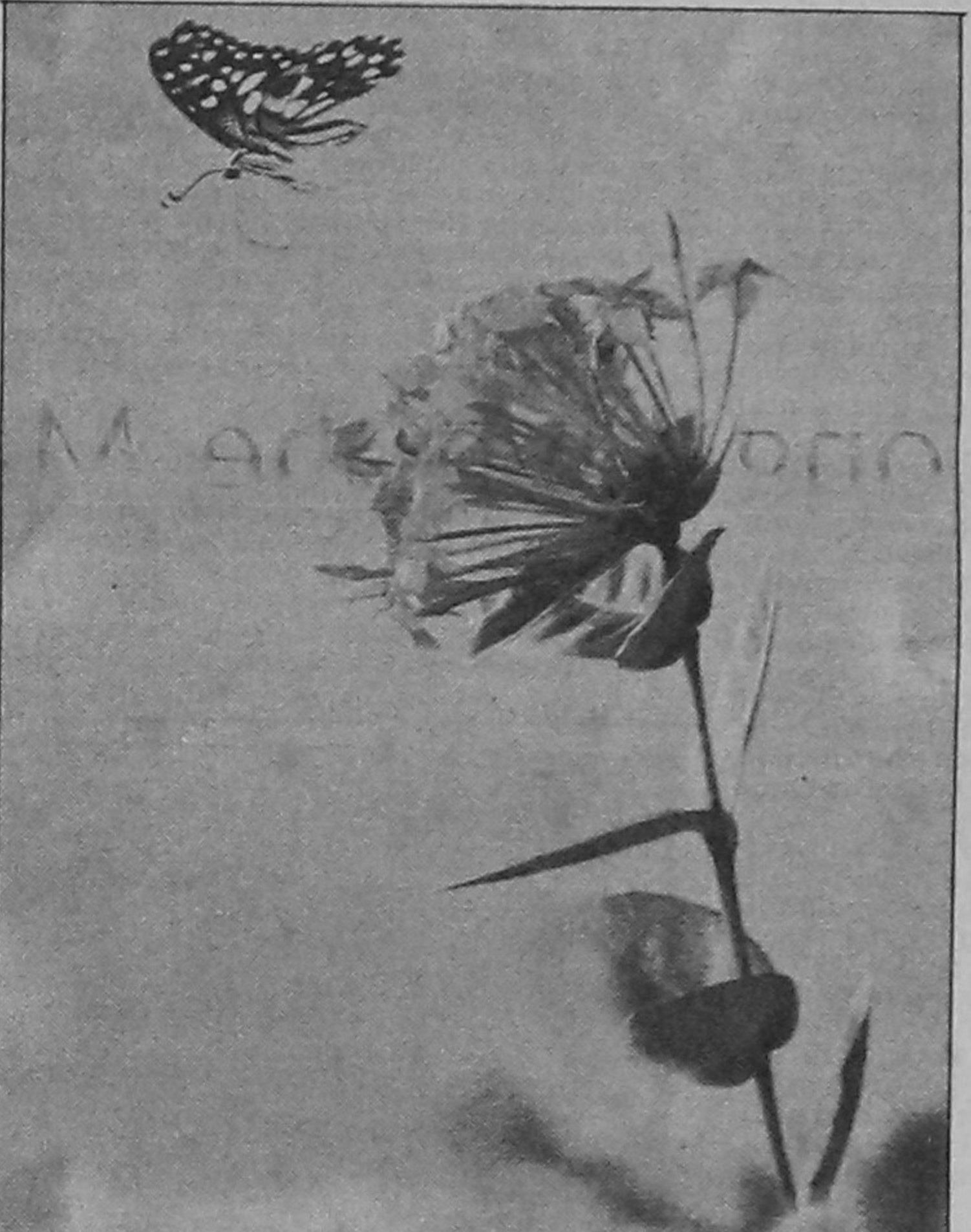
Photograph by Sirajul Hossain

"Forest Ingredients" show pictures of a butterfly, a leaf and a spider on its web in three separate pictures placed in a same frame. The close-ups show Siraj's fascination to find magnificence in the microscopic world of nature. The bright yellow, black, white lines and red dots on the spider, the sil-