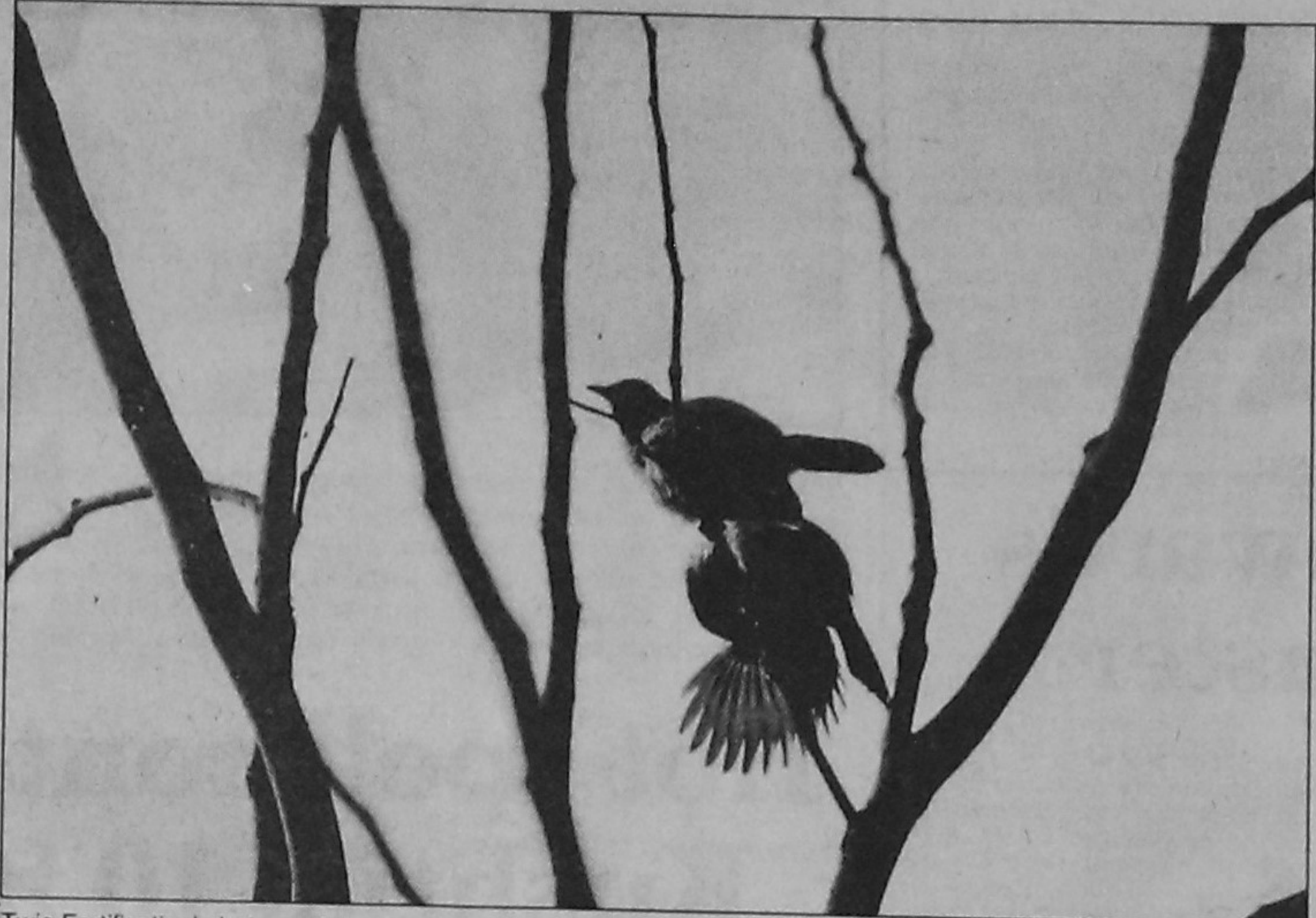
'Twig Fortification'