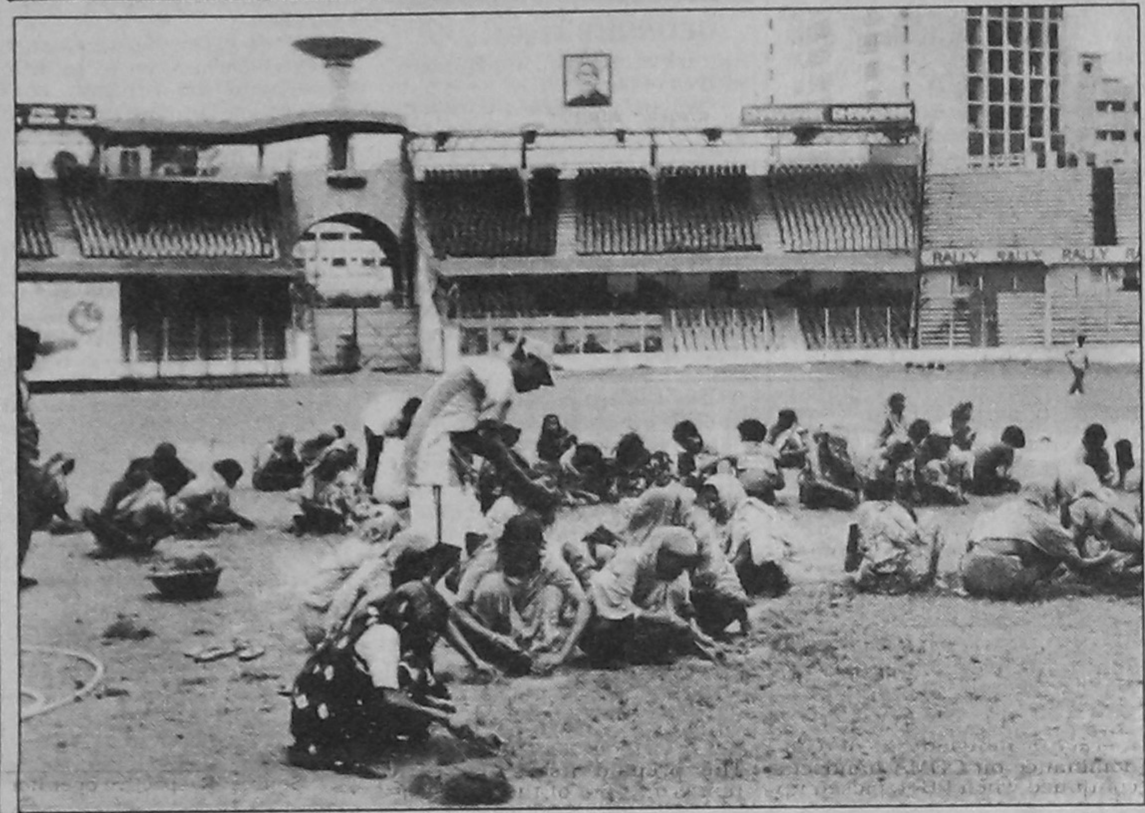
Workers repairing the outfield of the Bangabandhu National Stadium yesterday for the Pepsi Asia Cup.

A total of 67 teams splitting into ten zones are taking part in preliminary round from where the zonal champions will advance in the 12-team final phase that includes defending champions Dhaka University and the hosts Noakhali.