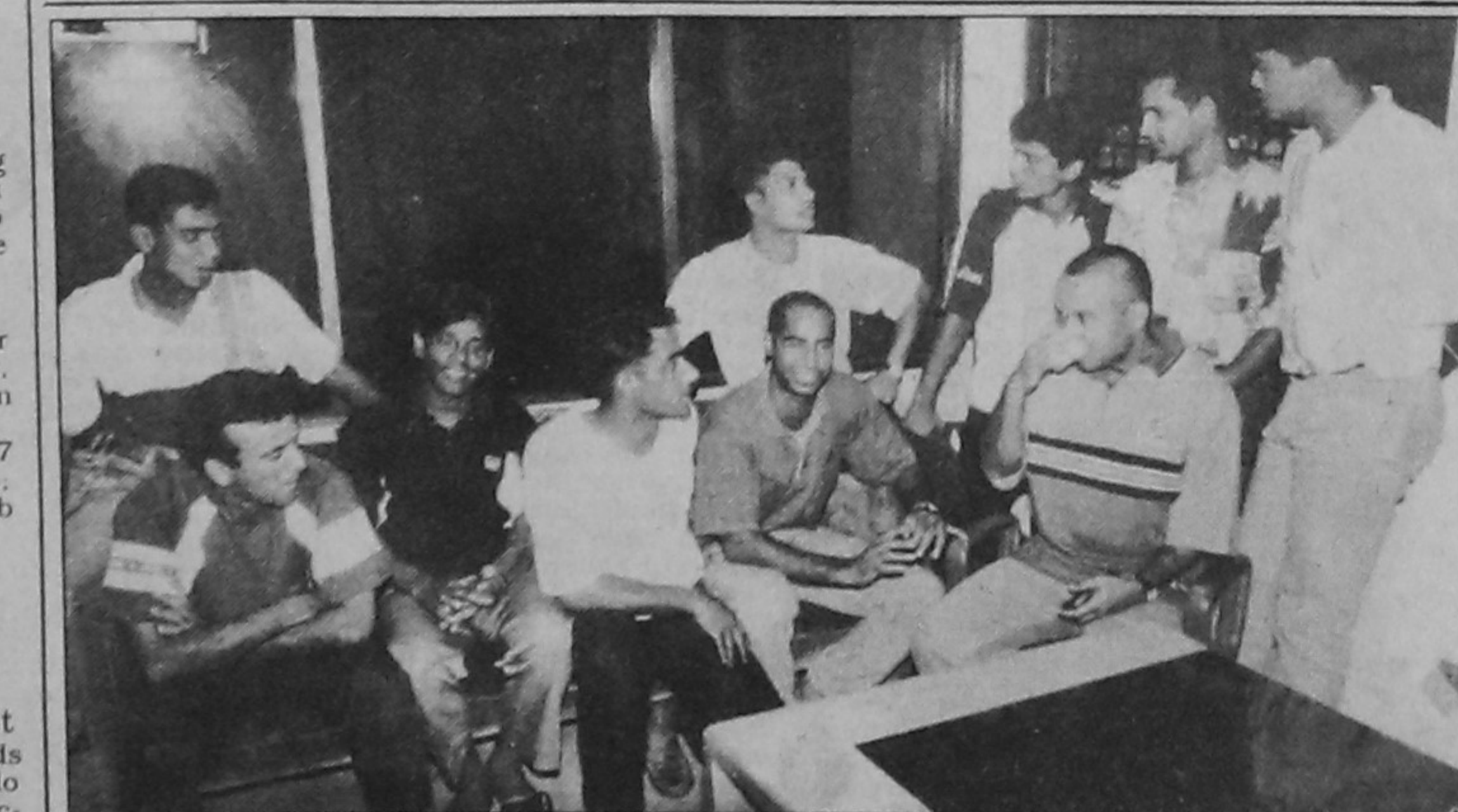
Cricketers enjoying a light-hearted moment after reporting to Bangladesh Cricket Board office yesterday for the residential camp of forthcoming Pepsi Asia Cup. The camp begins at the BKSP this morning.