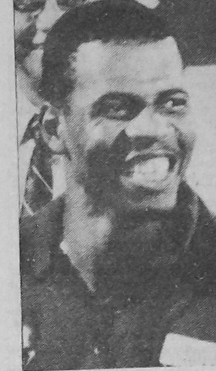
DILLON... 6 for 40

Though Wasim would have sealed his place for the upcoming Test opening on Thursday with his century in the first innings and his knock in the second, his partner could be a mystery, since Wajahatullah