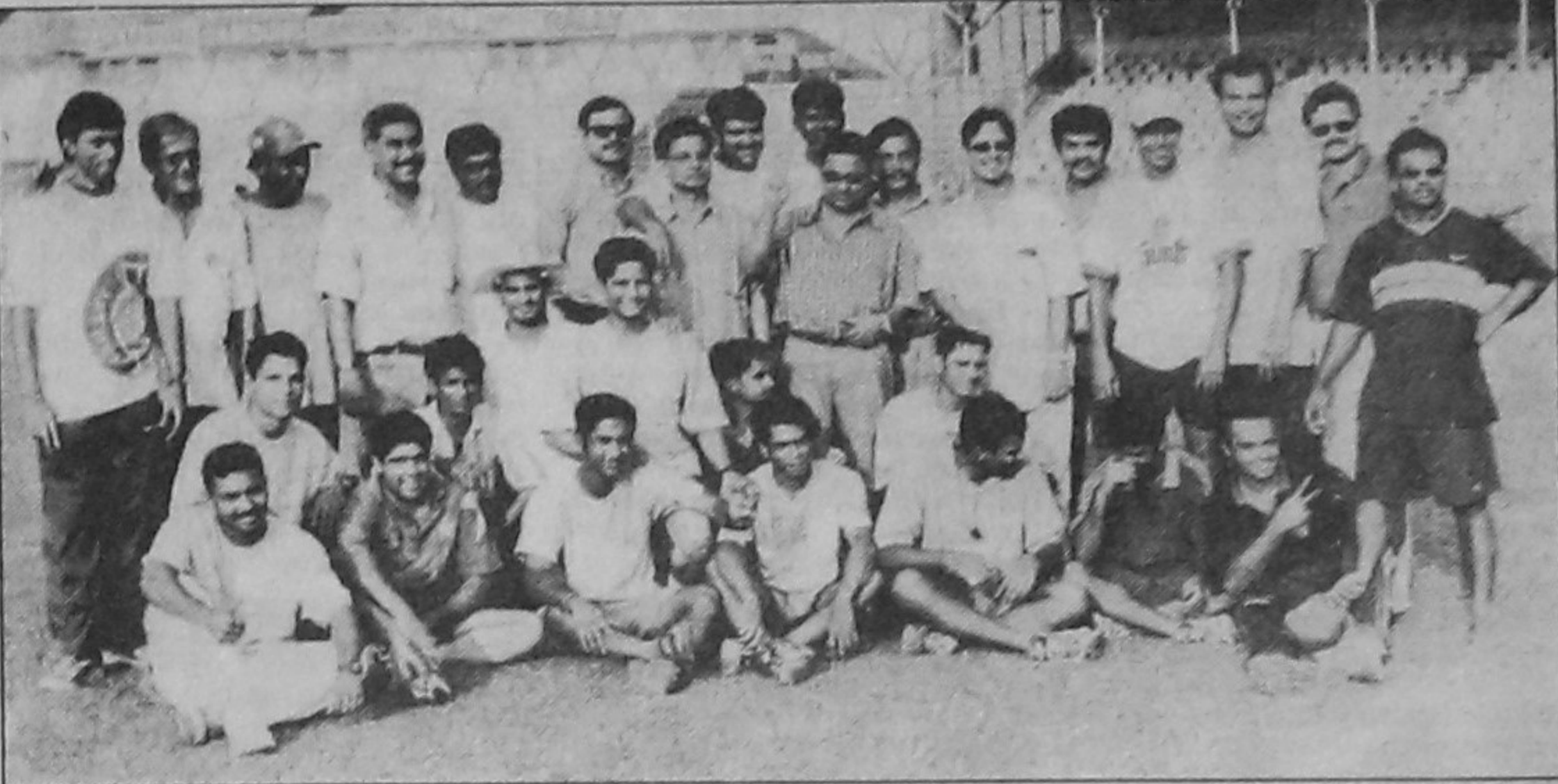
Players and officials of Abahani Krira Chakra, who won the Premier Division Cricket League title, pose for photograph at the Bangabandhu National Stadium yesterday.

Brothers Union will take on United Sporting Club and Colony Club will meet Morning Star Club tomorrow.