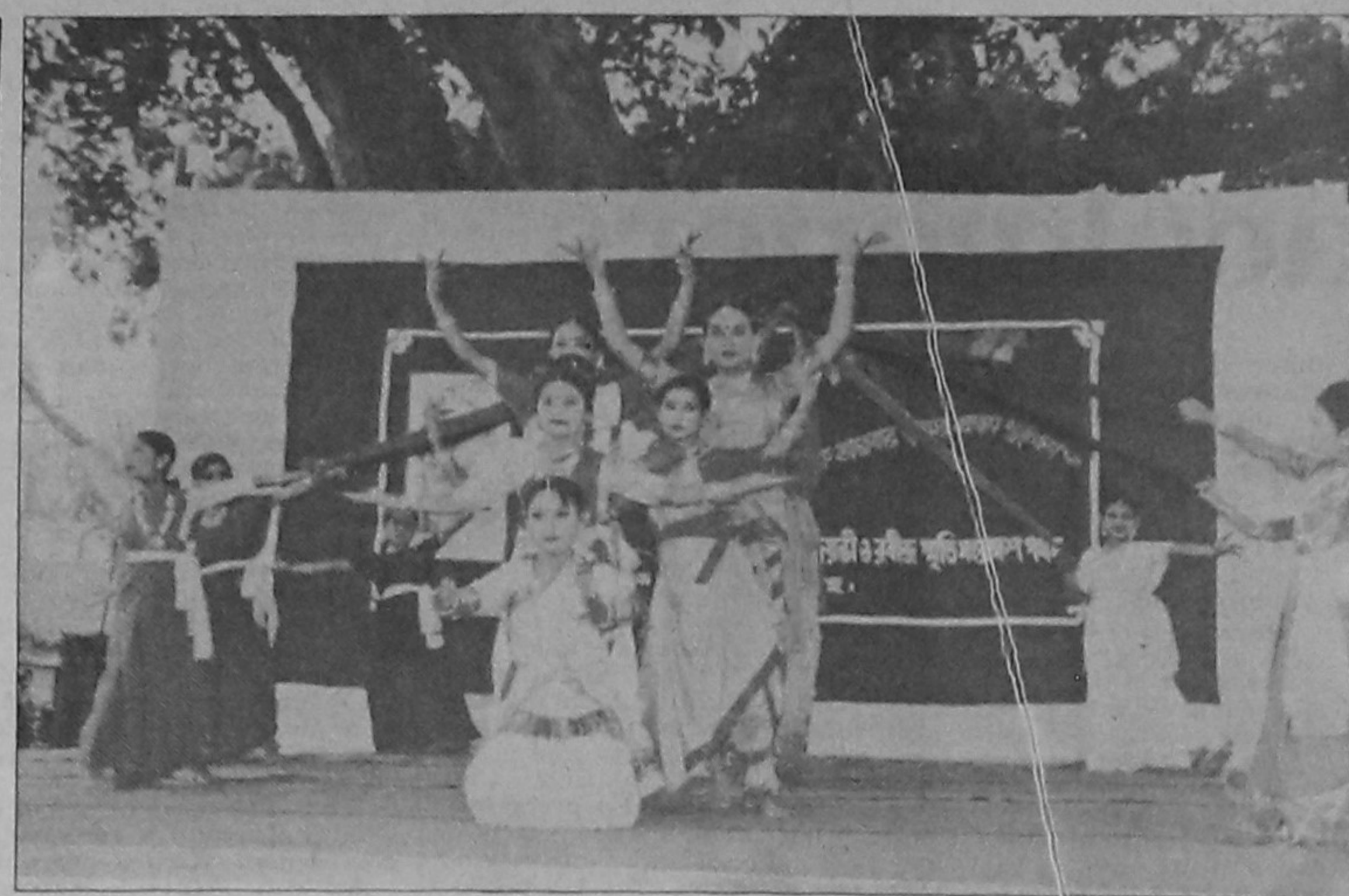
Tagore is the source of our inspiration

Later the man was handed over to police.