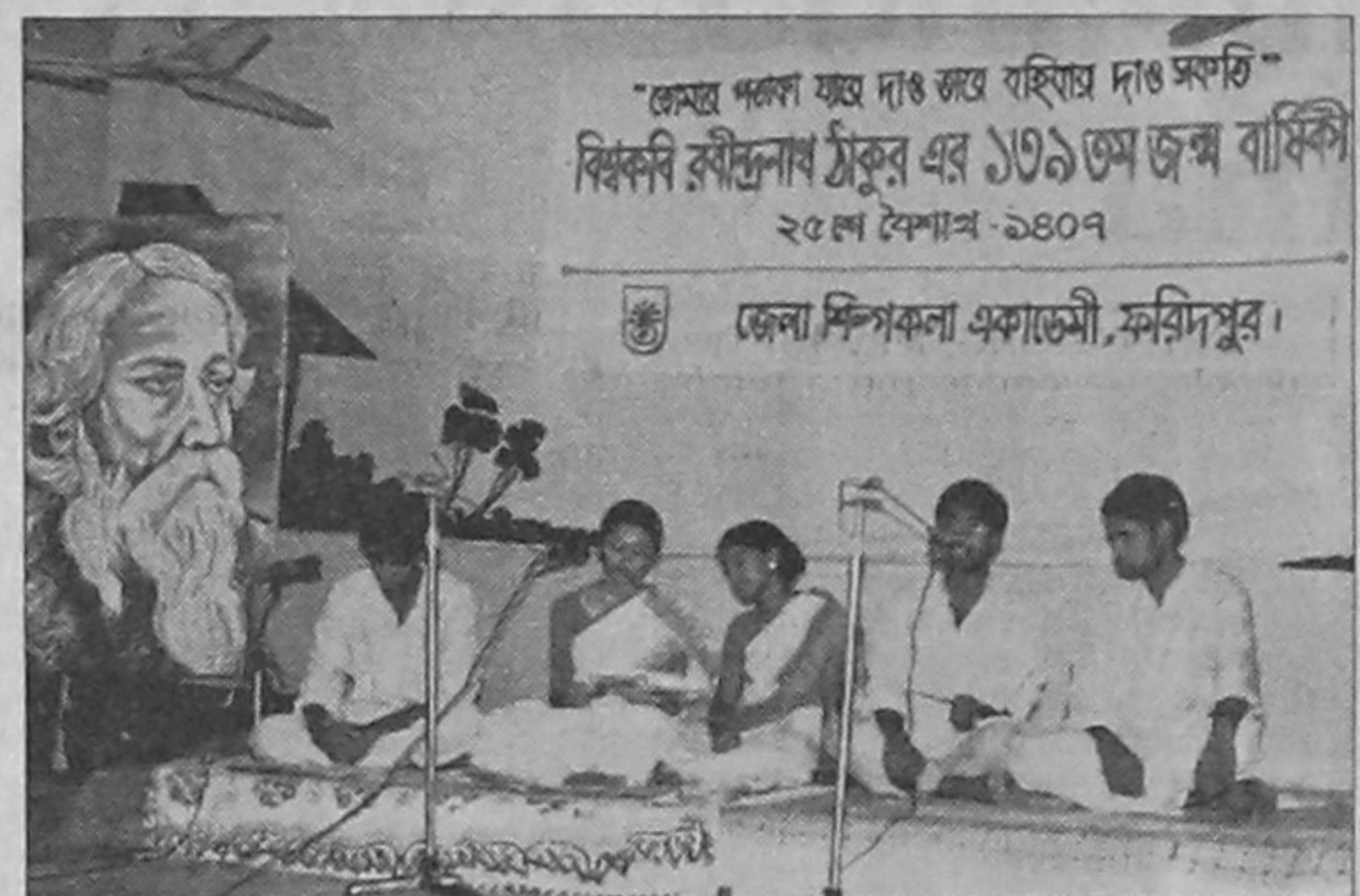
A cultural programme was also arranged by Faridpur District Shilpakala Academy on the occasion of Tagore's birth anniversary.