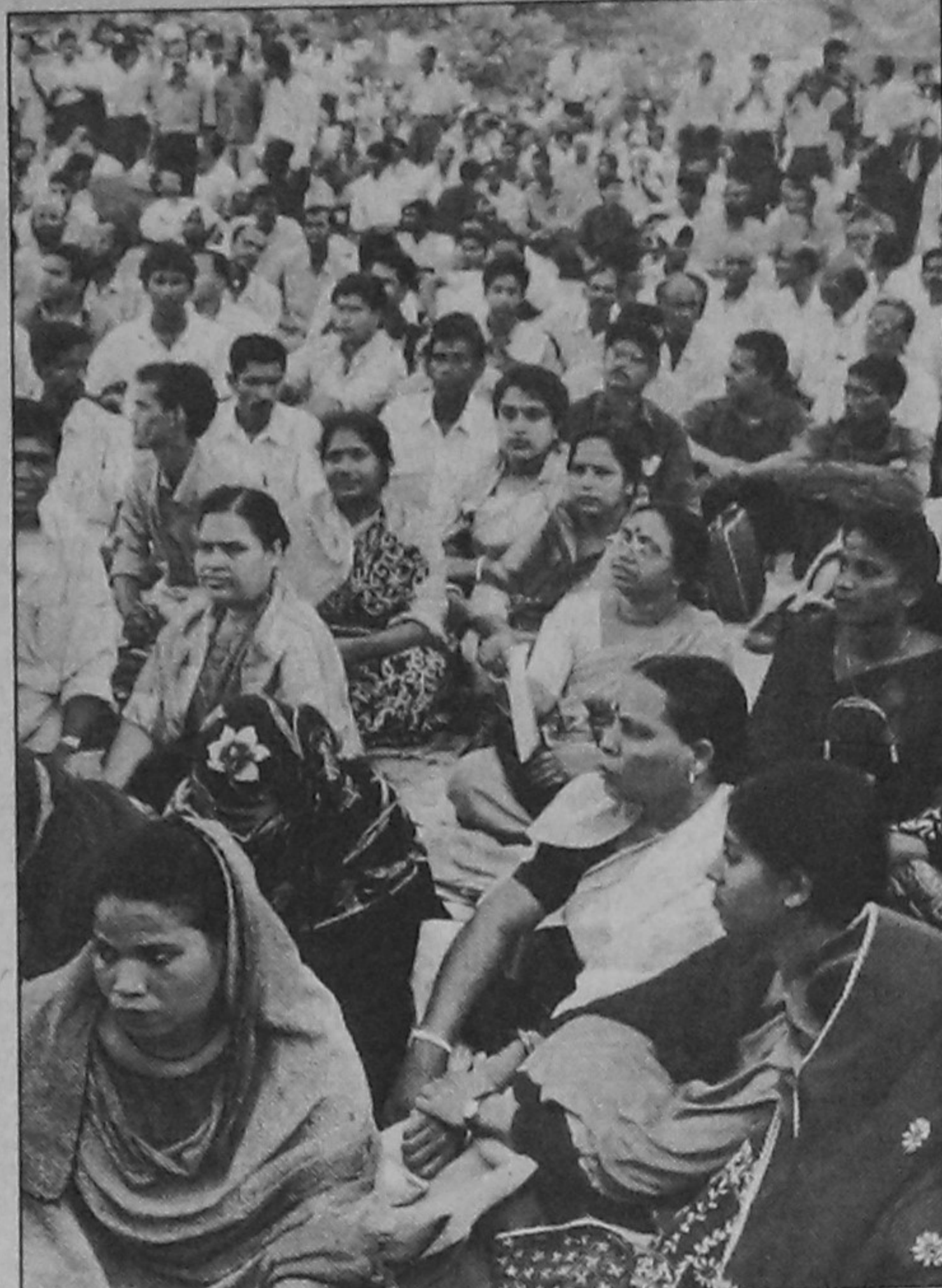
Non-government Teachers Association held a grand rally to press for their 14-point charter of demands at the Central Shaheed Minar premises yesterday.

House 7 SW(E), Road 7 Gulshan-1 Dhaka. Telephone : 8814313, 605912