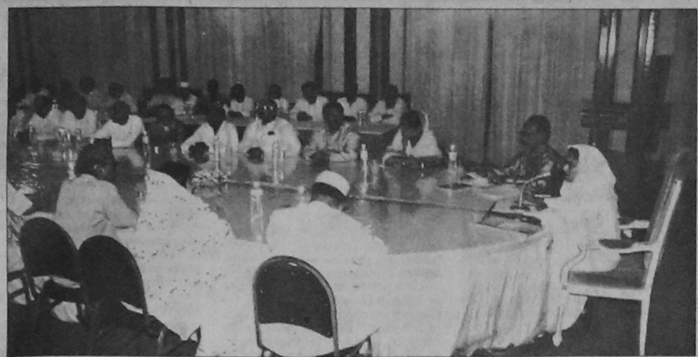
Prime Minister Sheikh Hasina presiding over a meeting of Awami League Working Committee at Ganobhaban yesterday.