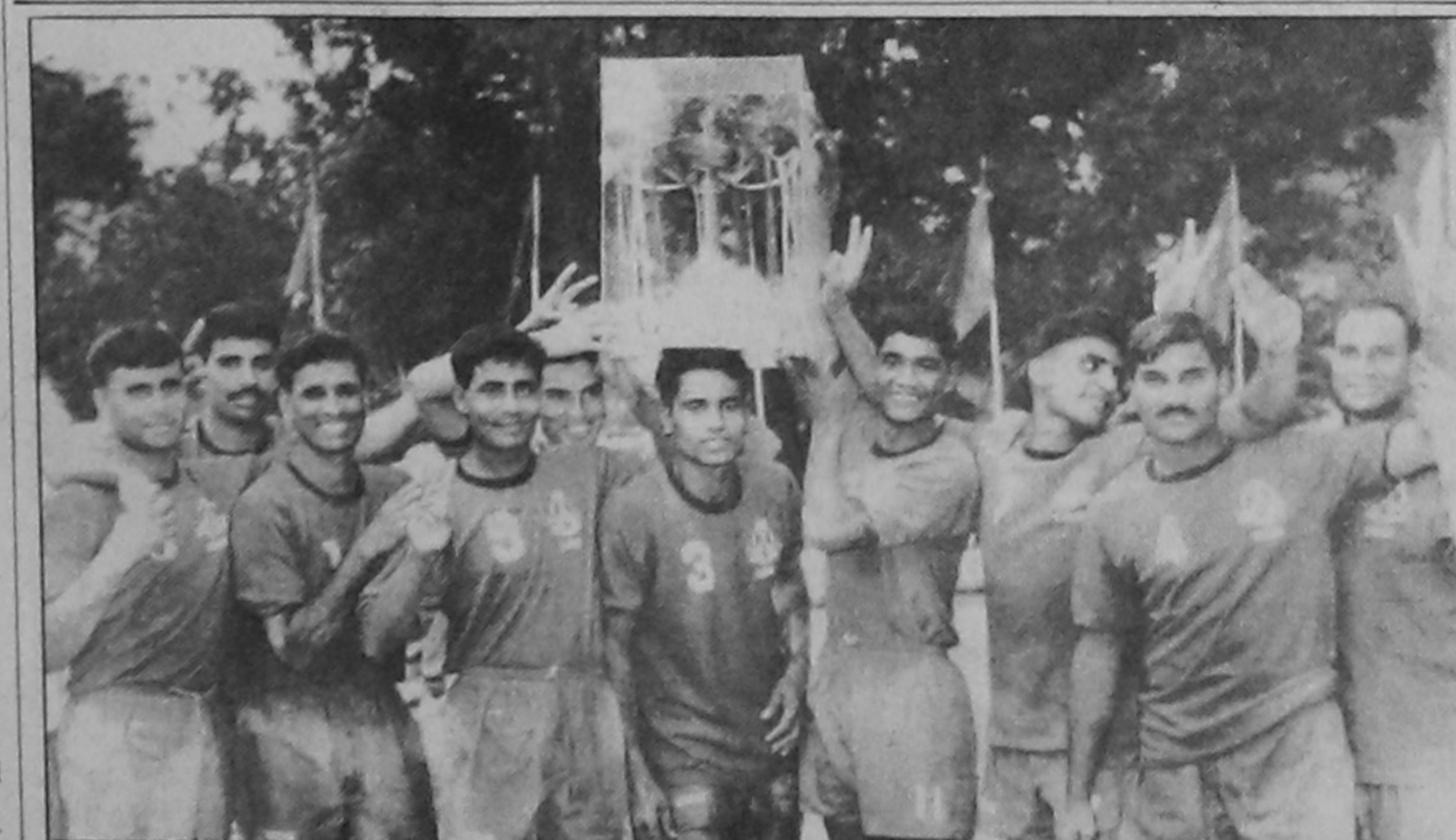
Bangladesh Rifles A team members celebrate with the trophy of the Premier Division Kabadi after their 81-69 victory over Rifles B in the last match of the league at the court near Bangabandhu National Stadium yesterday.