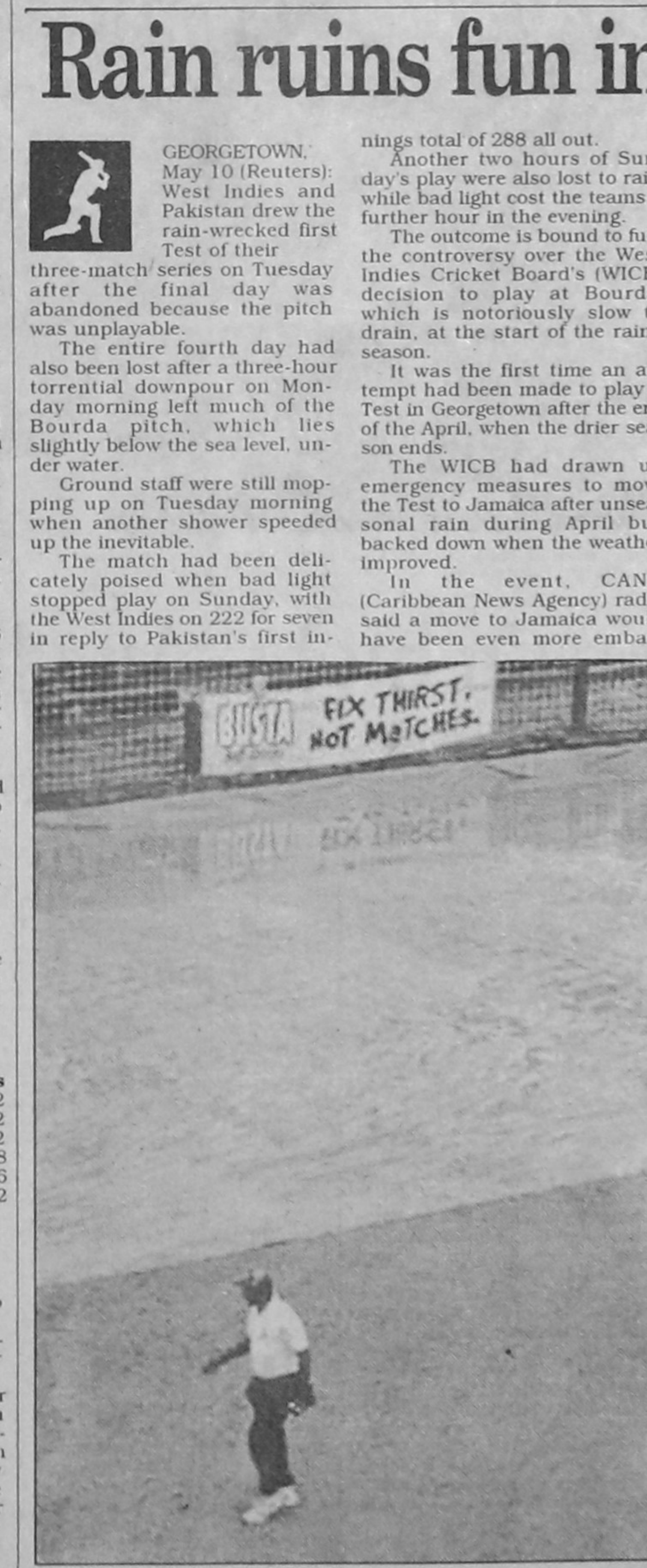
WASH OUT: An unidentified umpire takes a look at the flooded Bourda Cricket Ground during the first Test between the West Indies and Pakistan. The Test ended in draw.

Chandepaul shared a record seventh-wicket partnership for West Indies against Pakistan, with fast bowler Nixon McLean, who delighted the crowd with an entertaining 46 which included nine fours, three of them in one over from Mushtaq.