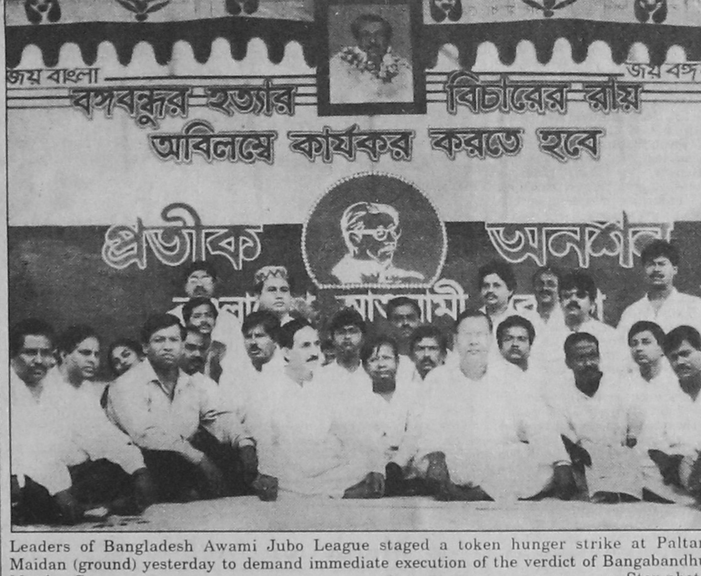
Leaders of Bangladesh Awami Jubo League staged a token hunger strike at Paltan Maidan (ground) yesterday to demand immediate execution of the verdict of Bangabandhu Murder Case.