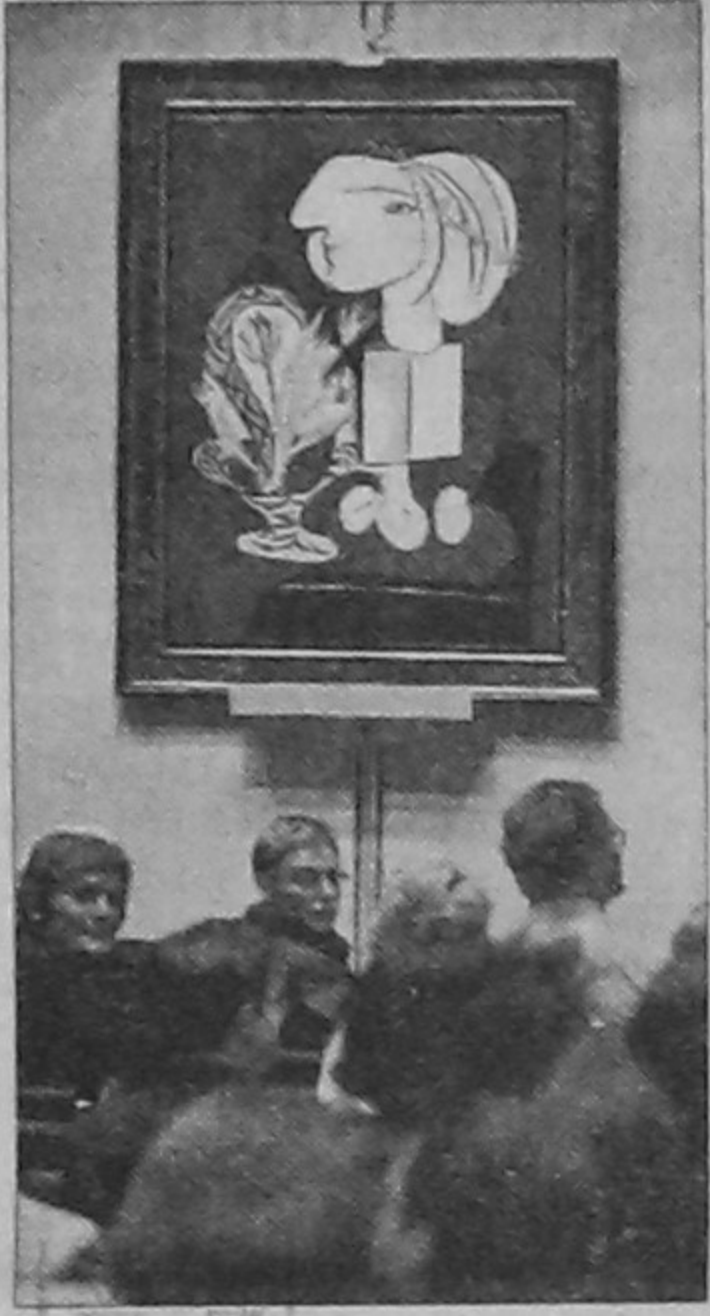
"Nature morte aux tulipes", a portrait by Pablo Picasso of his mistress Marie-Therese Walter, sold for 26 million US dollar at Christie's Spring 20th Century Art Sale on Tuesday.