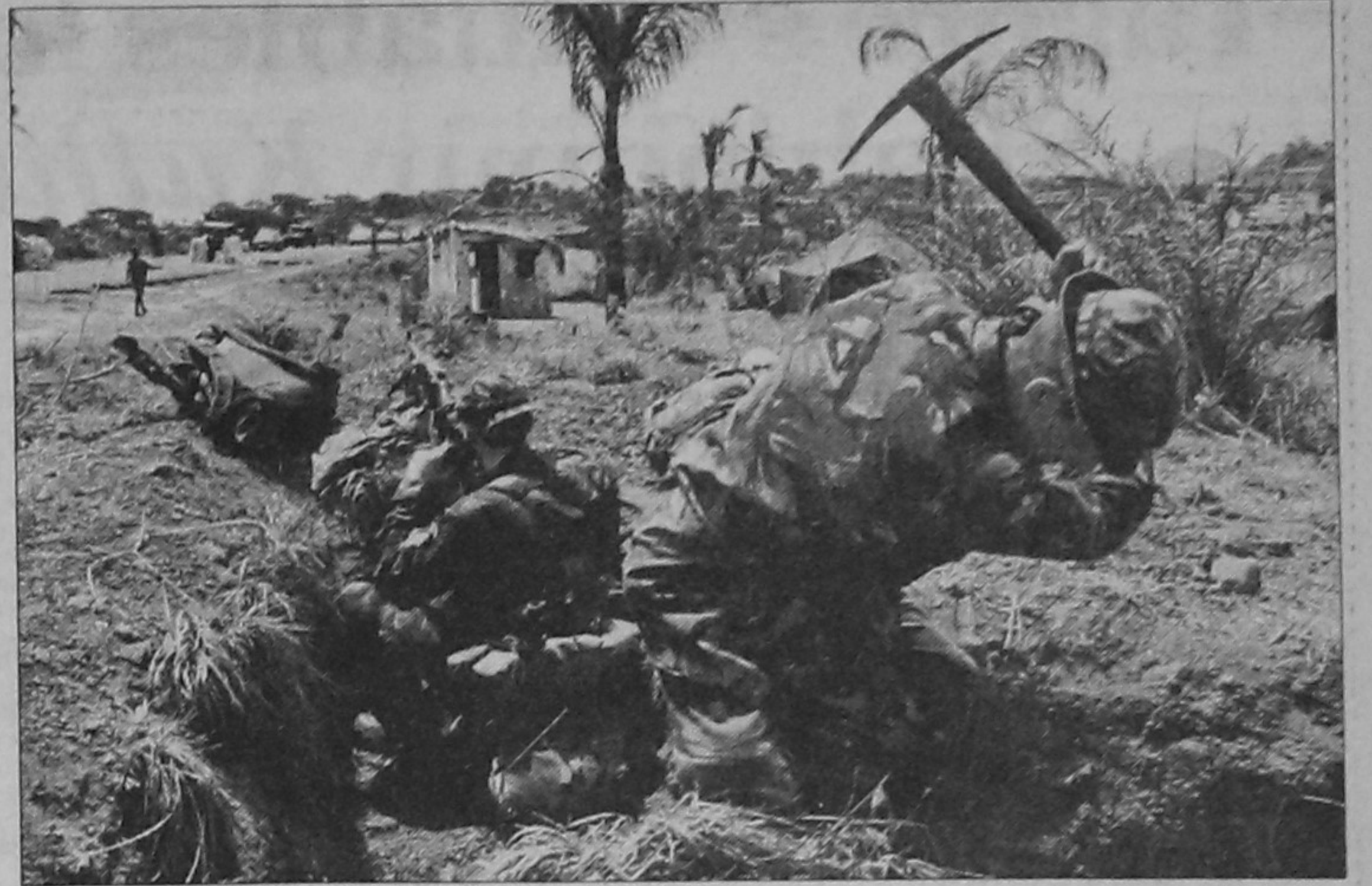
British soldiers set up position in Freetown on Tuesday. British troops evacuating foreign nationals from Sierra Leone could stay in Freetown to help the United Nations bring in reinforcements, but will not formally join the UN force as combat troops, British foreign Secretary Robin Cook said yesterday.