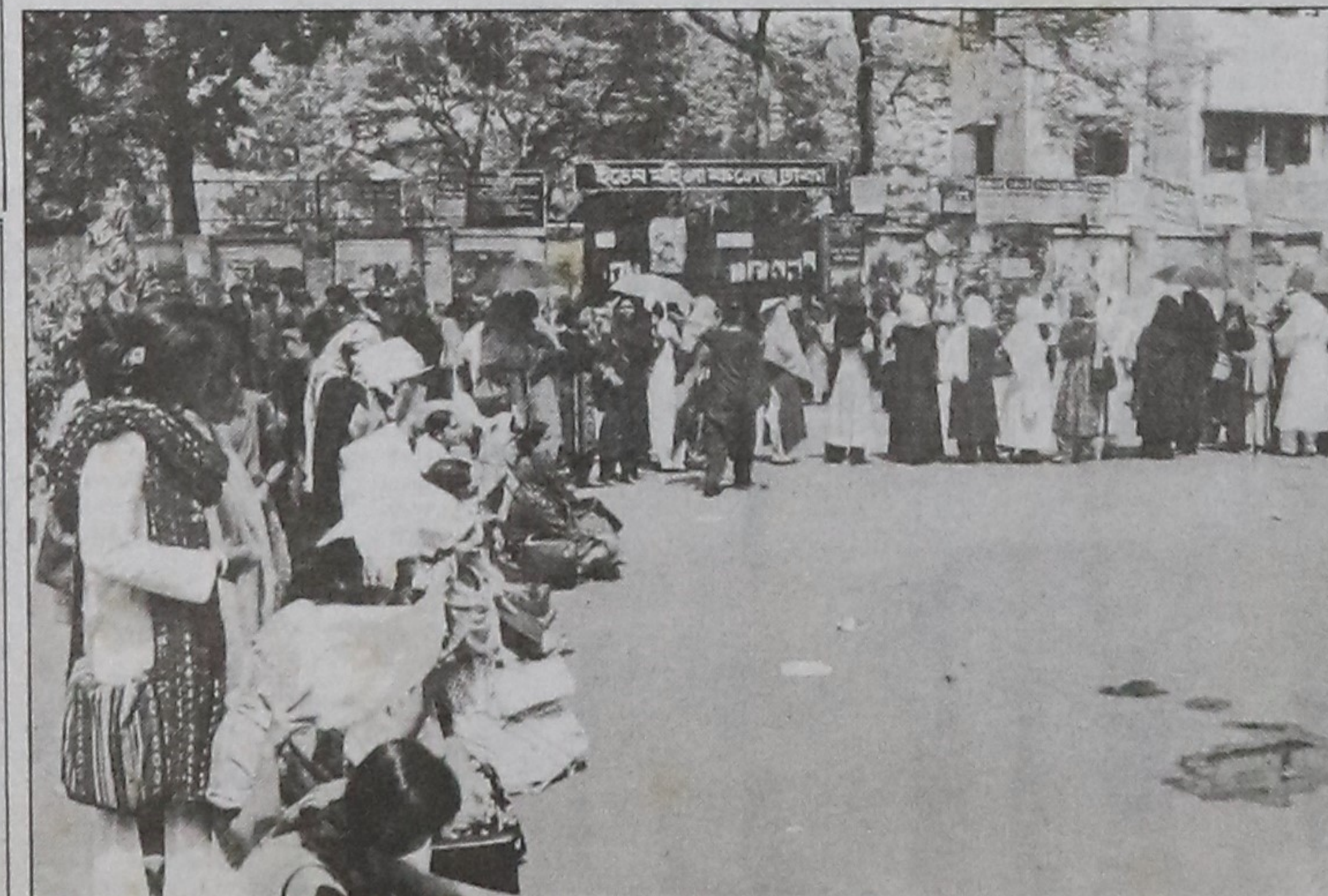
Students of Eden University College stage a sit-in demonstration on the road in front of the college yesterday demanding that the examinations be deferred.

The 200 suites of international standard in the Non-Aligned Meeting (NAM) village which are now under construction in the city areas would be allotted to Members of Parliament at the end of the NAM summit, reports BSS. Another 684 apartments which are also being constructed here would be allotted to government officers, an official handout said yesterday. It said 884 apartments and suites are being constructed at a cost of Tk 245 crore at Section 13 of Mirpur, Nakhla and Manik Mian Avenue for accommodating 3000 foreign guests who are expected to join, the NAM conference likely to be held here next year. The construction work of the NAM village apartments and suites are going on in full swing and is expected to be completed by June, 2001. Housing and Works Minister Engineer Mosharrif Hossain yesterday visited the under-construction sites of the village at Mirpur and Manik Mian avenue.