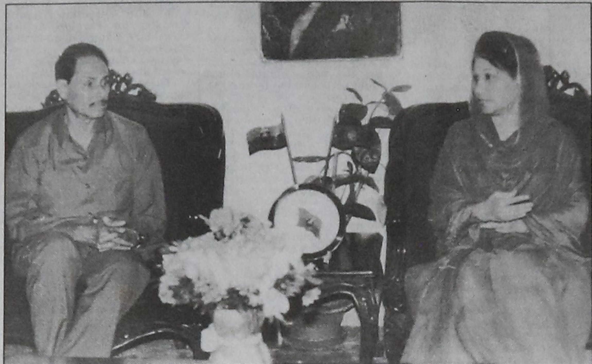
BNP Chairperson Khaleda Zia and Jatiya Party chairman H M Ershad discuss with Jamaat-Islami chief Golam Azam and other top Four-Party Alliance leaders (not in picture) the Opposition's reply to the Prime Minister's letter inviting the Leader of the Opposition in parliament to talks on appointing a chief election commissioner.

Bangladeshi expatriate, Hasina said the national airlines suffered due to various anomalies and wrong decisions of previous government. She said ministers concerned of the past government received kickbacks amounting to USD 20 million to buy two Airbus for Biman. Besides, Biman's ticket agents in New York and Japan looted crores of taka from selling tickets during the past regimes. The prime minister appreciated idea of issuing employment passports for expatriate workers to BAIRA's cops with fake passports. Hasina said she had instructed the Labour and Manpower Ministry to spend the money from labour welfare trust to set up vocational institute for training unskilled and semi-skilled labourers so that they could get better jobs abroad. Besides, Bangladeshi missions abroad has been asked to set up temporary offices in major cities of foreign countries and look into the problems faced by expatriated Bangladeshi nationals. The BAIRA president said nearly 50 lakh Bangladeshi workers are engaged in jobs in different countries, mainly in Middle East and South East Asia, earning about Tk 9,000 crore annually. He said the association plans to increase the wage earning to Tk 36,000 crore annually.