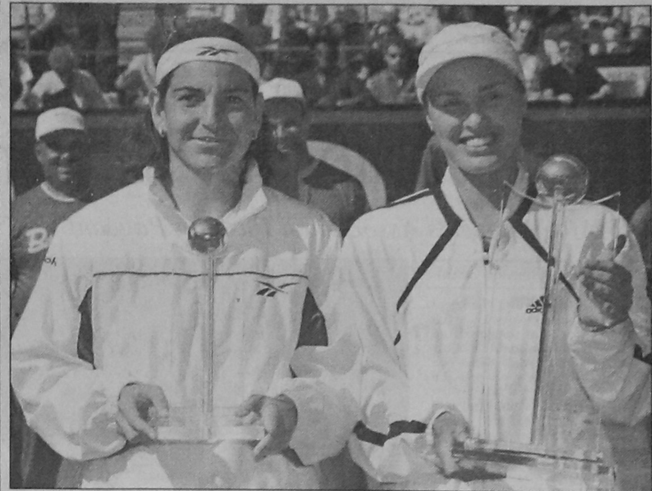
Martina Hingis of Switzerland (R) and Spaniard Arantxa Sanchez-Vicario pose with their trophies after the Betty Barclay Cup final on May 7.

In this form Safin threatens to make his Grand Slam mark in the French Open at the end of the month at Roland Garros.