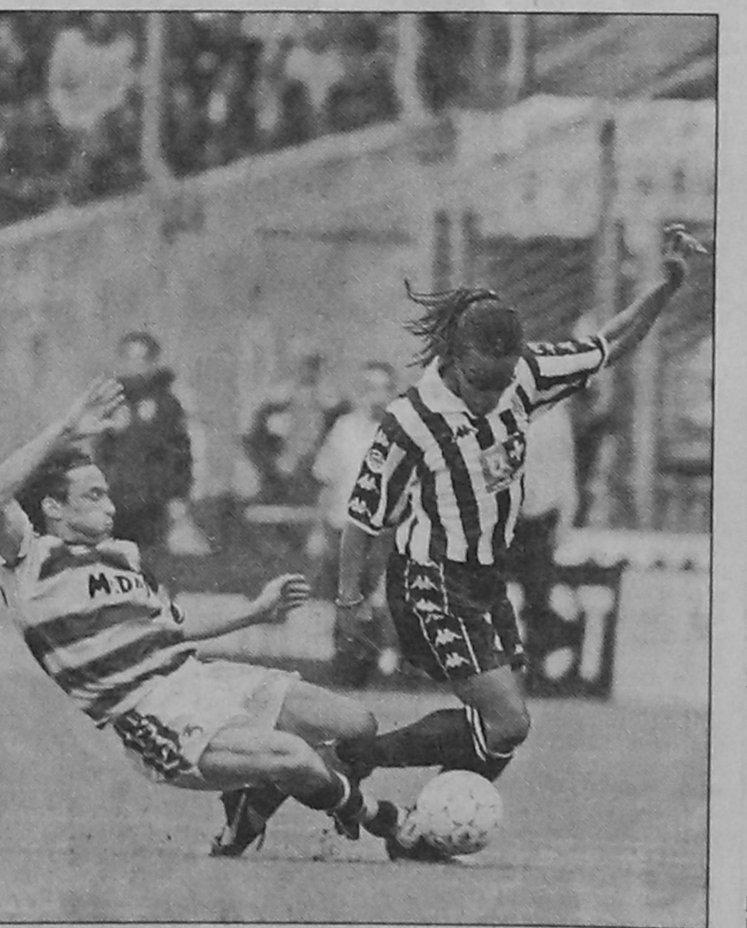
Edgar Davids (R) Juventus' Dutch international midfielder, being brought down following a tackle from Parma's Claudio Benarrivo during their Serie A fixture at Turin on May 7.

LIEGE, Belgium, May 8: Player pressure at out-of-sorts Belgian First Division outfit Standard Liege has resulted in the reappointment as coach of Tomislav Ivic seven months after his dismissal, reports AFP.