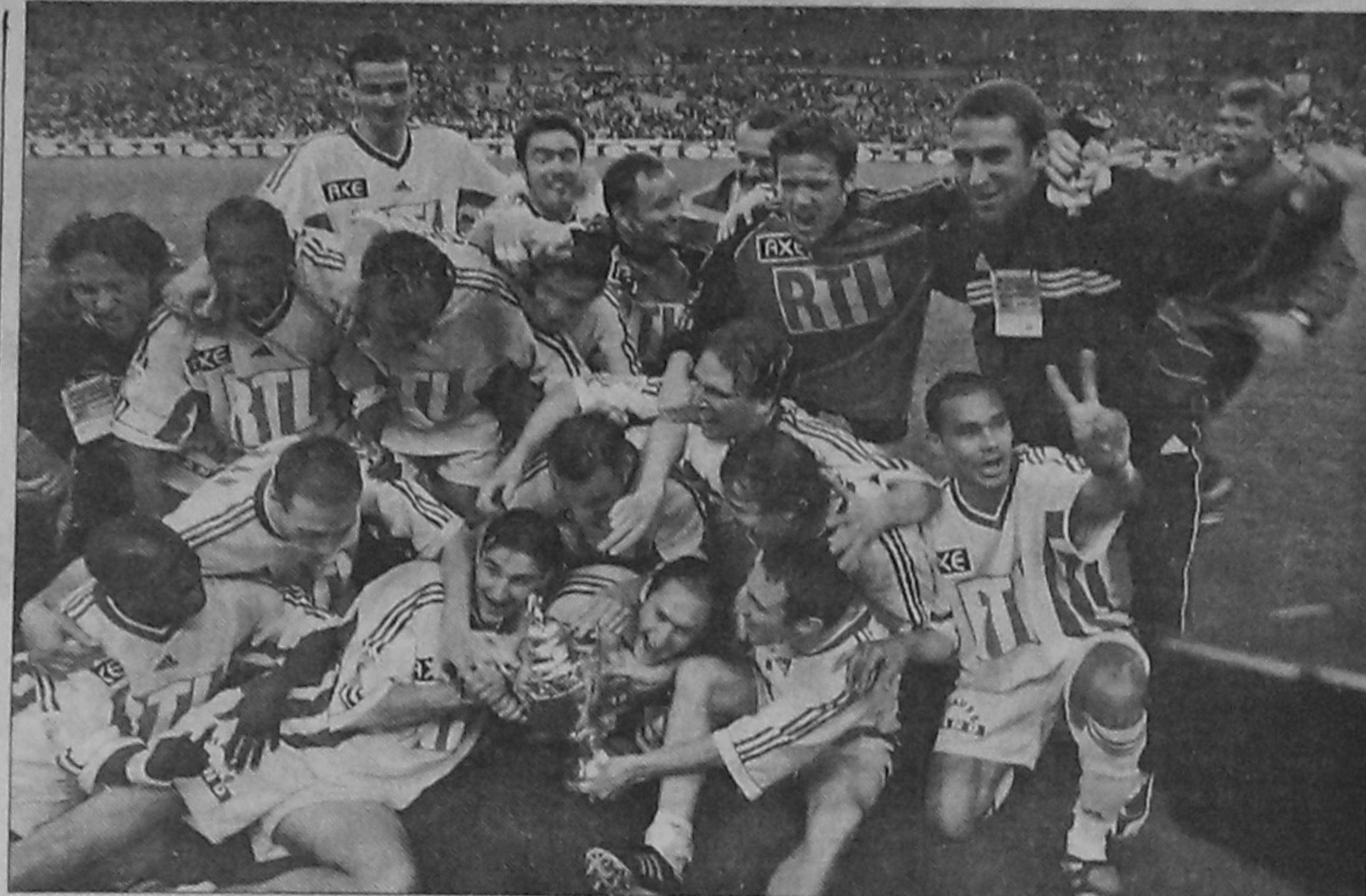
The victorious Nantes team celebrating their French Cup final victory over Calais at the Stade de France in Saint Denis on May 7.