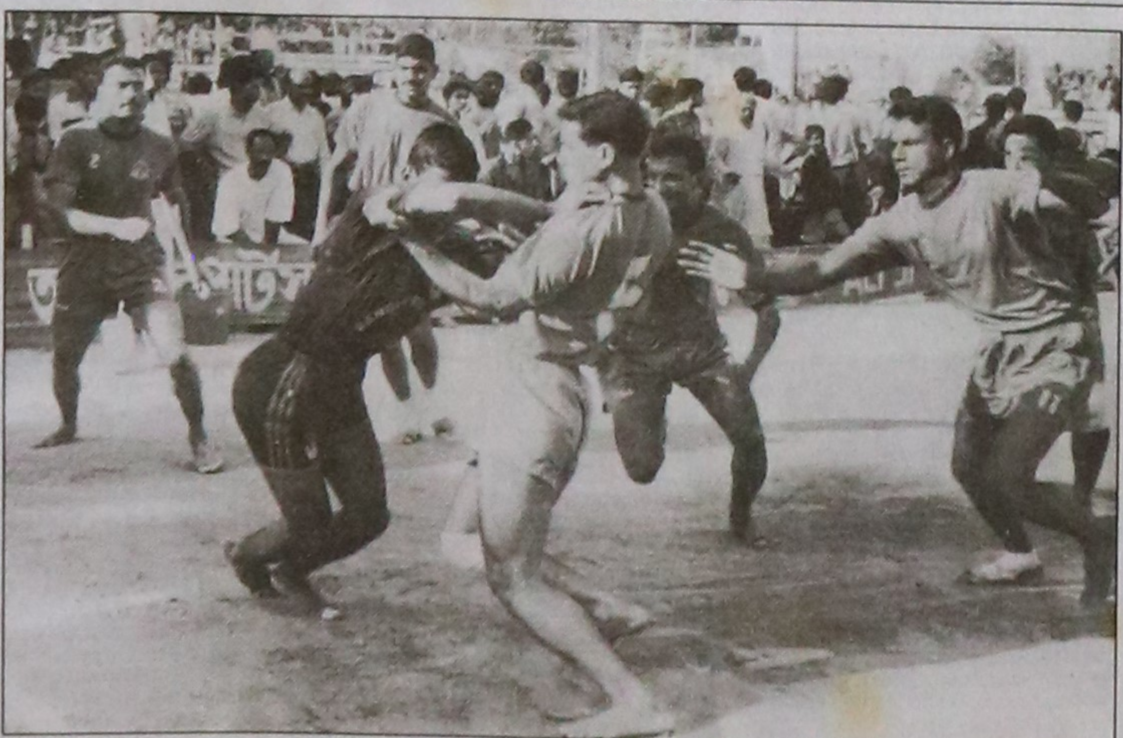
A scene from yesterday's Premier Division Kabaddi League match between Bangladesh Army and Bangladesh Rifles at the court next to Bangabandhu Stadium.