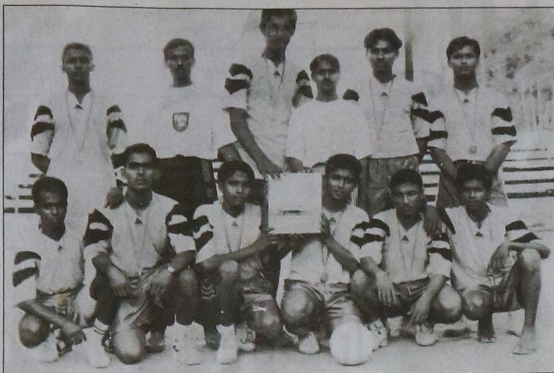
The Mothertek Abdul Aziz High School team who become volleyball champions.

Germany knocked England out of the 1990 World Cup semi-finals and the Euro 96 semi-finals - each time triumphing in a penalty shoot-out.