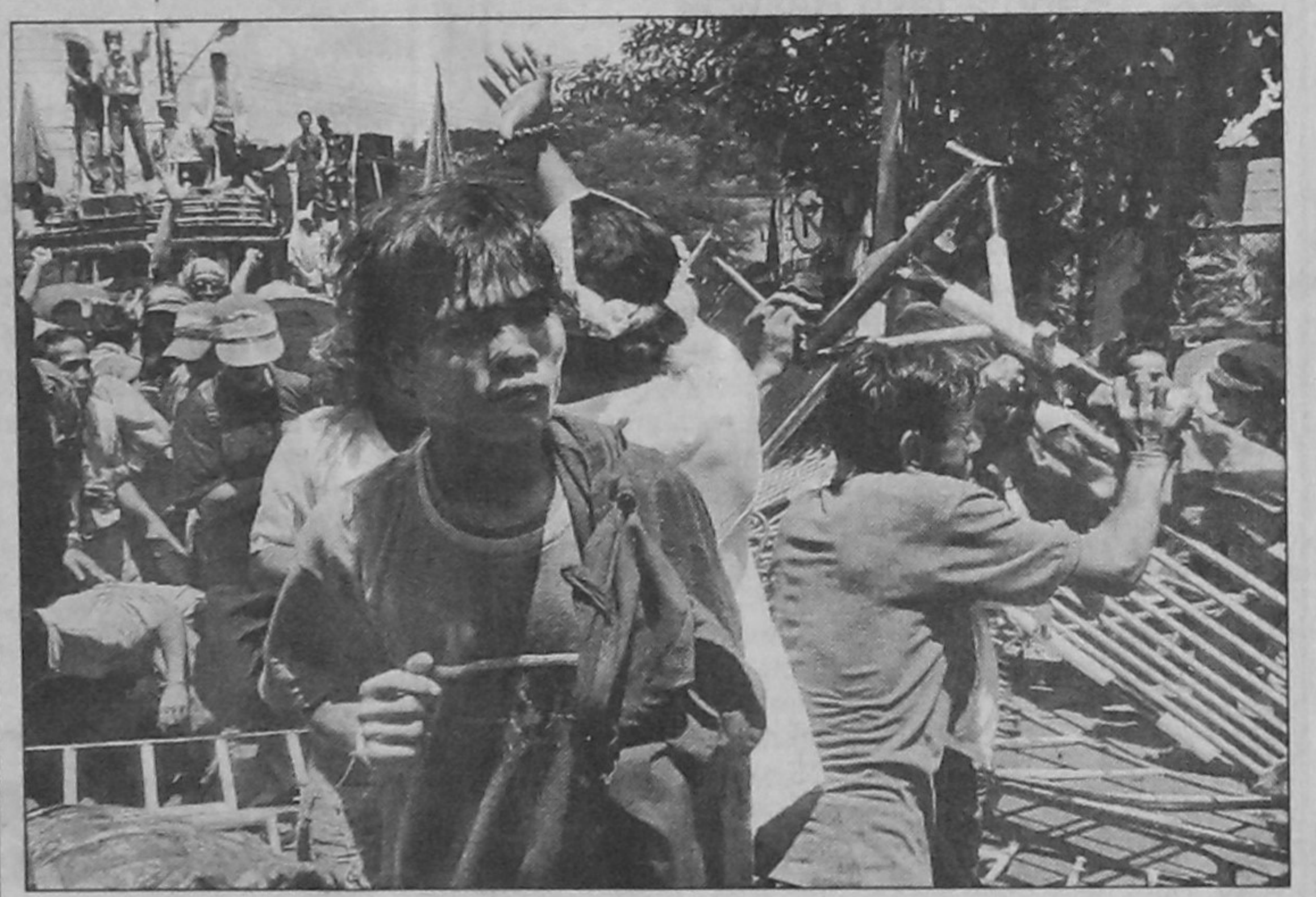
Anti-globalisation protesters break through barricades yesterday after piercing through a police line to reach the venue of the 33rd Asian Development Bank (ADB) conference in Thailand. A furious anti-capitalist mob surged to the entrance of the Westin Hotel, hosting the ADB meeting.