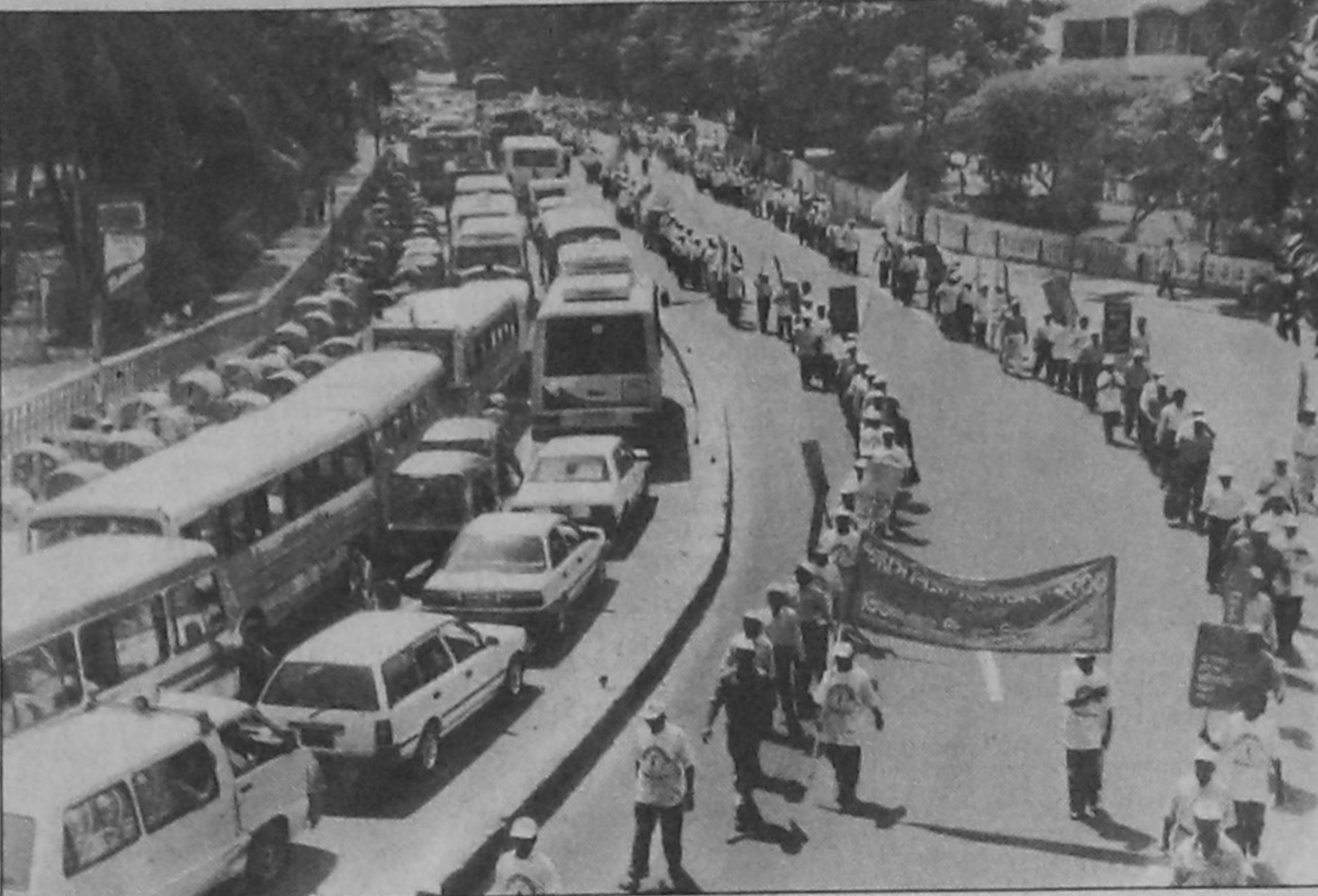
Yesterday, under the auspices of Petrobangla, a rally paraded through the busy city streets to mark the beginning of "Gas Security" week. We publish two pictures, one showing the rally, and the other showing the resultant traffic jam. We think it is highly irresponsible on the part of government bodies to block city streets during the peak traffic on weekdays already suffering from extreme congestion. Such useless and totally publicity oriented rallies are a nuisance and should be banned on weekdays. Isn't blocking traffic a crime under PSA?