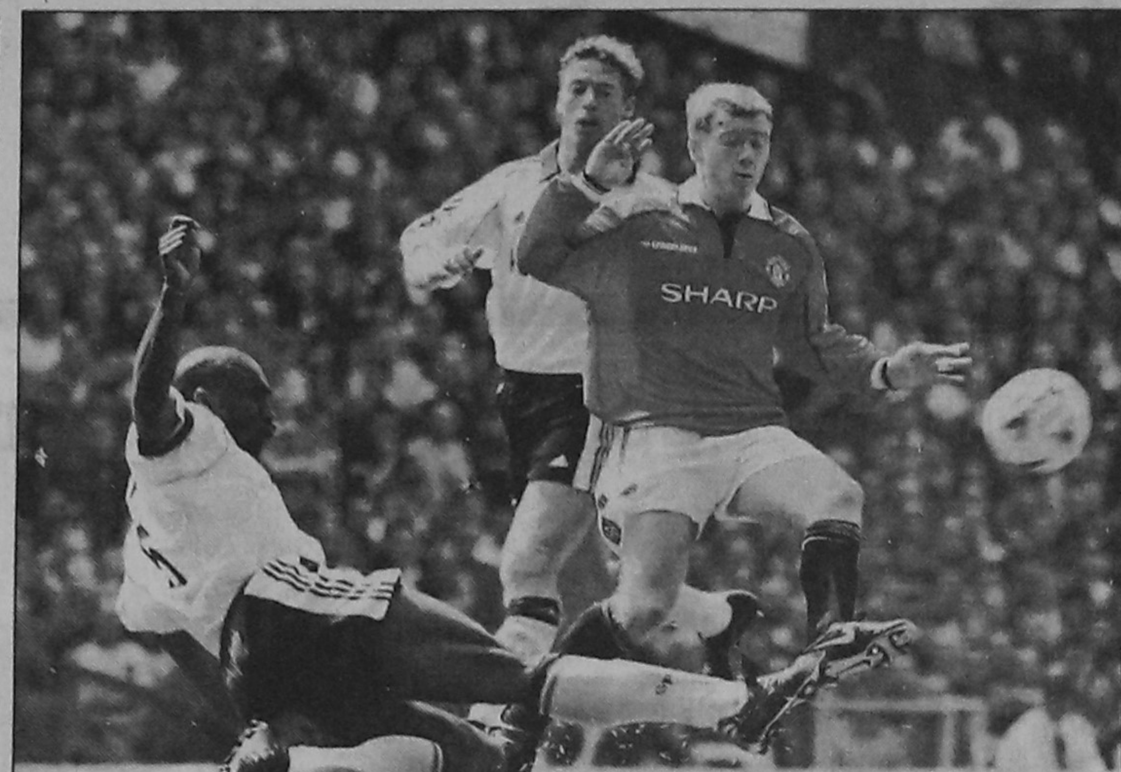
Manchester United's Paul Scholes (R) comes under a sliding tackle from Sol Campbell of Tottenham Hotspur during their Premiership clash at Old Trafford yesterday.