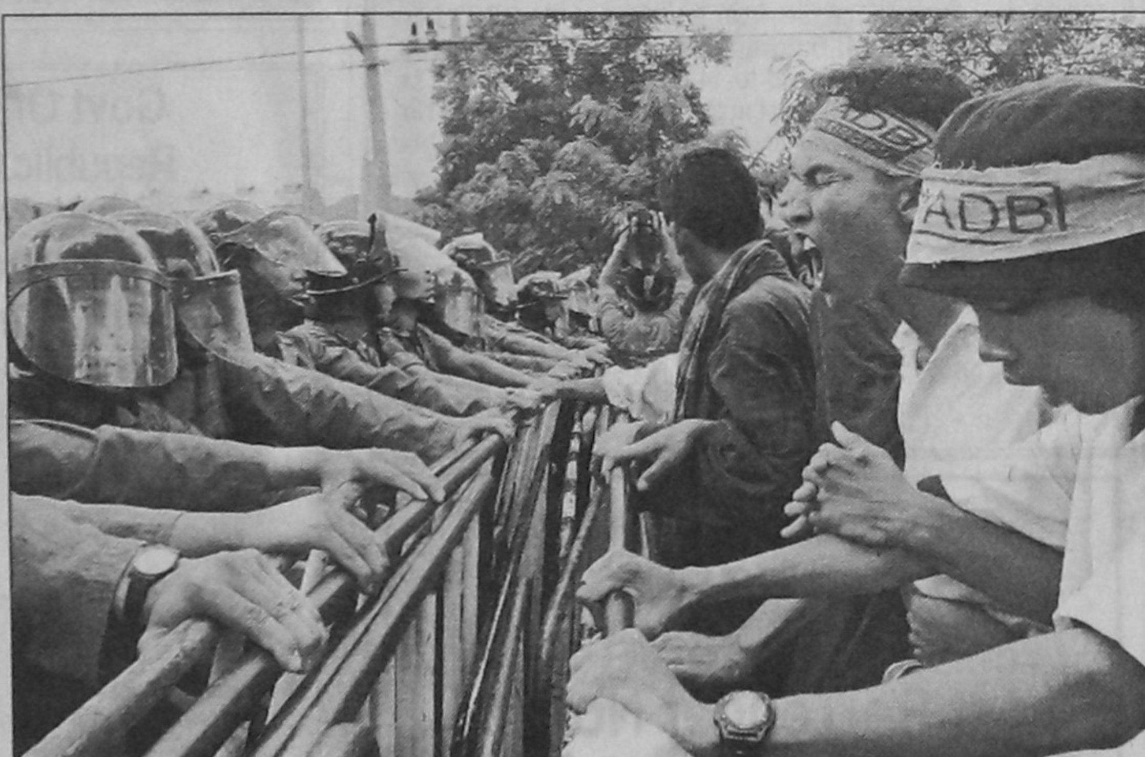
Anti-globalisation protesters chant slogans while trying to go through a police barricade manned by Thai riot police yesterday to reach the venue of the 33rd Asian Development Bank (ADB) meeting.