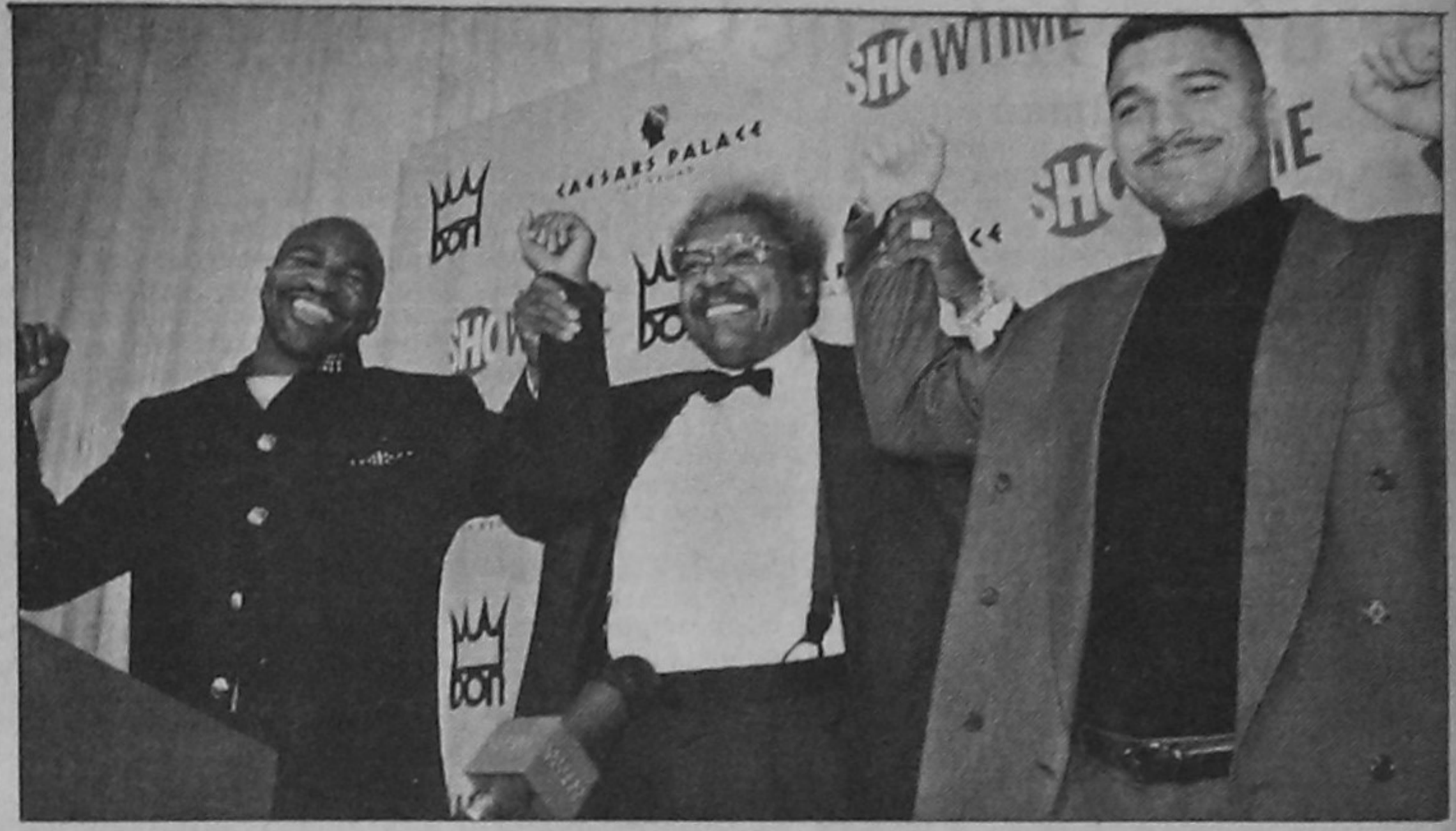
Former heavyweight champion Evander Holyfield (L) and his challenger John Ruiz (R) pose with promoter Don King the press conference at the Caesars Palace on May 4.

"I am innocent and have done absolutely nothing wrong and I am being chased and harassed for nothing."