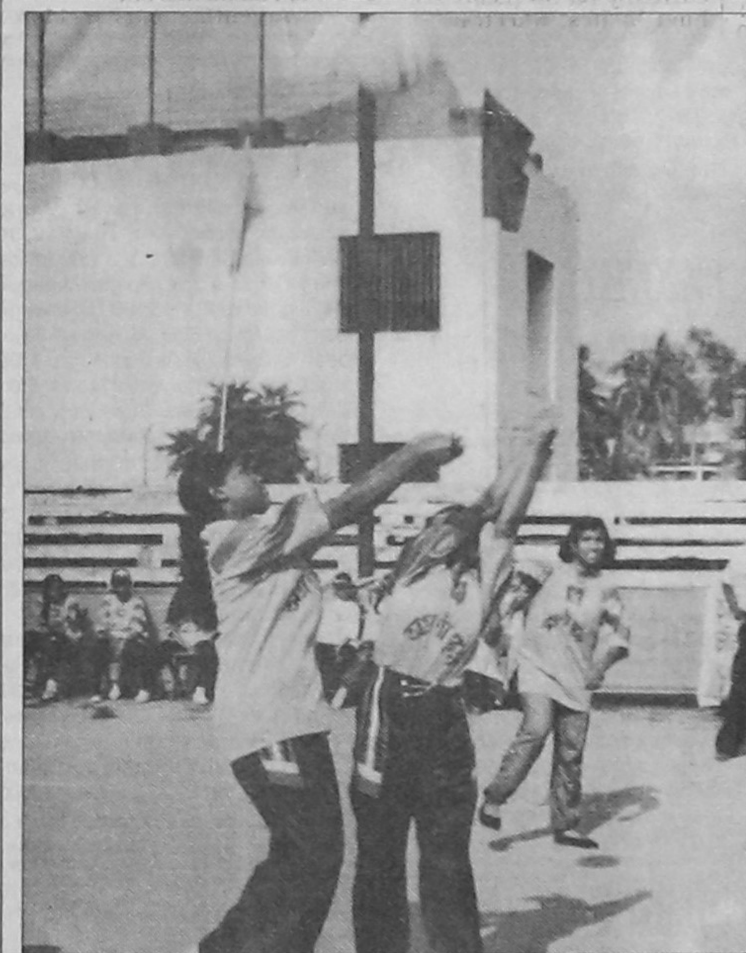
Scene from the IT Excel Schools volleyball competition match between Agrani Balika Bidyalaya and BIT Gulshan at the court near Bangabandhu National Stadium yesterday.