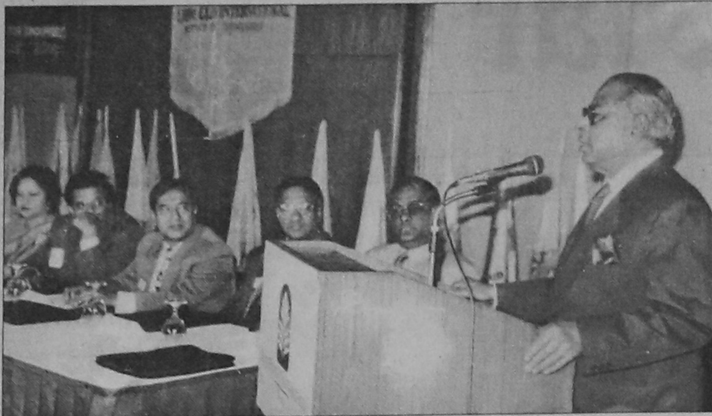
Finance Minister Shah A M S Kibria speaking at the 5th annual convention of Lions Club International Dist 315A1 held at a city hotel yesterday.