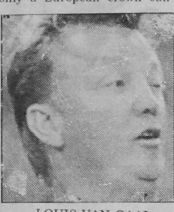
LOUIS VAN GAAL

Tuesday's 4-1 hiding by neighbours Valencia in their Champions Cup semi-final first leg has left Barca's Dutch coach Louis Van Gaal with plenty of food for thought after his team choked on an extravagant helping of "paella valenciana".