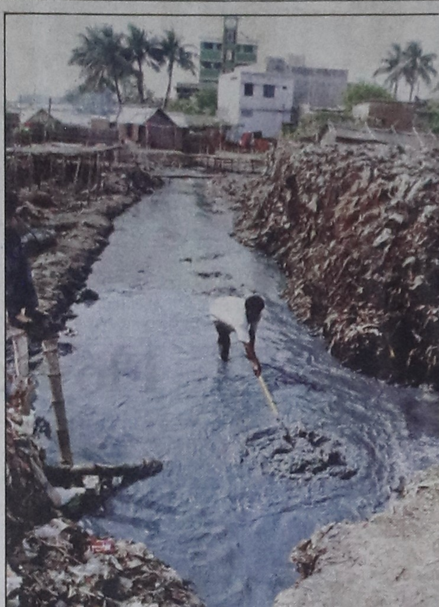
Poisoning the lifeline As administrative activism to save the Buriganga remains restricted to forming one committee after another, tanneries in the city's Hazaribagh area continue mindless dumping of toxic waste into the river.

Chromium and lead-mixed toxic waste from tanneries at Hazaribagh is eating the Buriganga River away while the authorities are yet to come up with a permanent solution. About 300 tanneries, big and small, operate in Hazaribagh, and almost all of them do not have any waste treatment plant. The tanneries are dumping their effluents straight down the sewer into the river. A Department of Environment survey three years ago found that the river is not only highly polluted with the untreated waste, but also being encroached upon by illegal constructions. A long stretch of Buriganga from Mohammadpur to Pagla at downstream has become septic where fish and aquatic animals are dying. Chromium and lead among other chemicals are used to process the raw hide at the tanneries. A visit to the Hazaribagh down the embankment will show anyone a thick light blue sludge flowing down the river. There had proposals to shift the tanneries to Dhamrat. But the tanneries refused to move and more proposals to install waste treatment plants fell into deaf ears. There had also been proposals to set up lagoons to store the wastes. But the tannery lobby is so powerful that they have thwarted all moves so far to streamline them.