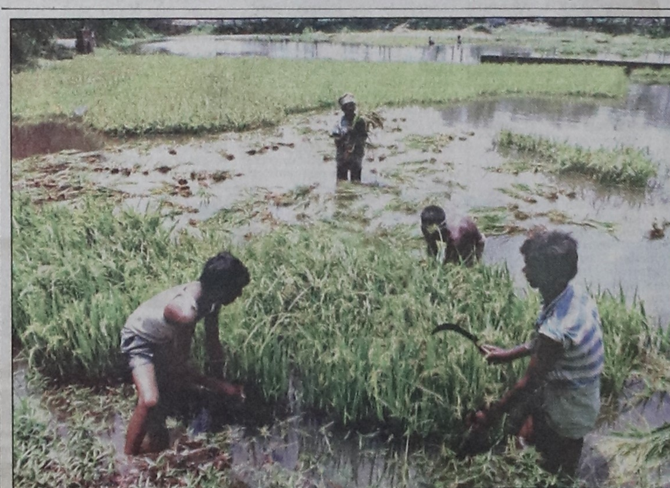
Desperate reapers With all hopes of a full harvest water-logged, farmers at a village in Sonargoan try to get whatever there is left.