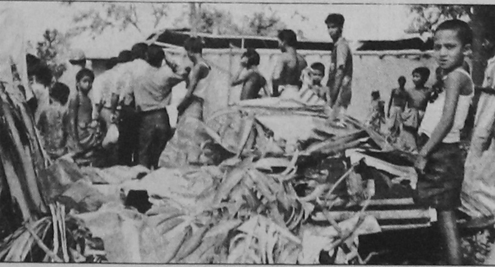
People stand amidst crumpled up tins that were blown away during the nor'wester that hit Baghmara and Mohonpur thanas in Rajshahi. The April 28 storm razed scores of villages under the thanas rendered thousands homeless.