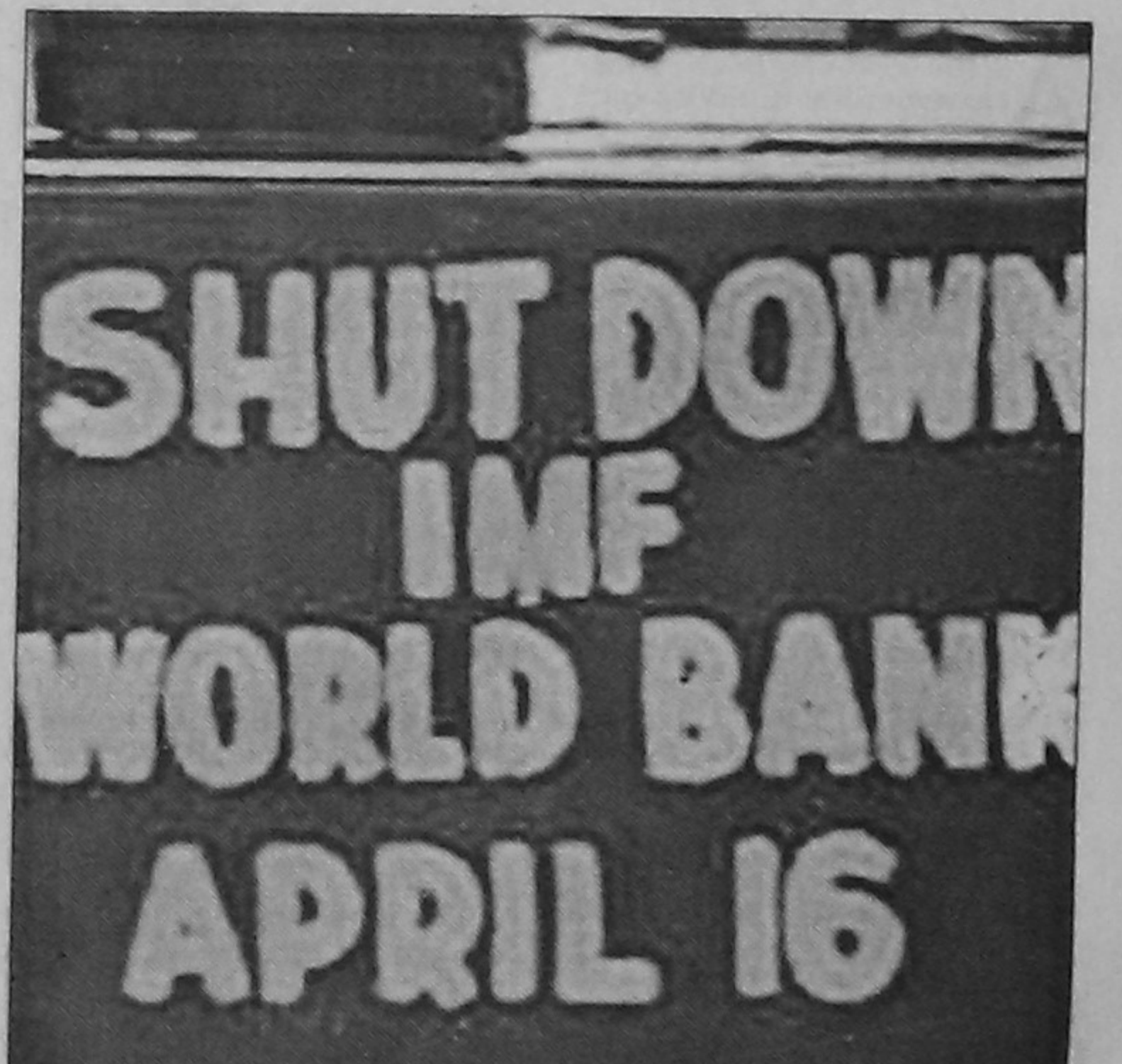
The placard said it all ...

I was often asked how smart — even brilliant — people could have created such bad policies. One reason is that these smart people were not using smart economics. Time and again, I was dismayed at how out-of-date — and how out-of-tune with reality — the models Washington economists employed were.