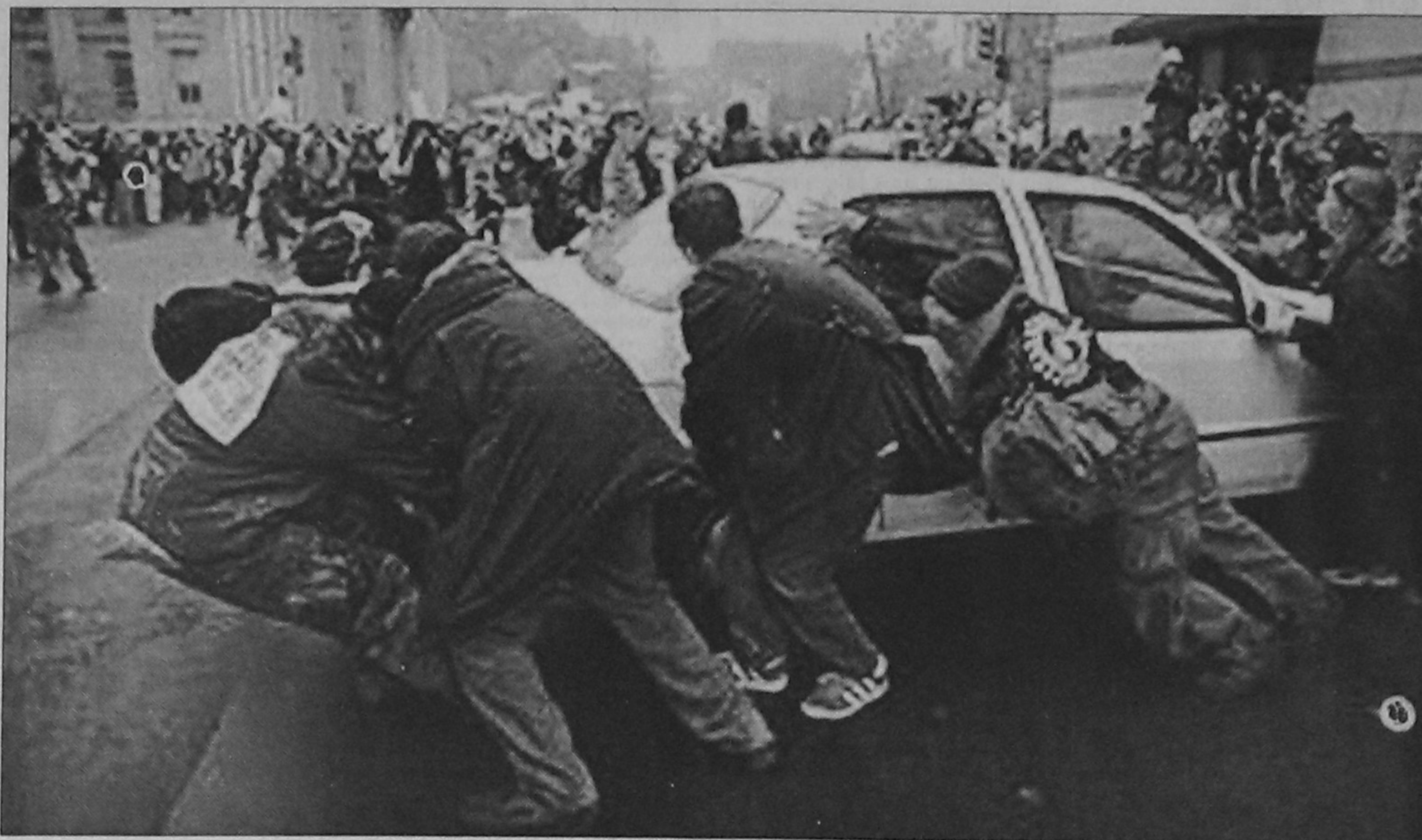
Resorting to violent means to make IMF listen to the developing countries it is supposed to help

Convincing people at the World Bank of my analysis proved easy; changing minds at the IMF was virtually impossible. When I talked to senior officials at the IMF — explaining, for instance, how high interest rates might increase bankruptcies, thus making it even harder to restore confidence in East Asian economies — they would at first resist. Then, after failing to come up with an effective counter-argument, they would retreat to another response: if only I understood the pressure coming from the IMF board of executive directors — the body, appointed by finance ministers from the advanced industrial countries, that