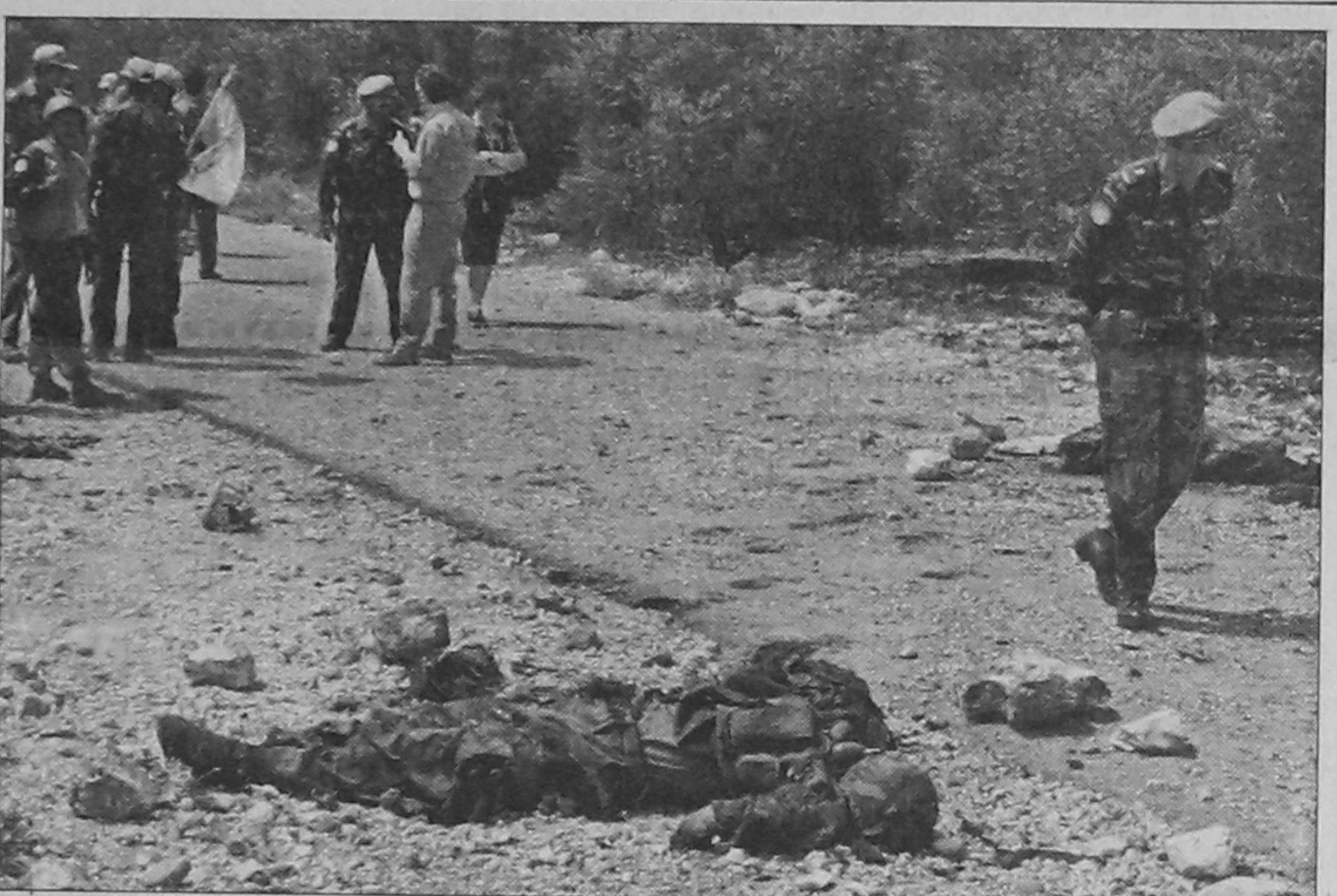
An Indian UN peacekeeper passes the body of a Hezbollah fighter killed during a two-hour clash between the militant group and the Israeli-allied South Lebanon Army (SLA) militia yesterday. SLA said three Hezbollah guerrillas were killed in fighting late Wednesday, when a Hezbollah unit infiltrated the eastern sector of the Israeli-occupied zone of south Lebanon and clashed with SLA and Israeli forces near the village of Burghuz.

LISBON, May 4: The UNITA rebels claimed Wednesday to have killed 454 Angolan government soldiers in fighting during the last few days of April, reports AFP. UNITA, in a statement sent to AFP in Lisbon by Jonas Savimbi's movement, also claimed to have destroyed eight government tanks and seized a large quantity of munitions. Savimbi's movement also claimed to have downed a government helicopter on April 27 and accused the government side of bombarding several villages in the central province of Bie the next day with napalm and phosphorus. No figures were given for rebel casualties. The United Nations in 1993 banned sales of arms, military equipment and fuel to UNITA, which has been at war with the Angolan government since independence in 1975. The Angolan army launched an operation last September to drive out UNITA. UNITA rebels have battled the ruling People's Movement for the Liberation of Angola with little respite since independence from Portugal despite the signing of a peace agreement in Lusaka in 1994.