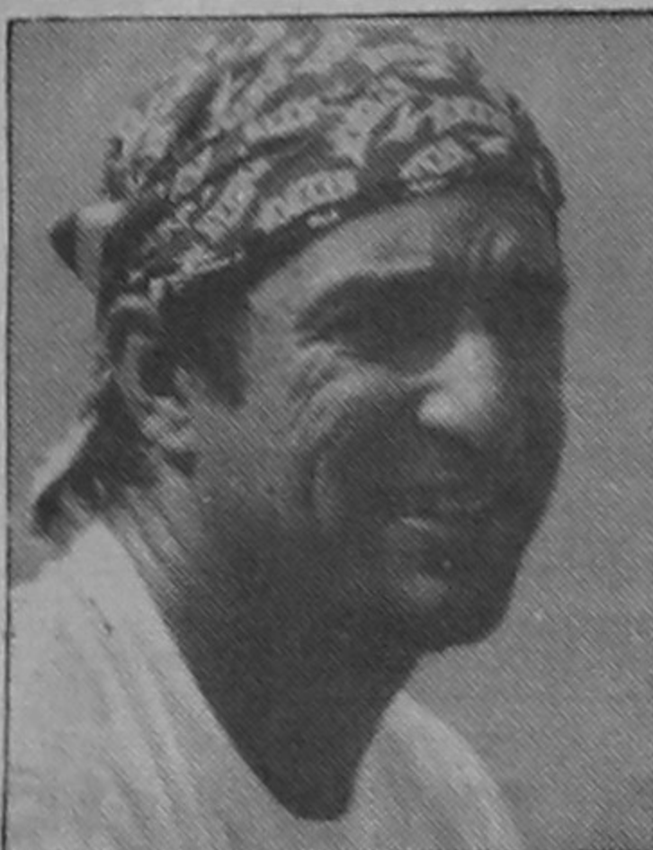
Wasim Akram (Former Pakistan cricket captain)

"As far as I myself am concerned, I know that I haven't done anything wrong, and no-one can point the finger at me. I think Bangladesh played well, fair and square, and they won the game fair and square."