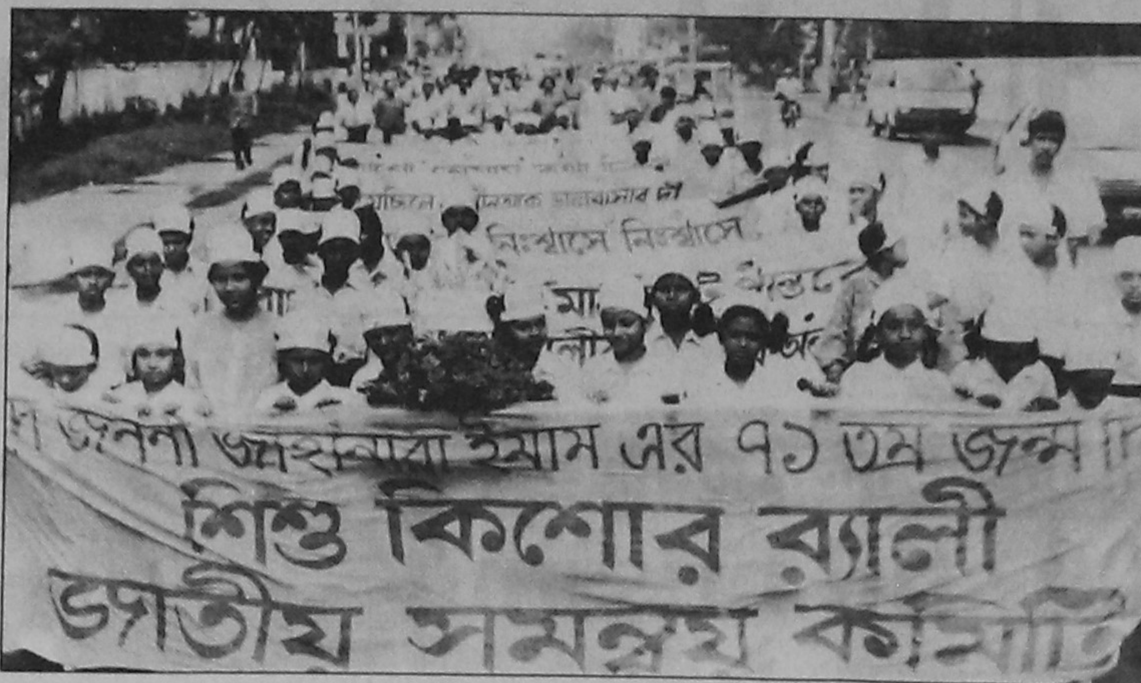
Jatiya Samannaya Committee held a children's rally and brought out a procession in observance of the 71st birth anniversary of Shaheed Janani Jahanara Imam in the city yesterday.