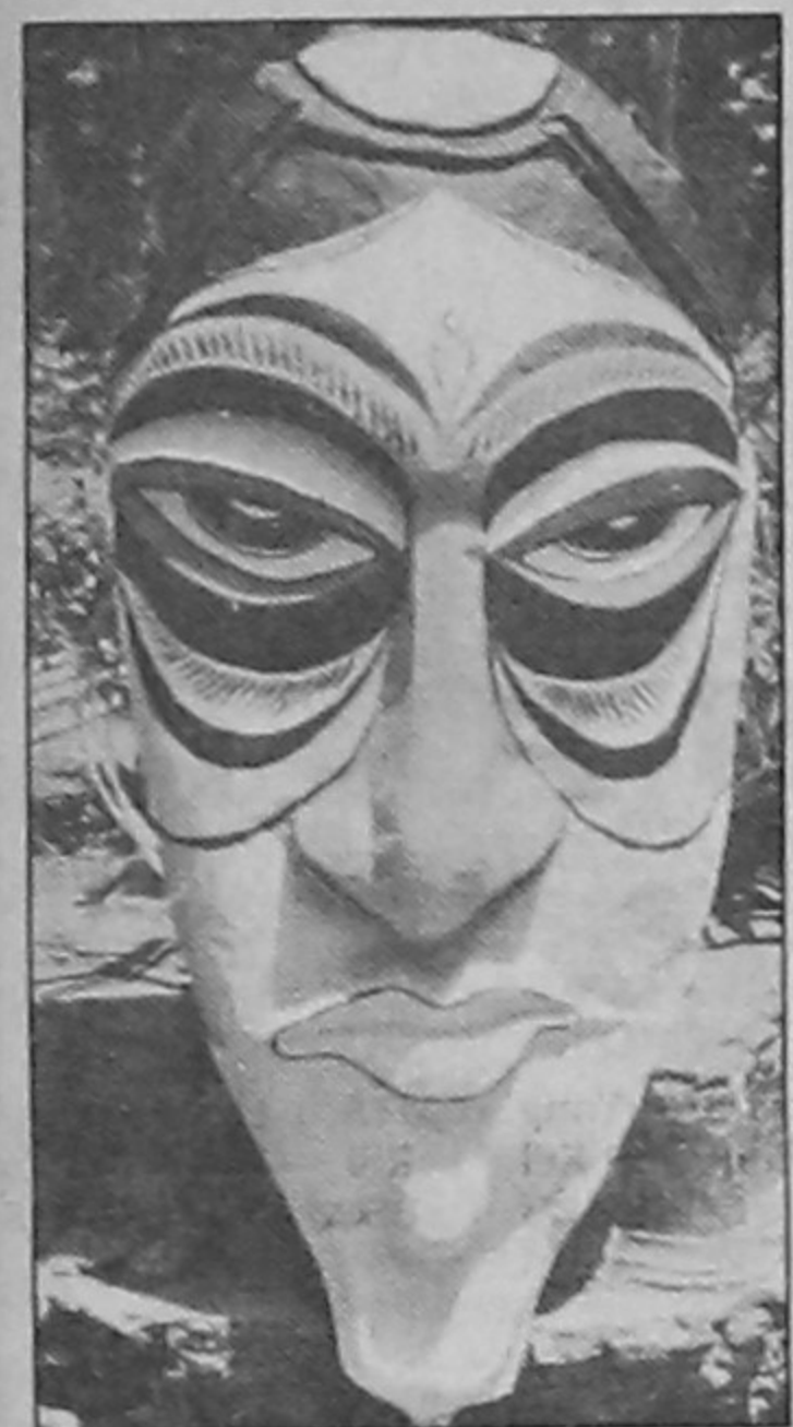
A colourful mask

THE Art Gallery of the Indian Cultural Centre is beaming with the array of colourful art works created for the Baishakh Utsab by the students of the Institute of the Fine Arts. Baishakh brings the sense of renewed joy with its