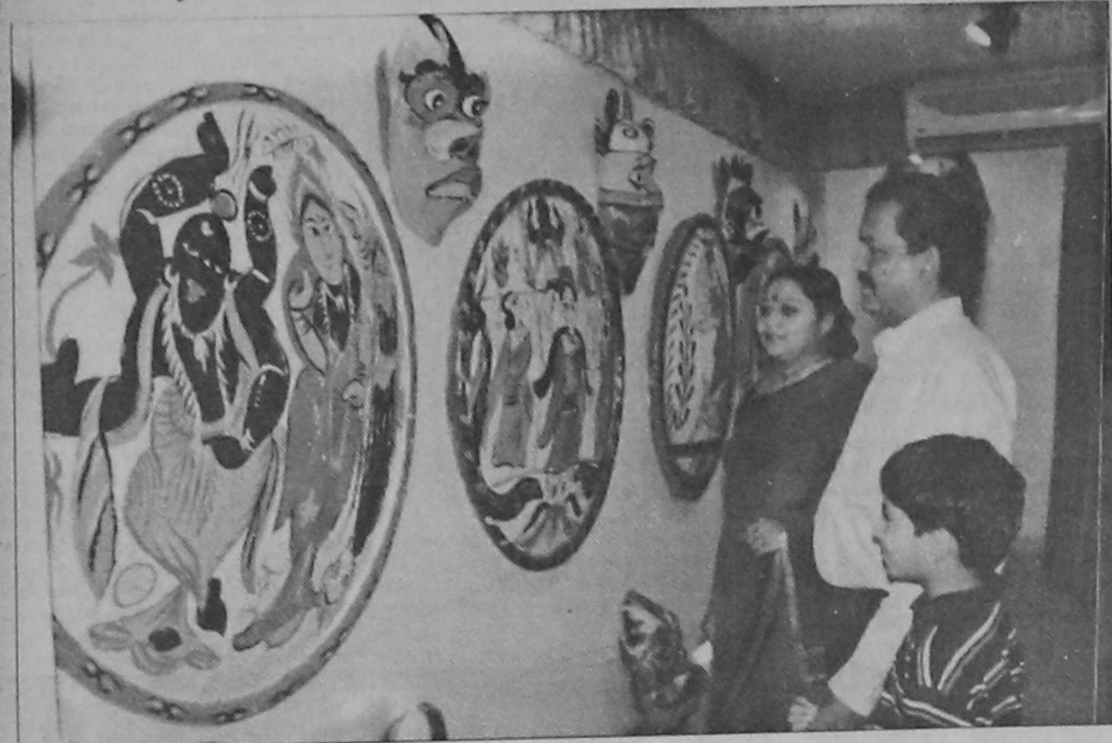
Viewers enjoying the exhibition

A colourful Art work exhibition featuring traditional Bengal